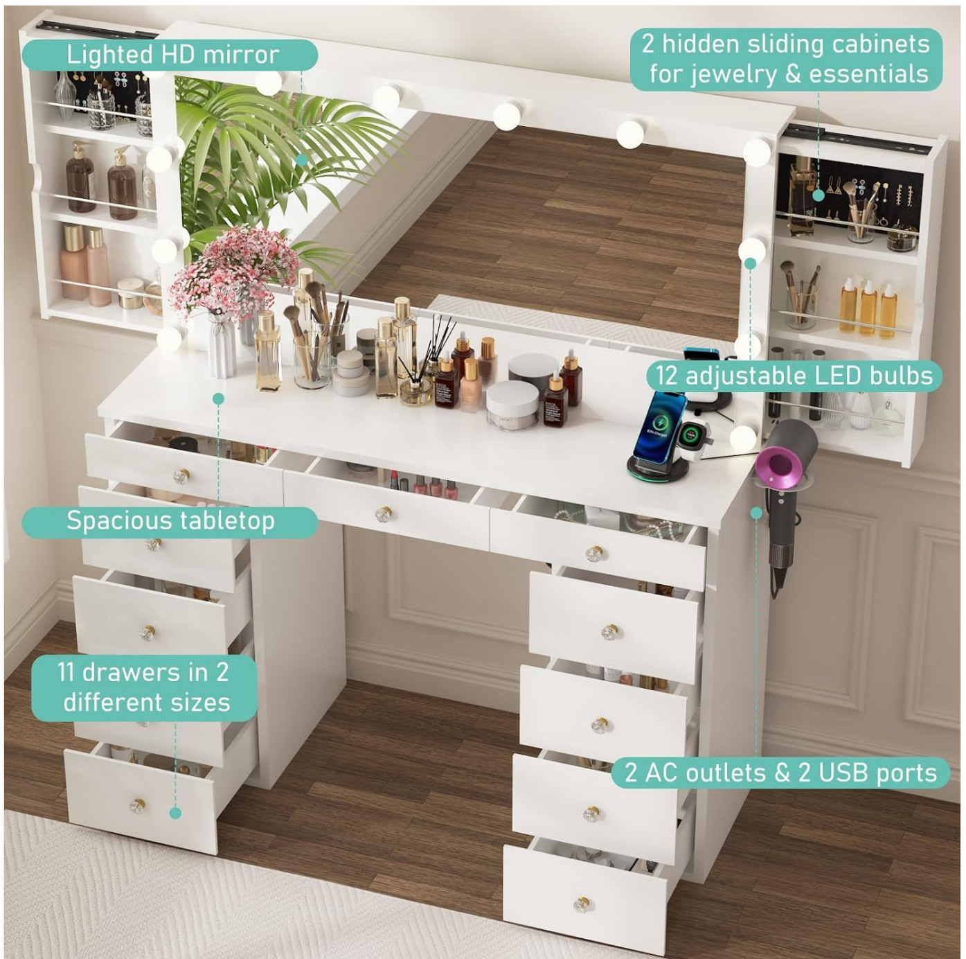
Figure 2: Overview of the vanity desk with drawers open, illustrating the various storage compartments and the hairdryer holder.