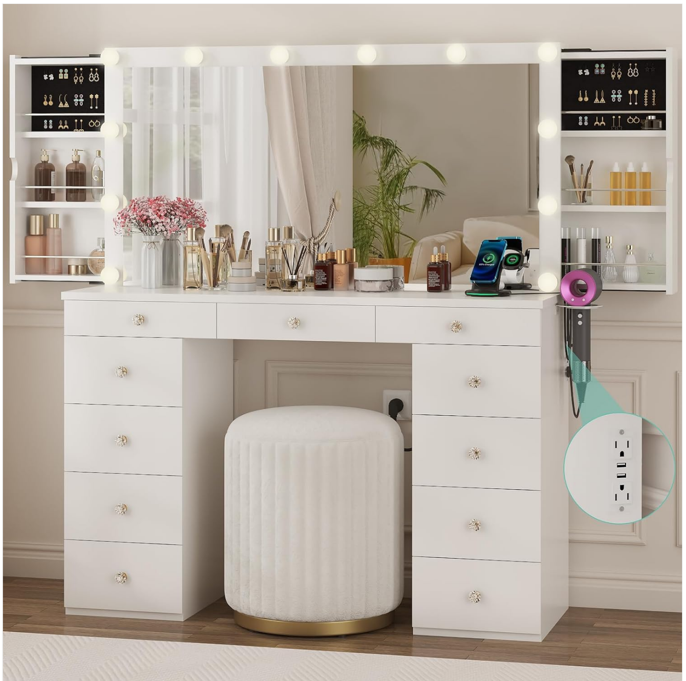
Figure 1: The Likein Vanity Desk, featuring a large mirror with lights, multiple drawers, and integrated storage.