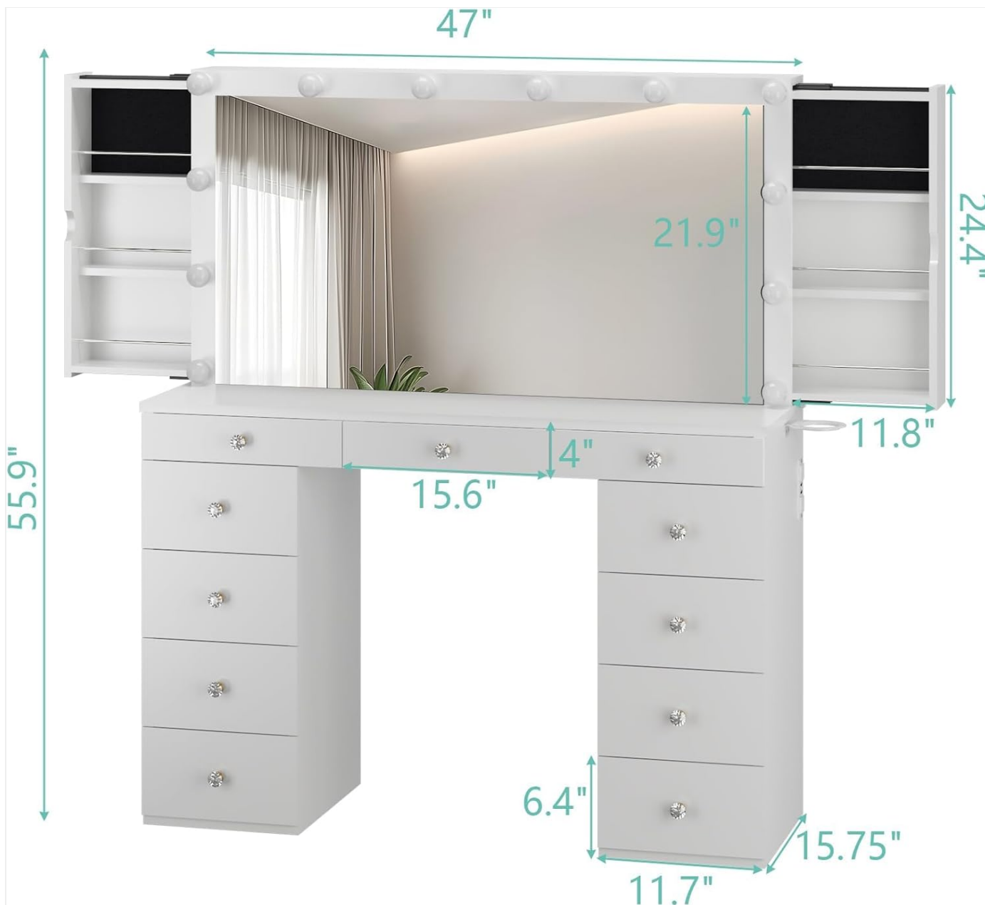
Figure 7: Detailed dimensions of the Likein Vanity Desk.