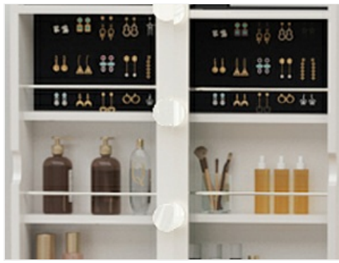
Figure 6: Detailed view of the jewelry storage compartment behind the sliding mirror panel.