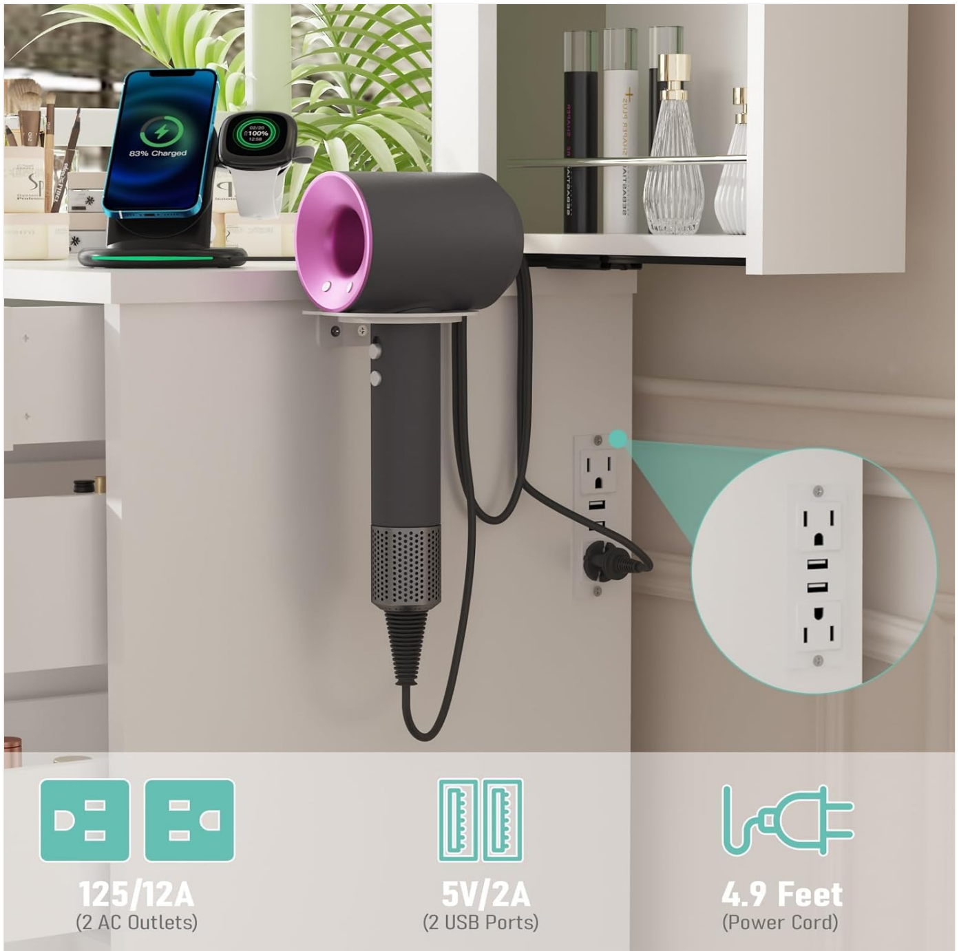
Figure 5: Close-up view of the charging station with two AC outlets and two USB ports, along with the hairdryer holder.