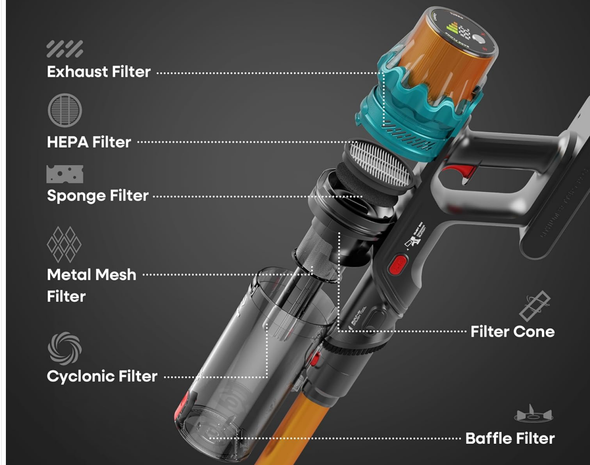
Image: Detailed view of the 7-layer filtration system components.

7-Layer filtration traps 99.9% of microdust, pet hair and allergens.