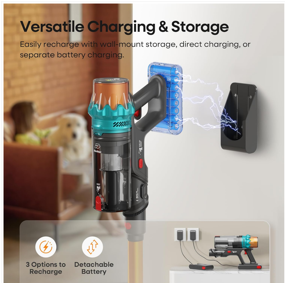
Image: Visual representation of the three charging methods for the vacuum cleaner.

A full charge takes approximately 4 hours and provides up to 70 minutes of runtime in hard floor mode.