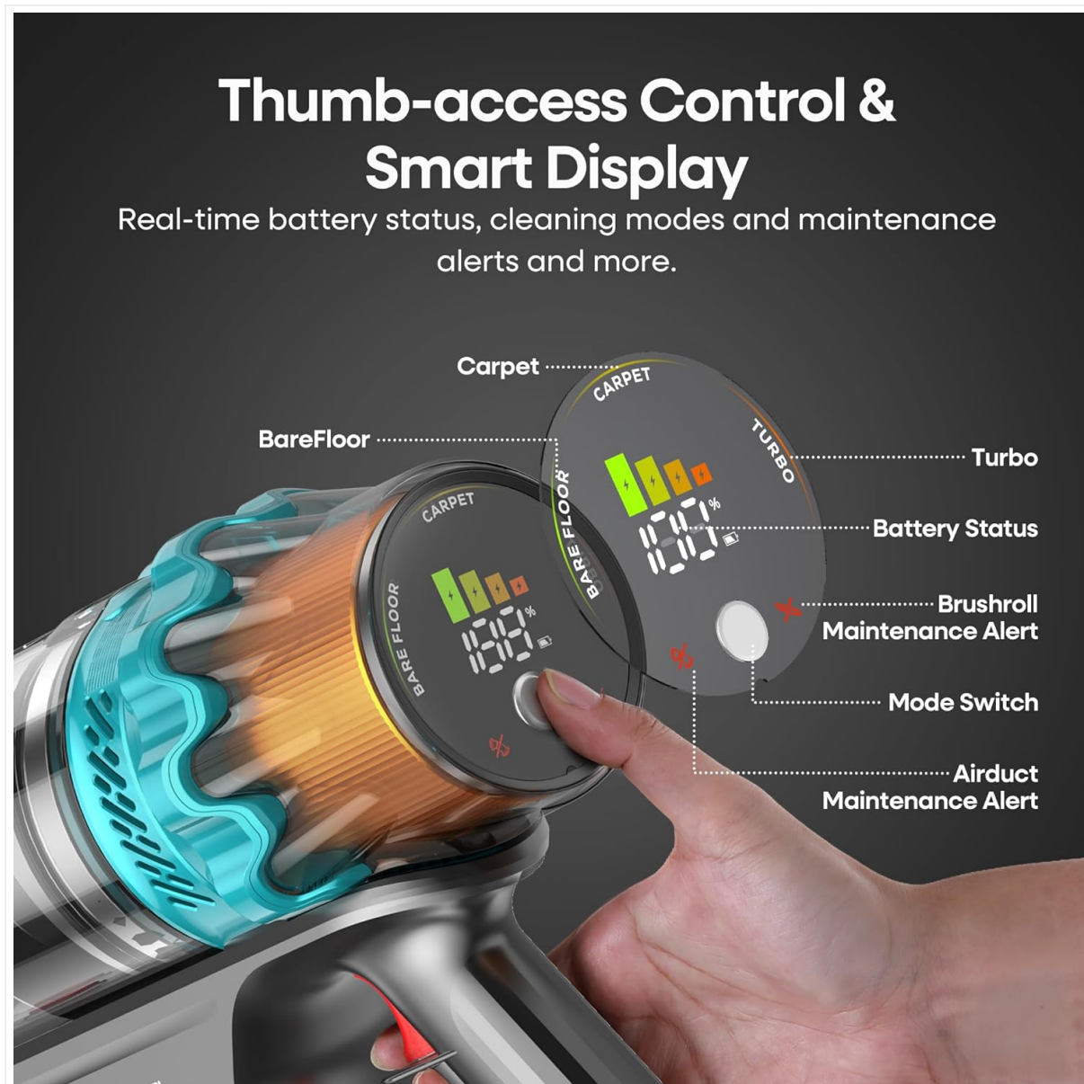
Image: The LED smart screen displays real-time battery status, cleaning modes, and maintenance alerts.