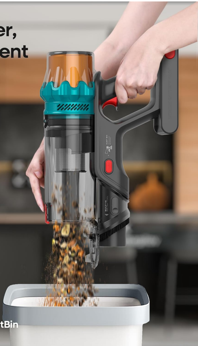
Image: Instructions for one-click dustbin emptying.