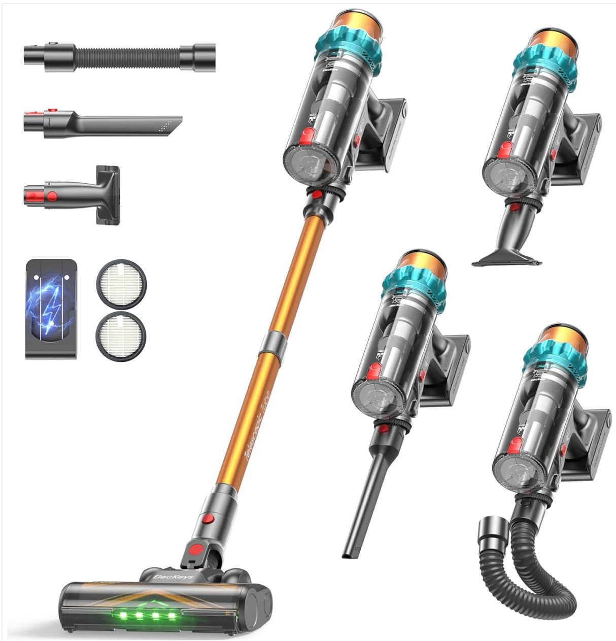
Image: The ElecKeys K10 vacuum cleaner shown with different attachments and in stick and handheld modes.