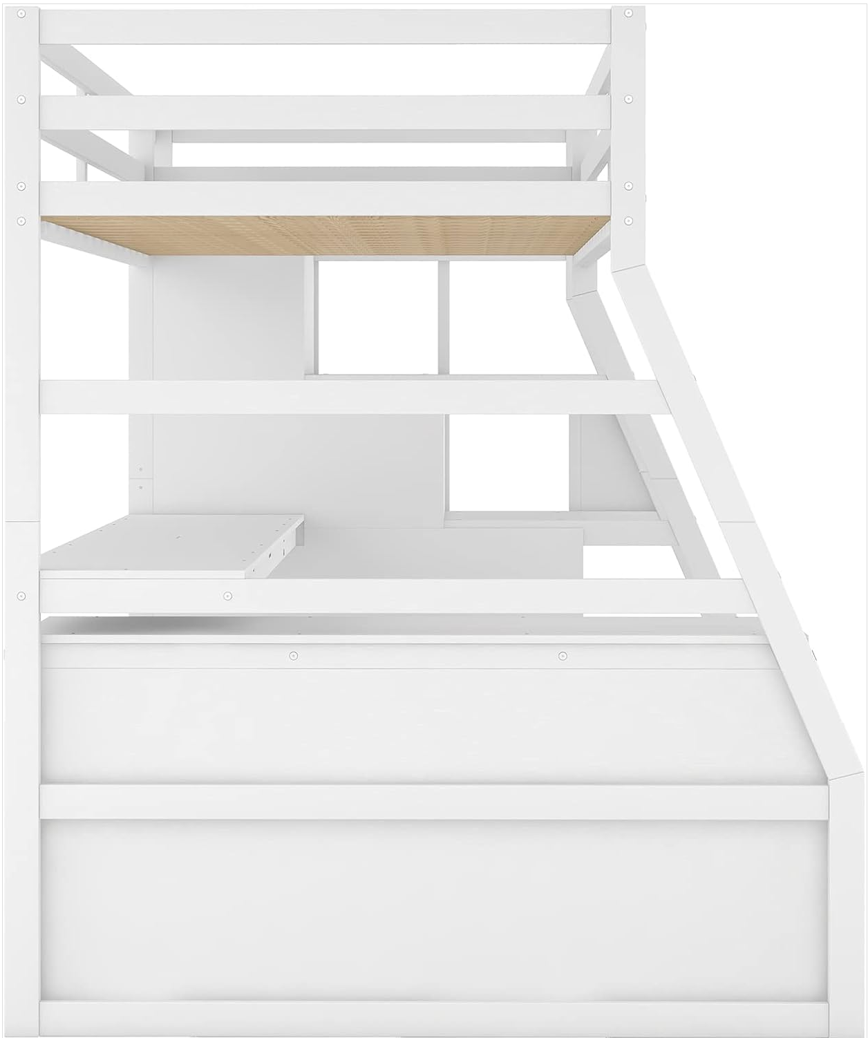
Image: Detail of the bed slats and their attachment points.