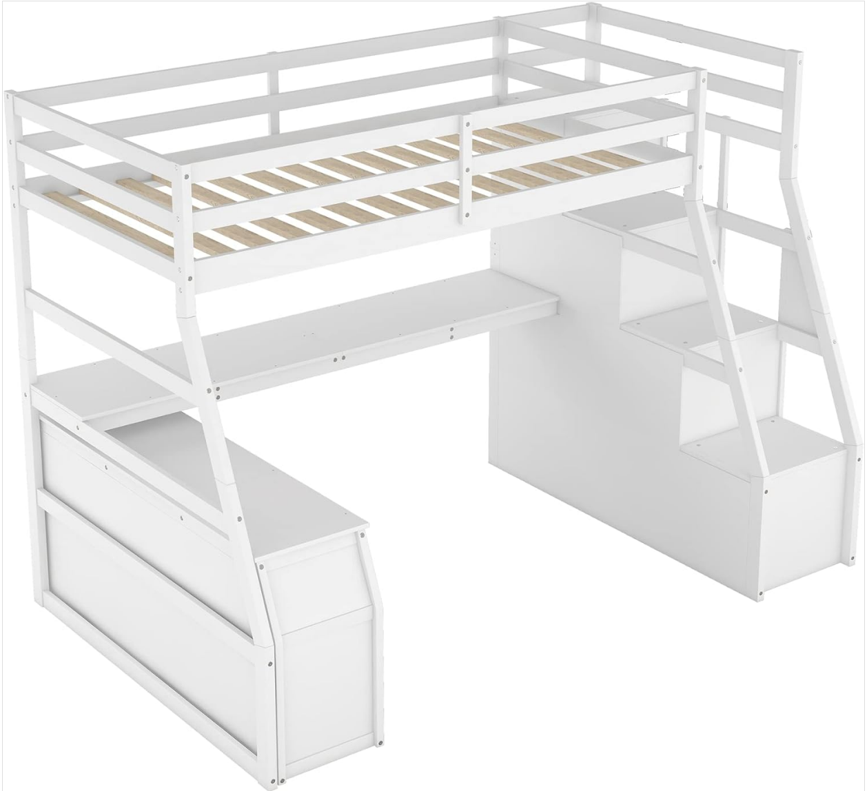
Image: Basic frame assembly showing the bed structure and integrated desk space.

Begin by connecting the headboard and footboard to the side rails using the provided bolts and nuts. Ensure all connections are finger-tight at this stage.