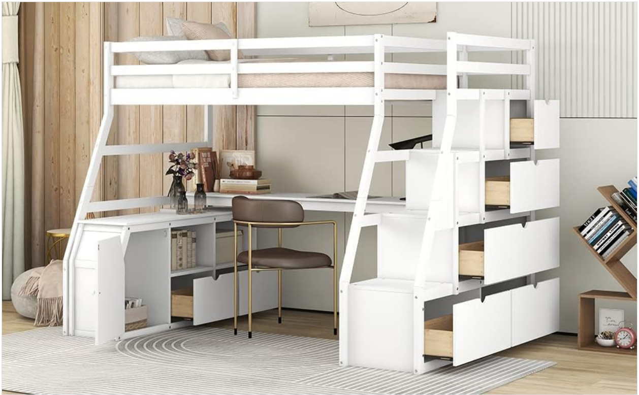
Image: The loft bed with some drawers and shelves open, demonstrating the storage capacity.