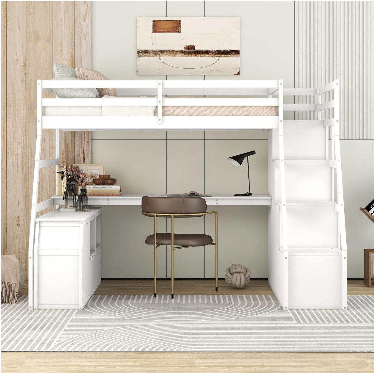
Image: The loft bed in a room setting, showcasing the desk area with a chair and lamp.