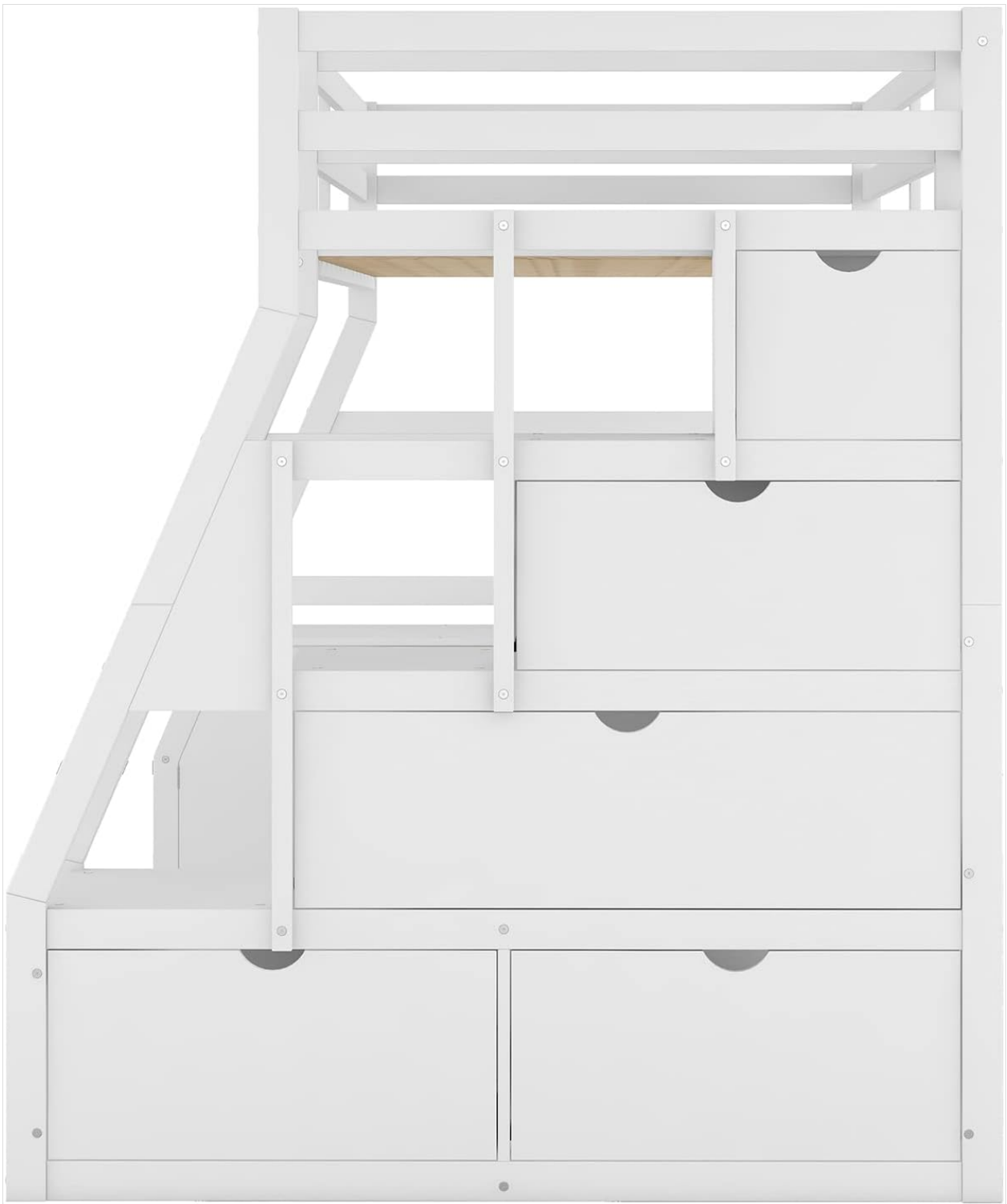
Image: View of the staircase with integrated drawers, highlighting storage.