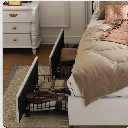
4 Large Storage Drawers