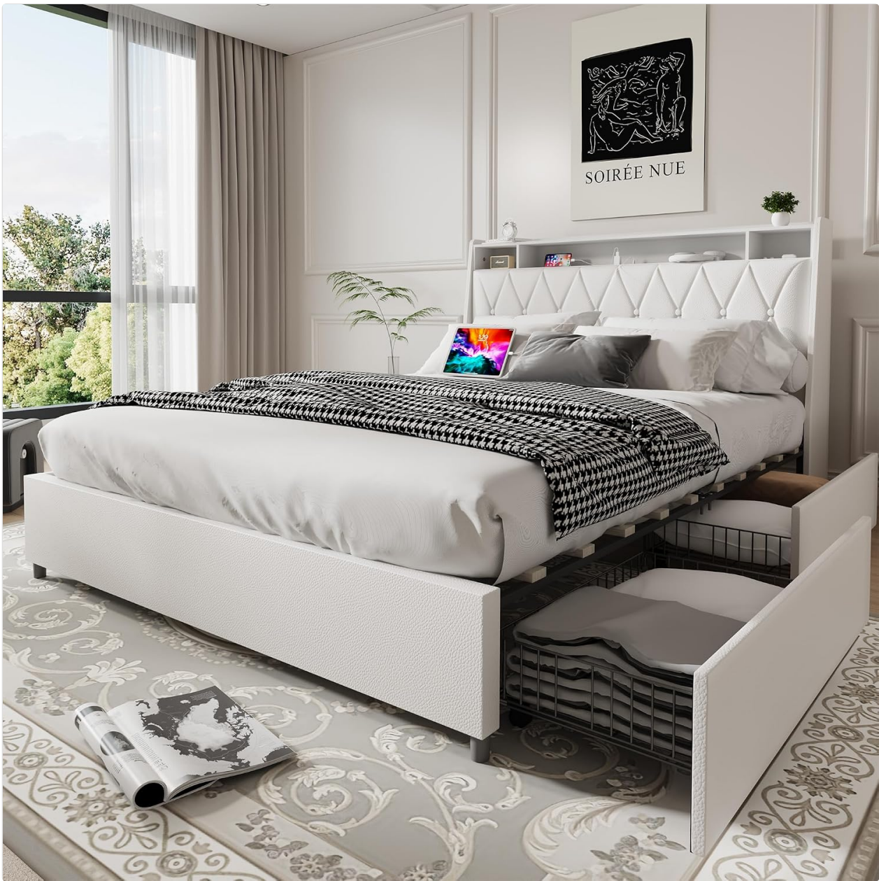
Figure 4: The full size bed frame with two of its four under-bed storage drawers pulled out, demonstrating their capacity for storing various items like folded clothes or bedding.