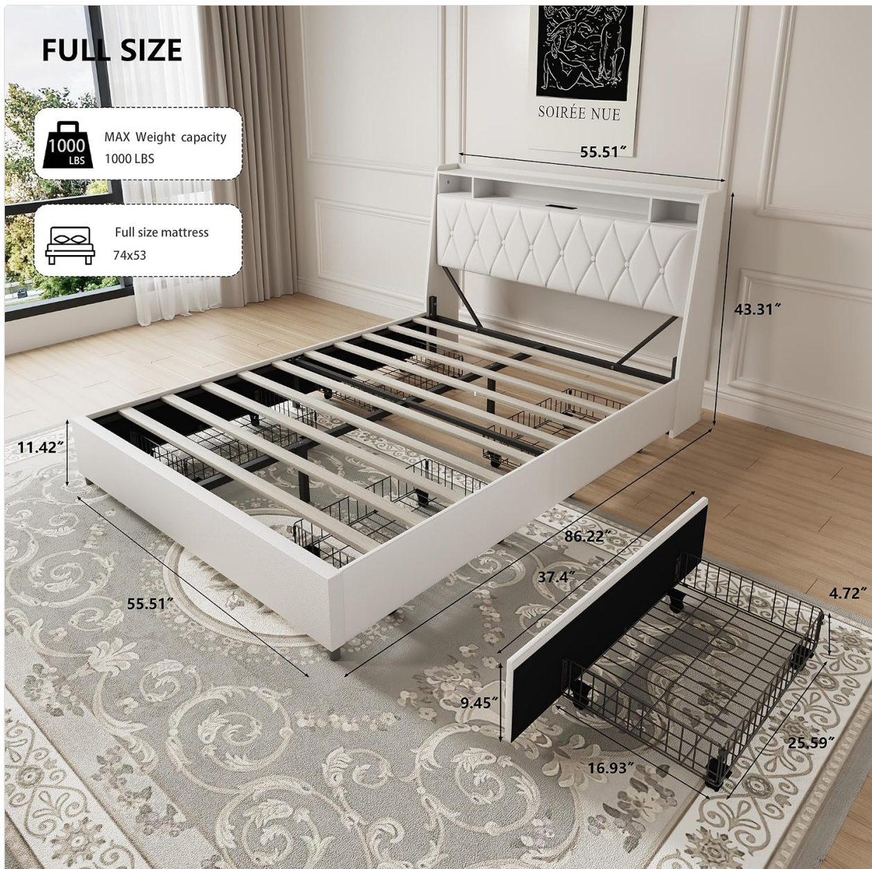
Figure 1: Overview of bed frame components and key dimensions. This image illustrates the full size bed frame, showing its overall dimensions including length (86.22"), width (55.51"), and headboard height (43.31"). It also indicates a maximum weight capacity of 1000 lbs and suitability for a 74x53 inch full size mattress.