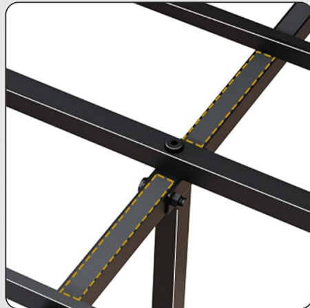
EVA Mute Sponge Reduce Noise