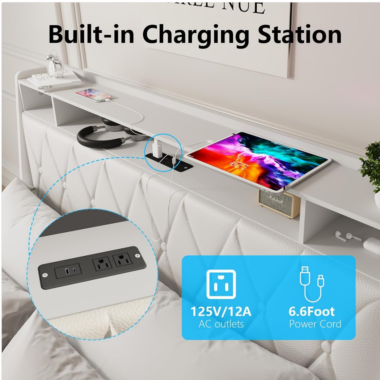
Figure 3: Detail of the built-in charging station located on the headboard, featuring 125V/12A AC outlets and USB ports, powered by a 6.6-foot power cord. This allows for convenient charging of electronic devices.