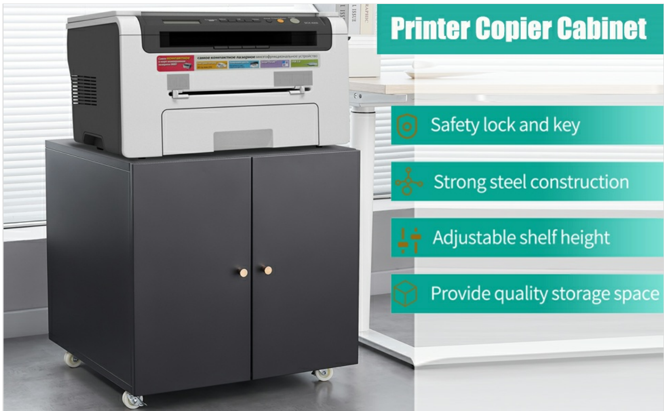
Figure 6: Key Features Overview. An overview image of the printer stand with a printer on top, accompanied by a list of key features: strong steel construction, adjustable shelf height, and quality storage space.