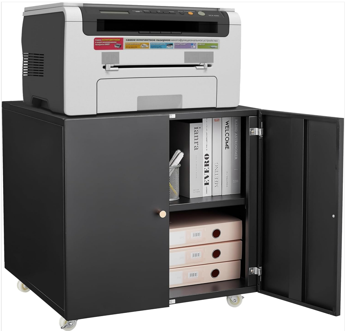
Figure 4: Product in Use. The GarveeLife Metal Printer Stand with File Storage Cabinet, featuring a printer on its top surface and the cabinet doors open to reveal organized storage space for office supplies and files.