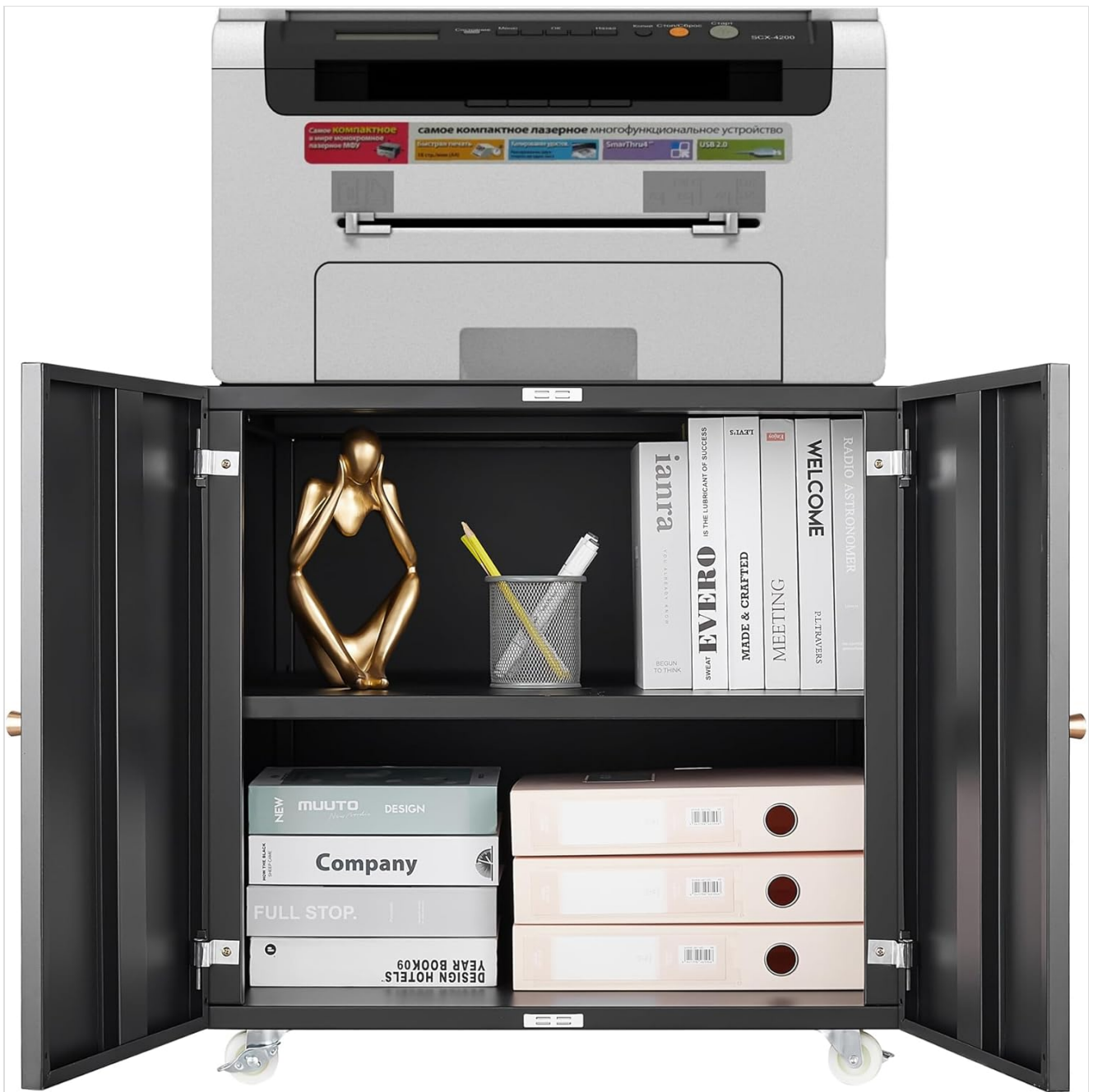
Figure 5: Organized Storage. The printer stand with a printer positioned on its top surface. The cabinet doors are open, showcasing the interior with various office items and files neatly stored on the adjustable shelf.