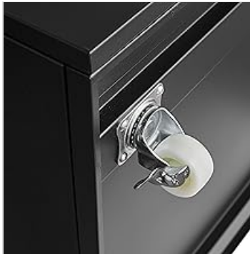
Figure 2: Caster Wheel Detail. A close-up view of one of the locking casters, demonstrating its design for mobility and stability.