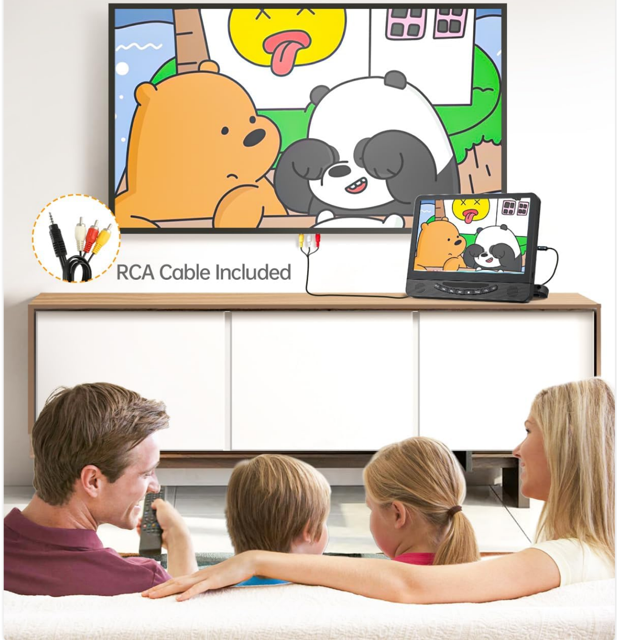
Image Description: This image demonstrates how to connect the portable DVD player to a television using the included RCA cable, allowing a family to enjoy movies on a larger screen, enhancing the viewing experience for multiple people.