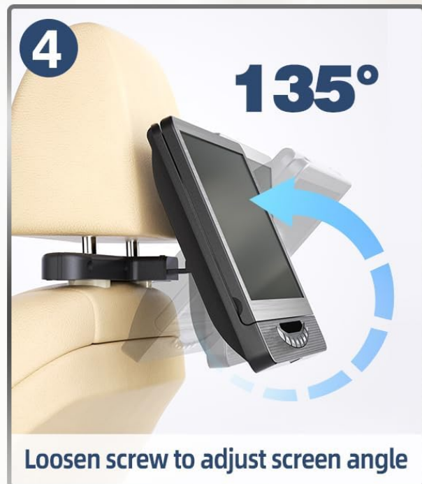
Image Description: A visual guide demonstrating the installation of the DVD player onto a car headrest using the provided mounting bracket. It illustrates installing the base, aligning and securing the player, and adjusting the screen angle.