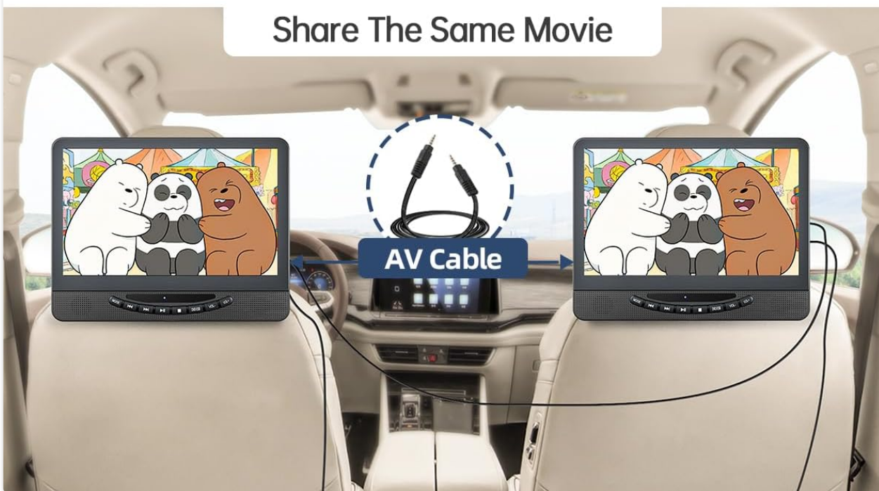
Image Description: This image illustrates the versatility of the dual screen system. It shows how two separate movies can be played simultaneously, or how a single movie can be shared across both screens using an AV cable connection, ideal for car entertainment.