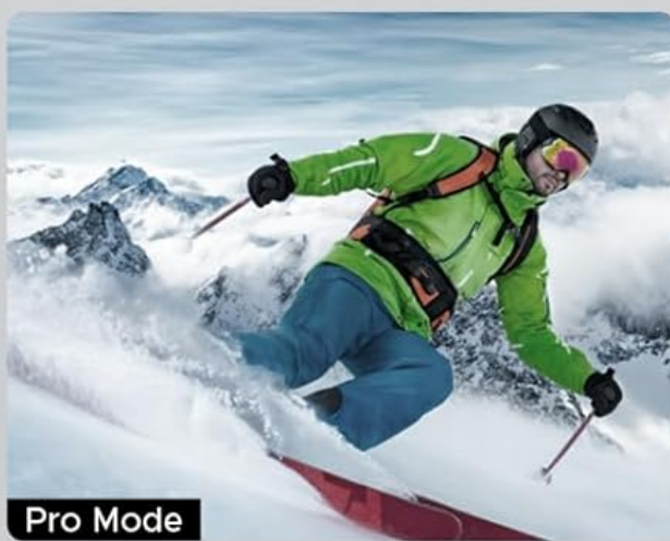
Figure 5: Various camera modes available on the Blade 20 Ultra.