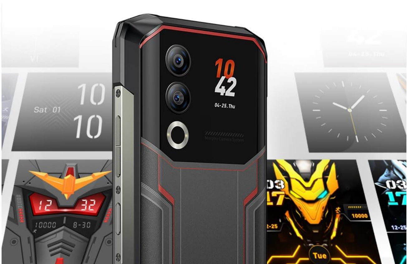
Figure 4: The 1.54-inch smart rear display offers quick functions and personalization.

.Dynamic Mecha-style .Static Business-style .Personalized Photo Setting .Personalized Signature