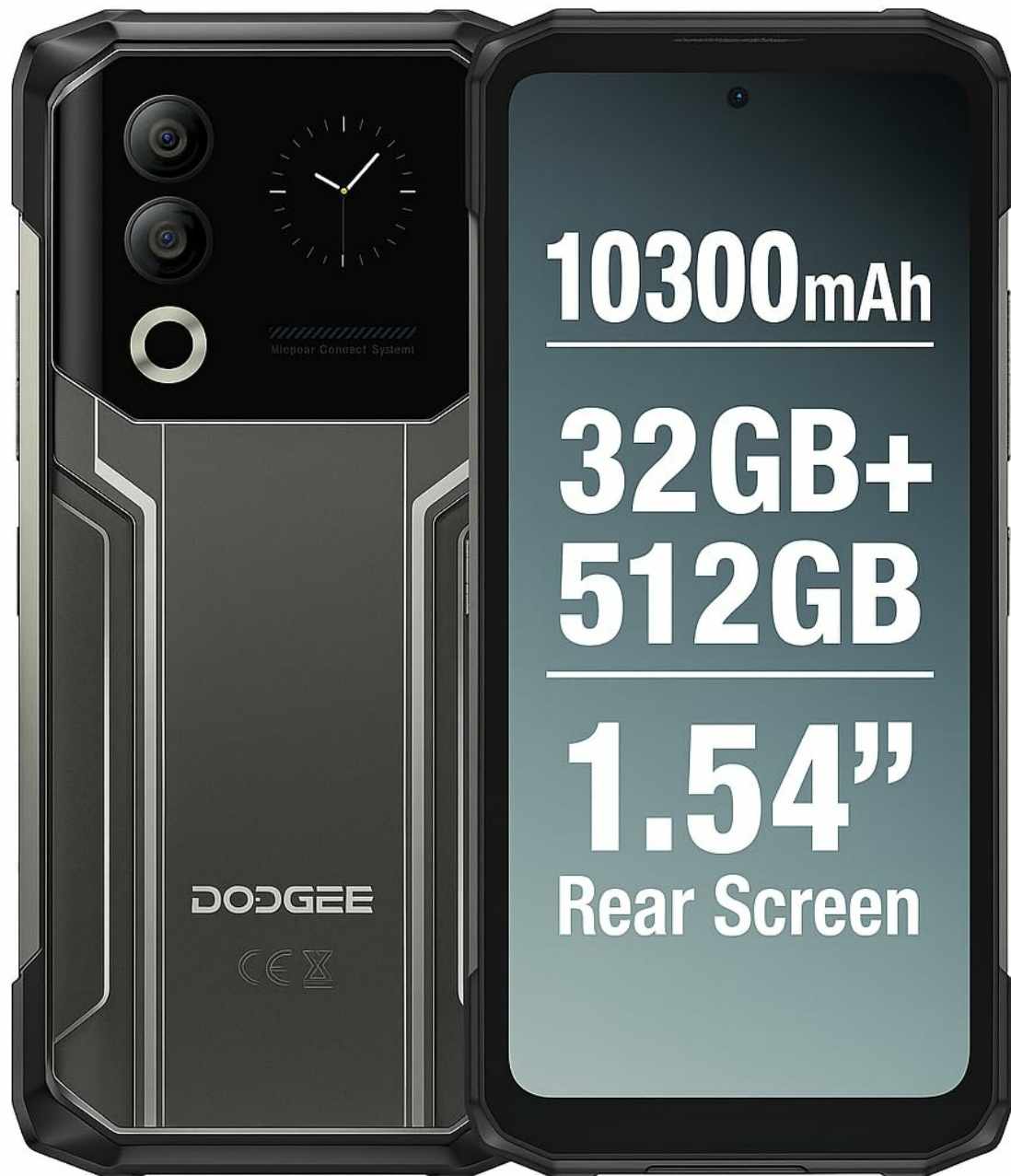
Figure 1: DOOGEE Blade 20 Ultra device overview.