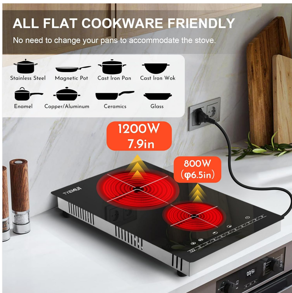
Image: Diagram illustrating the TYEMUI Electric Cooktop's compatibility with various flat-bottom cookware types, including Stainless Steel, Magnetic Pot, Cast Iron Pan, Cast Iron Wok, Enamel, Copper/Aluminum, Ceramics, and Glass. It also shows the 1200W and 800W heating zones.