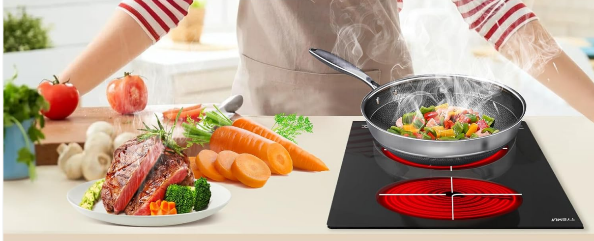
Image: Overview of the TYEMUI Electric Cooktop highlighting safety features like Pause, Timer, Child Lock, Shatter Proof Glass, Overheating Protection, and Residual Heat Indicator, along with its 2000W high power and 9 power levels.