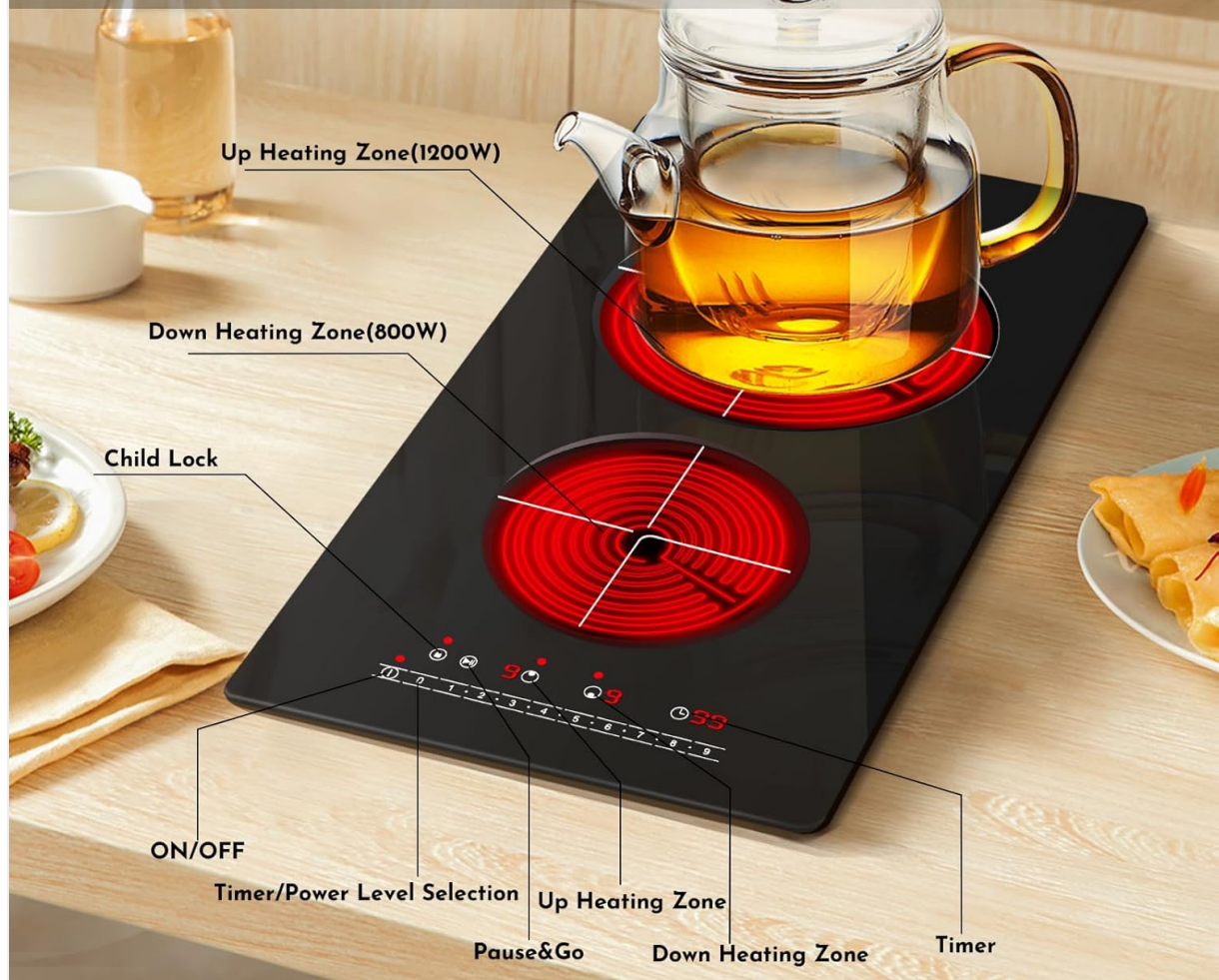
Image: Detailed view of the TYEMUI Electric Cooktop's control panel, labeling buttons for ON/OFF, Timer/Power Level Selection, Up Heating Zone (1200W), Down Heating Zone (800W), Pause&Go, Child Lock, and Timer.

one touch to reach your desired power, hassle-free & ponder-free