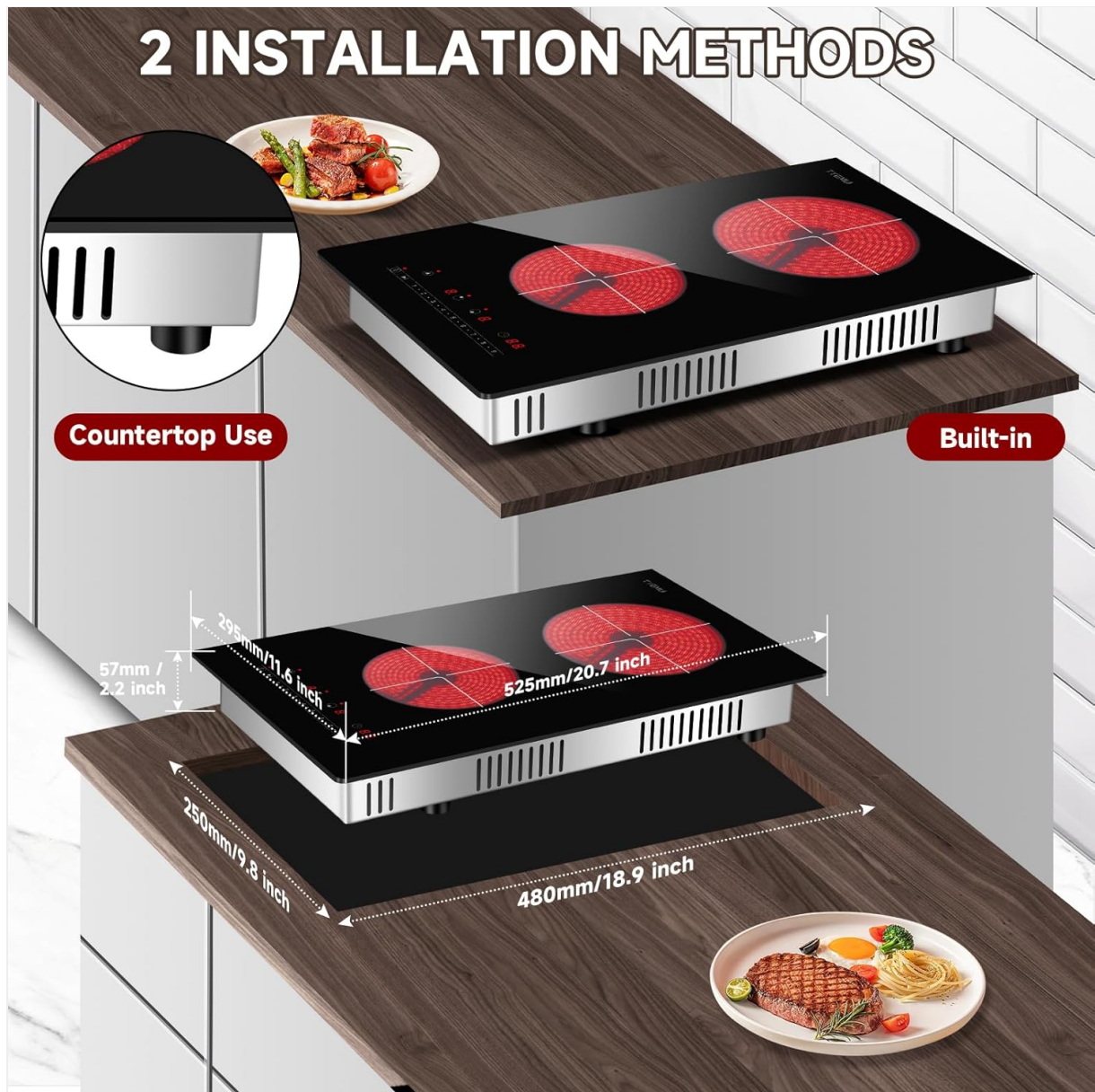
Image: Illustration showing two installation methods for the TYEMUI Electric Cooktop: as a countertop unit with feet, and built-in into a kitchen counter, with key dimensions indicated.