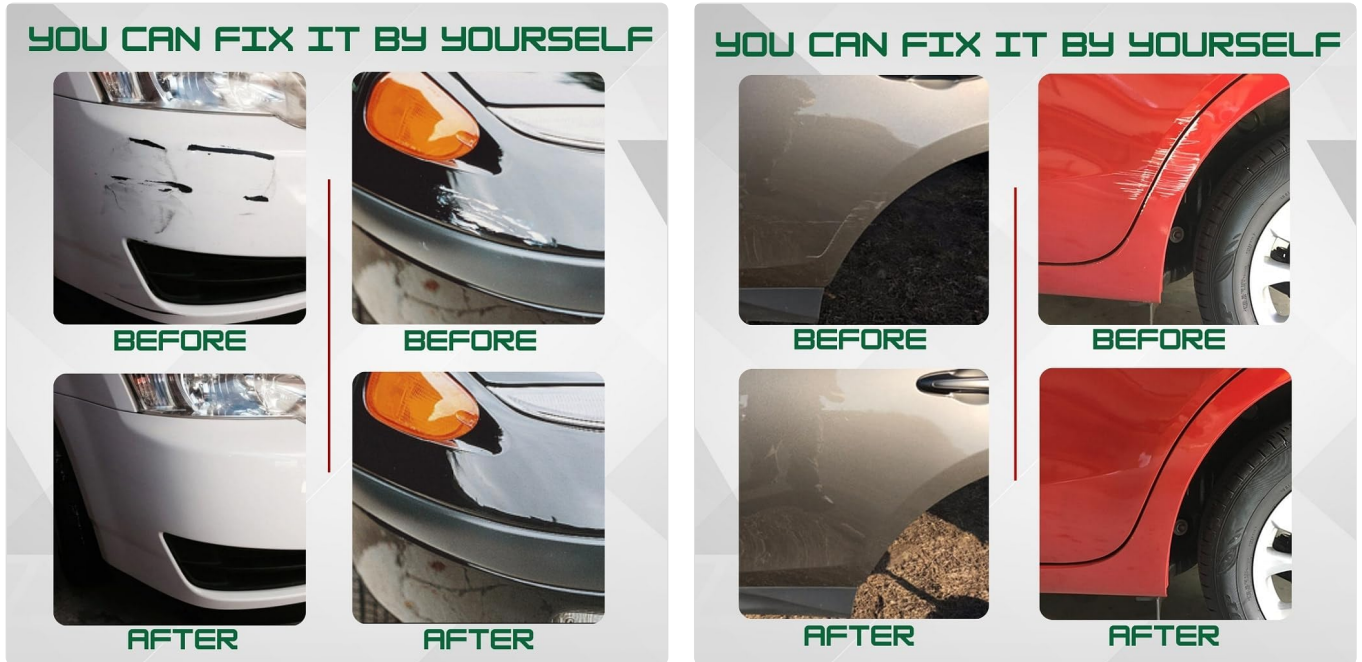
Images: Examples of successful scratch and chip repairs on a car bumper and side panel, demonstrating the effectiveness of the touch-up paint kit.