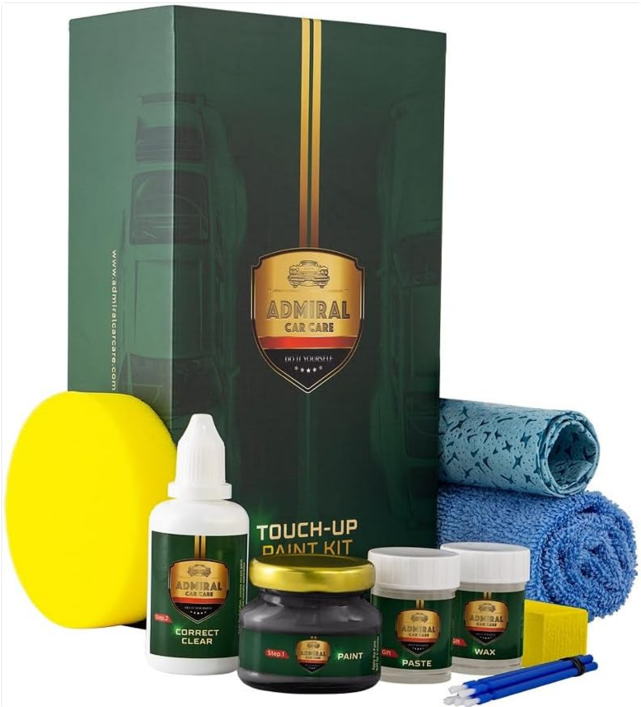
Image: Contents of the Admiral Car Care Touch Up Paint Kit, including paint, cleaning solution, wax, sponge, brushes, and microfiber cloth.