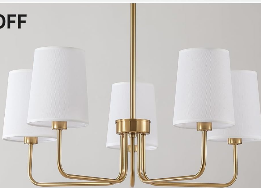
Image: Comparison of the chandelier with lights turned ON, showing a warm glow through the fabric shades, and lights turned OFF, displaying the clean white shades.