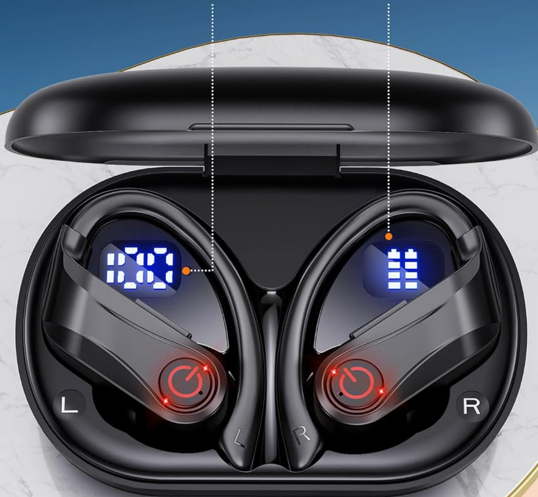
Image: The charging case features a dual LED display showing battery percentages for the case and individual earbuds.