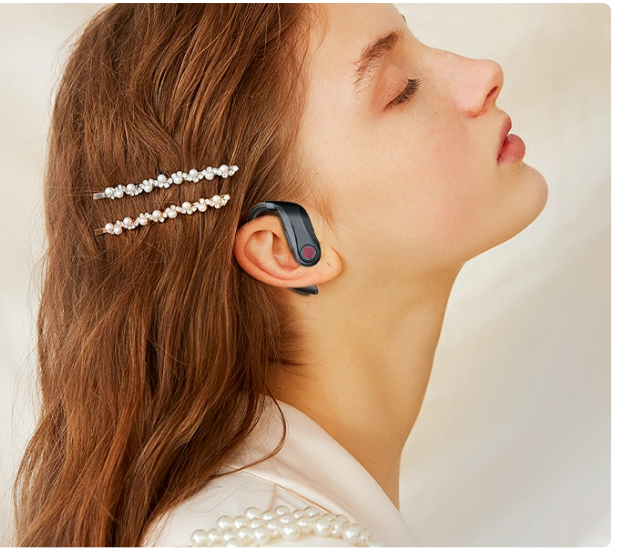
Image: Graphic highlighting the lightweight and comfortable-fit ergonomic design of the earbuds.

8.8g light-weight headphone body, multi-point refined design bring more comfortable in-ear experience