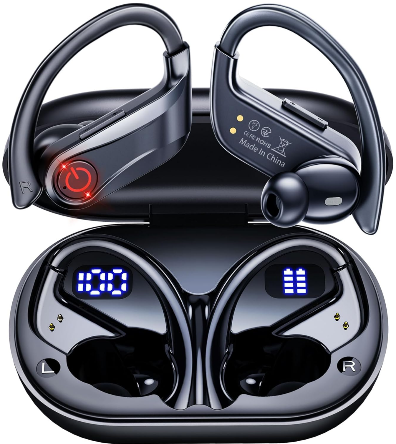
Image: Earbuds placed in the charging case, showing red indicator lights when charging.

Connect the provided Type-C charging cable to the charging port on the case and a power source. The LED display will indicate charging progress. The red lights on the earbuds will show they are charging.