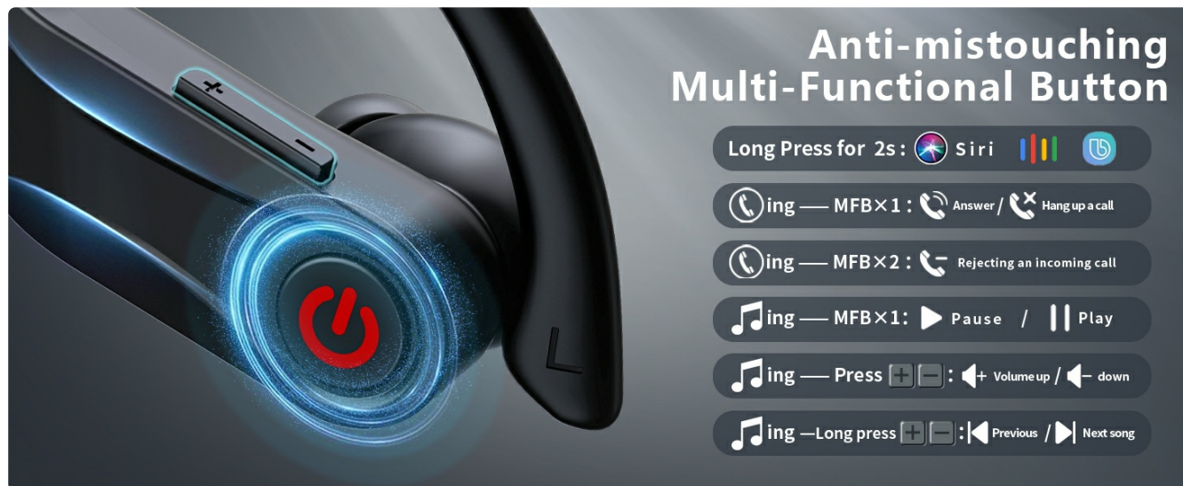
Image: Detailed diagram of the multi-functional button on the earbuds, showing controls for calls, music playback, and voice assistant activation.

The earbuds feature multi-functional buttons for easy control of music playback and calls. Refer to the diagram below for detailed functions: