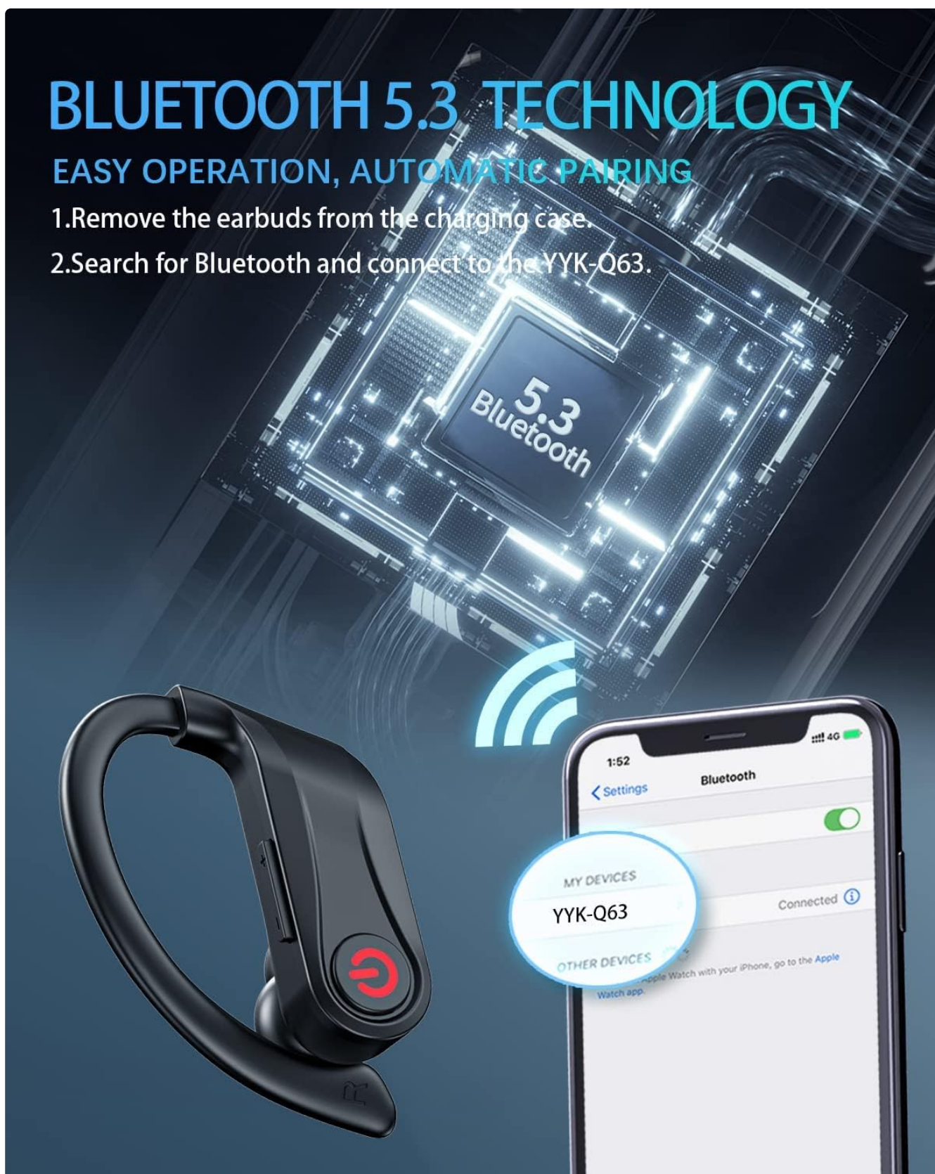
Image: Diagram illustrating the Bluetooth 5.3 technology and connection process.

For a visual guide on connecting your earbuds, please watch the official product video below: