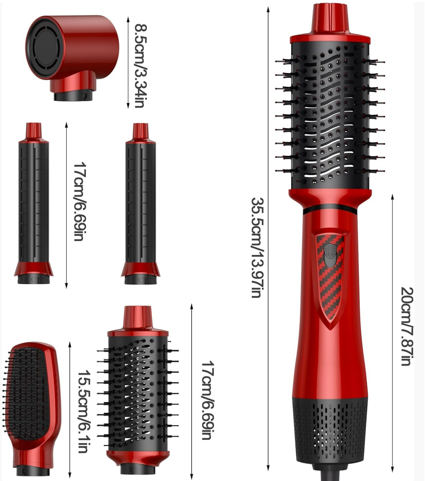
Image: Detailed dimensions of the Dryhsip 5-in-1 Hair Styler main unit and its various attachments.