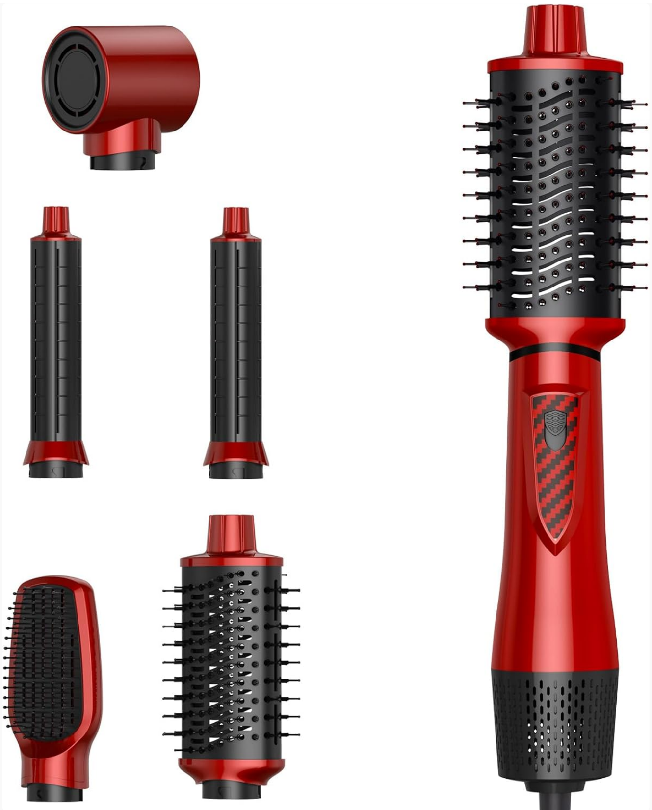
Image: All components of the Dryhsip 5-in-1 Hair Styler Set, including the main unit, drying nozzle, straightening brush, round volumizing brush, and two air curling barrels.