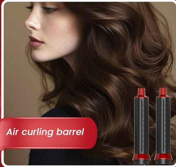
Air curling barrel

Create Salon-Looking Styles at Home with Ease