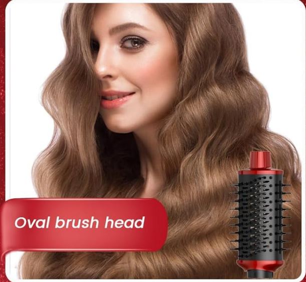
Oval brush head