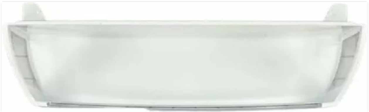
Figure 2: Top-down view of the Door Shelf Bin, showing the attachment points on either side.

After installation, gently test the bin by applying light pressure to ensure it is firmly seated and will not dislodge when loaded with items.