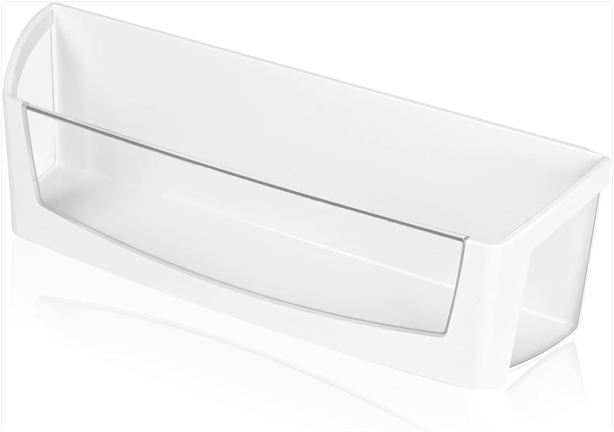
Figure 1: Front view of the Door Shelf Bin, showing its clear plastic construction and rectangular shape. Constructed from durable, clear plastic, the bin is designed for longevity and easy visibility of its contents. Its robust design ensures it can withstand the daily use of a busy refrigerator environment.