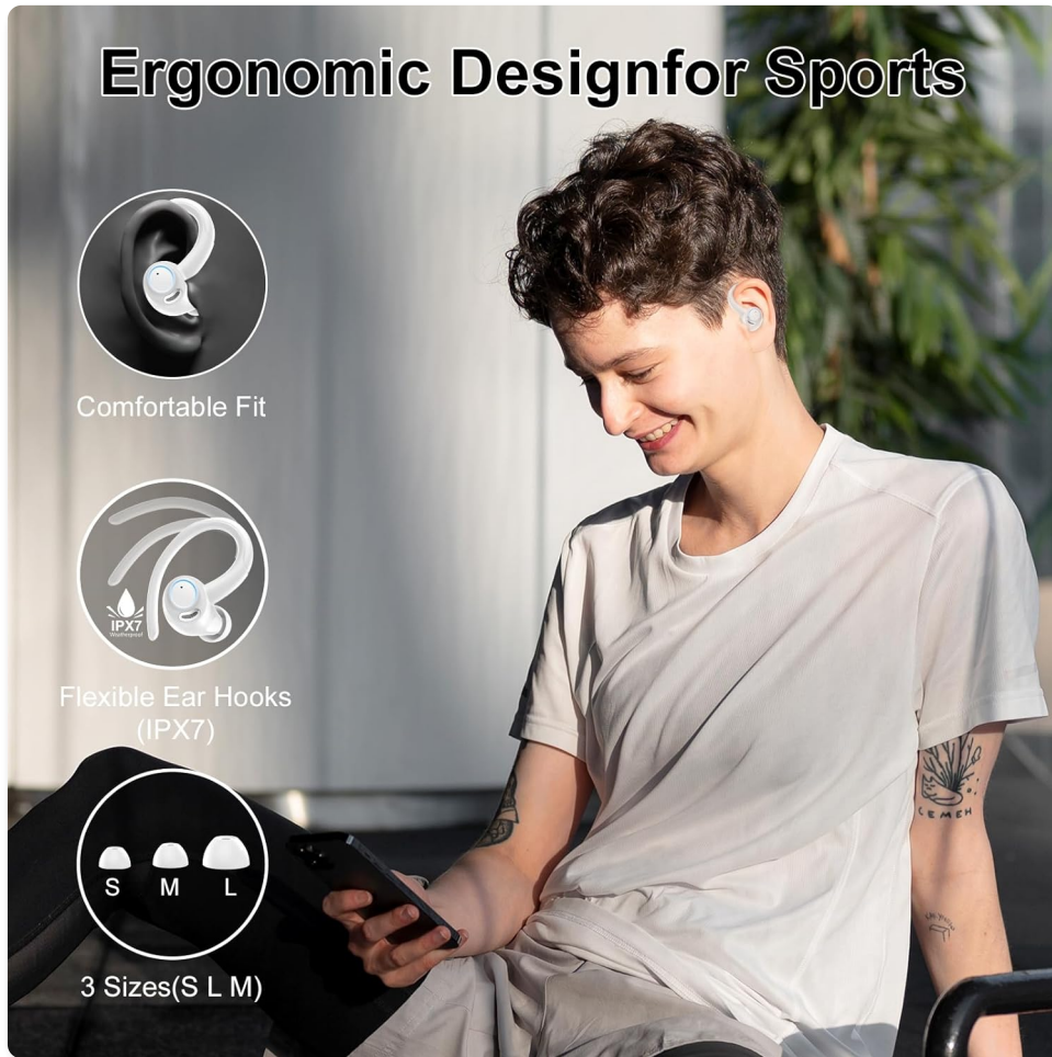
Image: A person wearing the earbuds, emphasizing their ergonomic design, secure fit, and IPX7 waterproof rating.