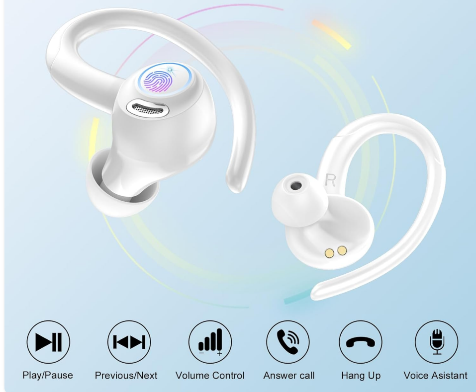
Image: Visual guide to the smart touch control functions on the earbuds, including play/pause, track skipping, volume, and call management.