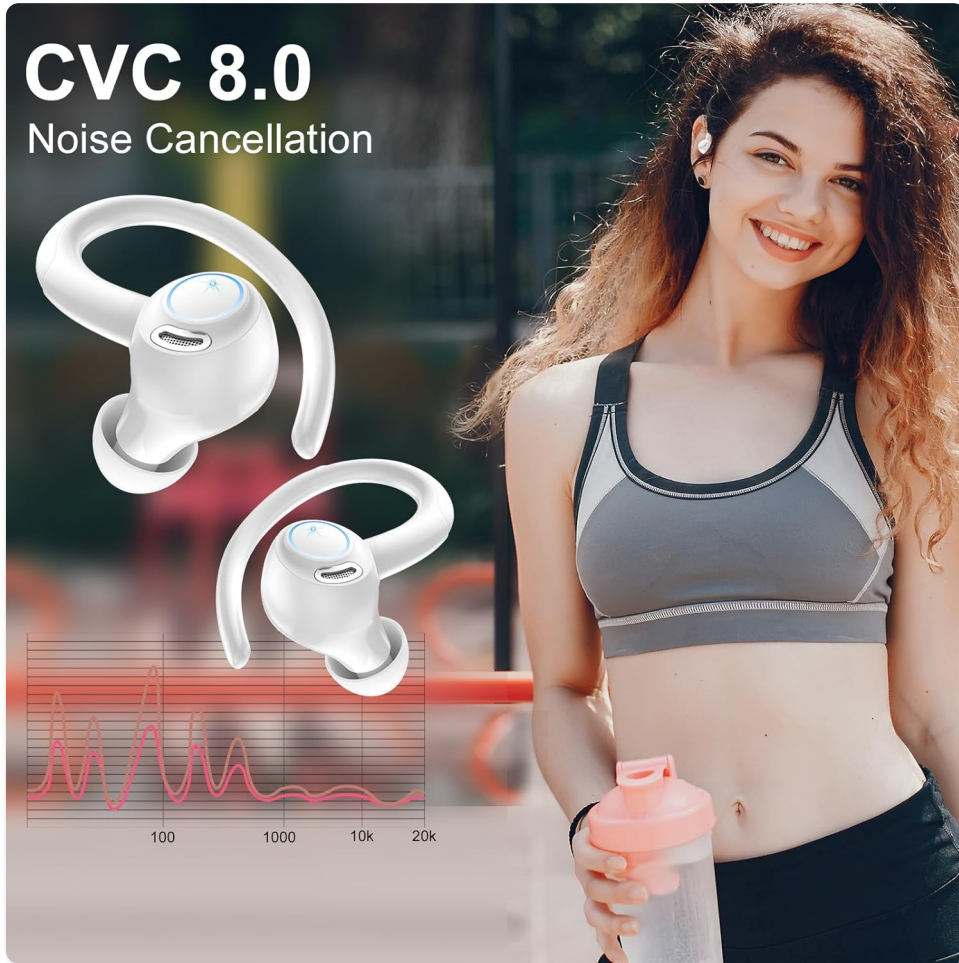
Image: Earbuds highlighting the CVC 8.0 Noise Cancellation feature, with a frequency response graph.

The V90 earbuds feature SBC/AAC high-performance audio decoders and 13mm dynamic drivers, delivering a wide soundstage with deep bass, clear mids, and crisp highs for an immersive 3D stereo experience. Built-in CVC 8.0 noise cancellation effectively filters out ambient sounds, ensuring your voice remains clear during calls, even in noisy environments.