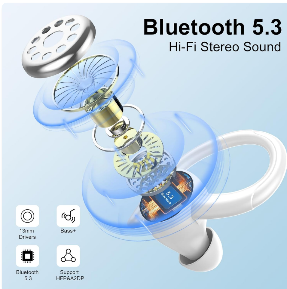
Image: Visual representation of Bluetooth 5.3 technology and internal sound components, including 13mm drivers.

Equipped with an advanced Bluetooth 5.3 chip, these earbuds offer faster transmission speeds, lower latency, and enhanced anti-interference capabilities for a stable and reliable connection. Enjoy uninterrupted, high-quality sound whether listening to music or making calls.