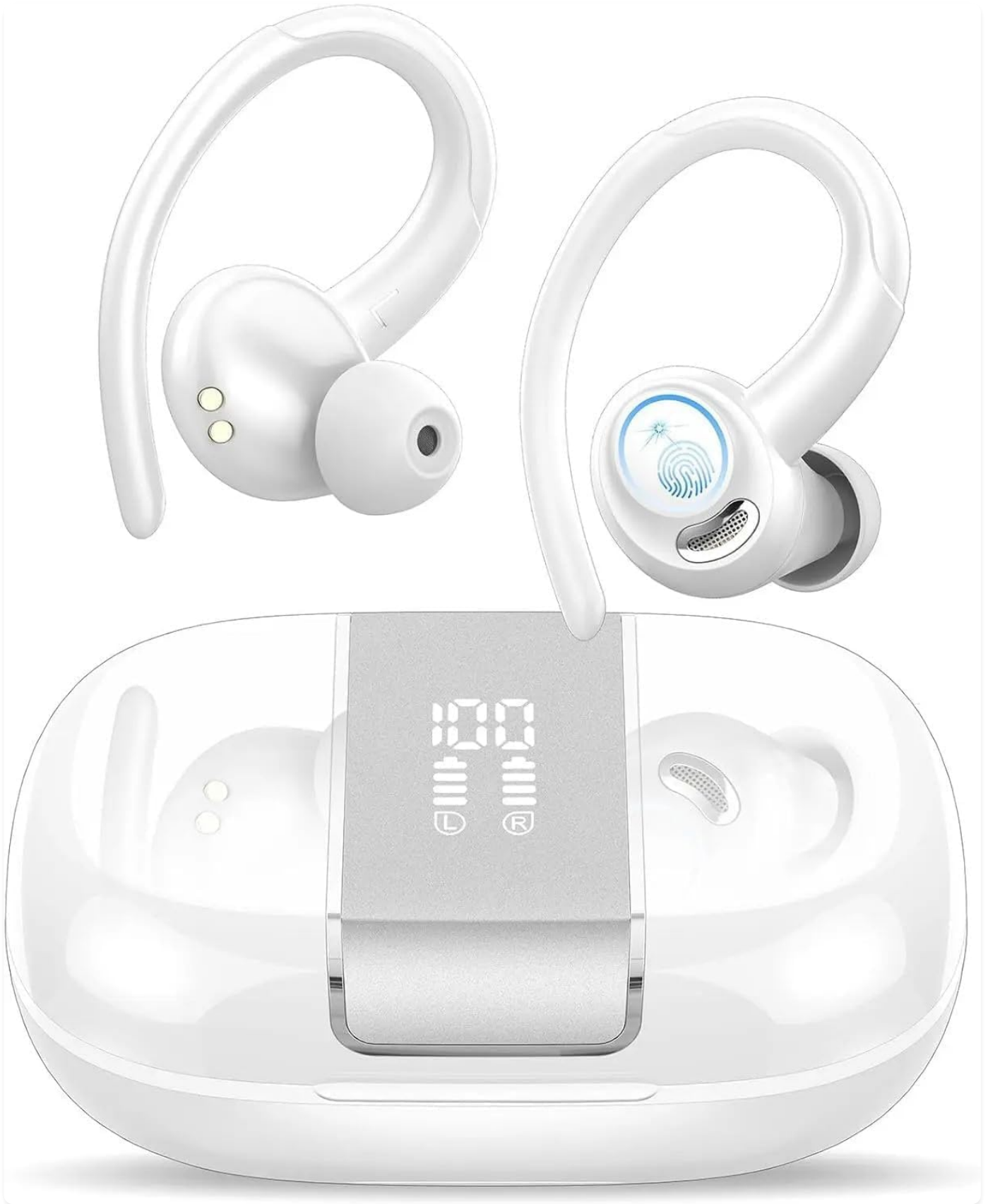
Image: VKROBAG V90 Wireless Earbuds and their charging case.