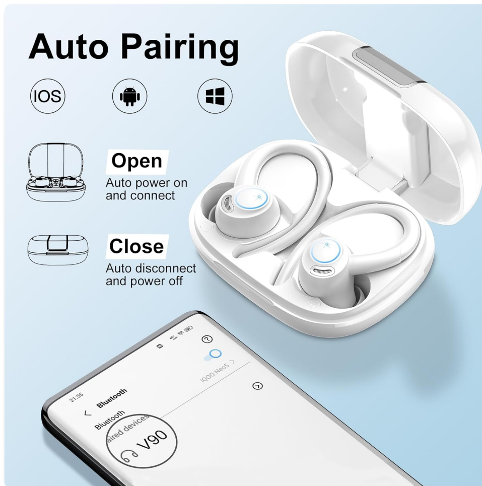
Image: Steps for automatic pairing of the earbuds with a mobile device.