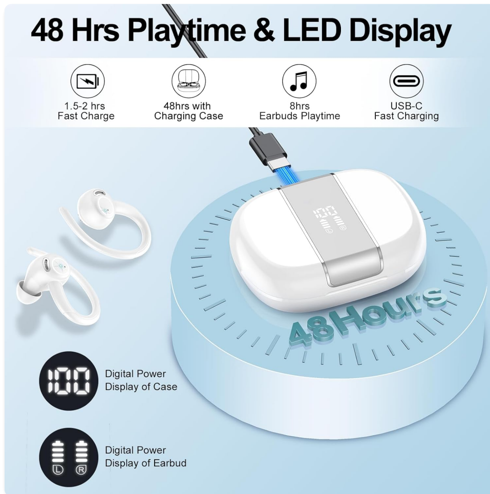
Image: Earbuds and charging case illustrating 48 hours of total playtime and the dual LED battery display.