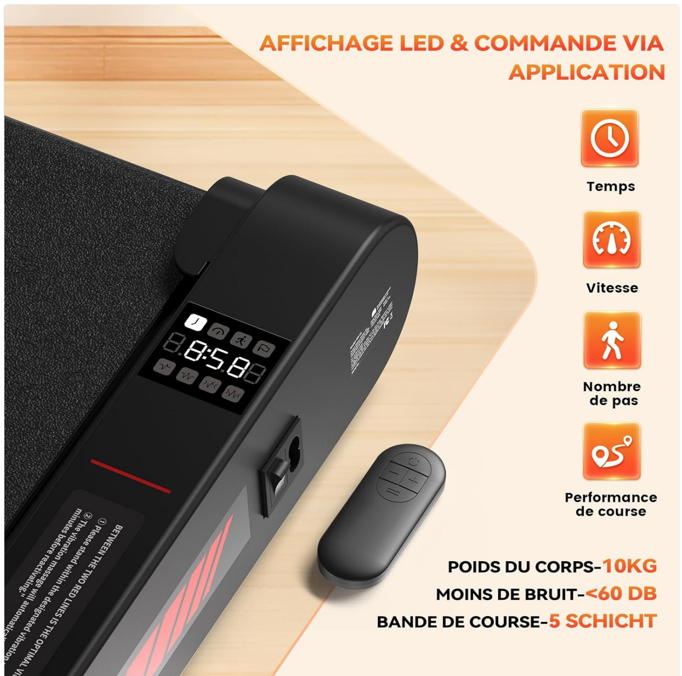
Figure 3.2: LED Display and Remote Control for the Sperax Walking Pad.