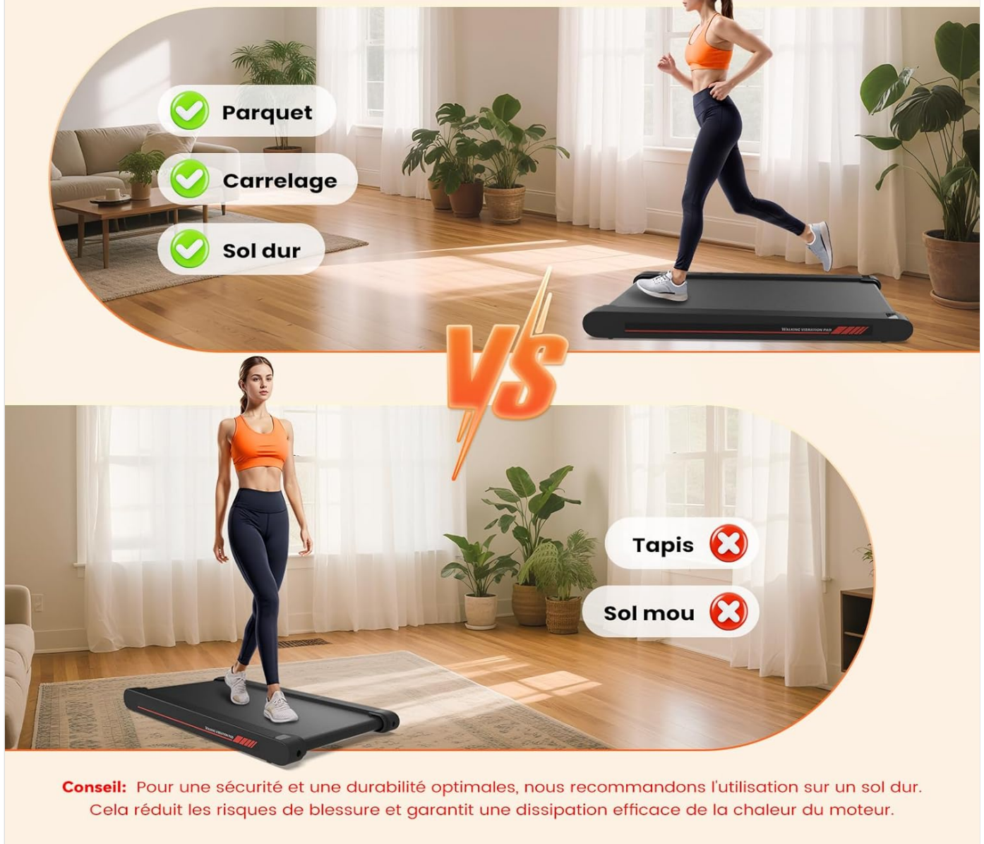
Figure 4.1: Recommended floor types for optimal performance and safety.

Brûlure efficace des graisses possible également à la maison !