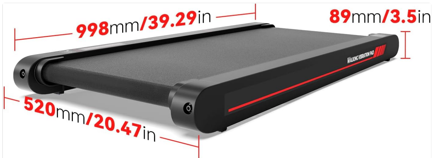
Figure 8.1: Product Dimensions.