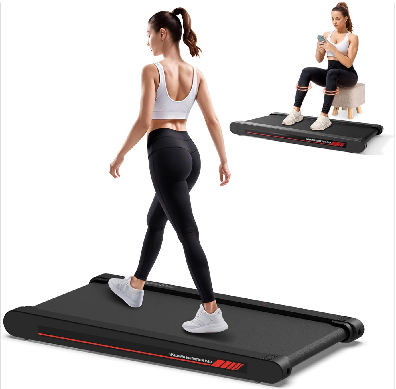
Figure 3.1: Sperax 3-in-1 Vibrating Walking Pad in typical usage scenarios.