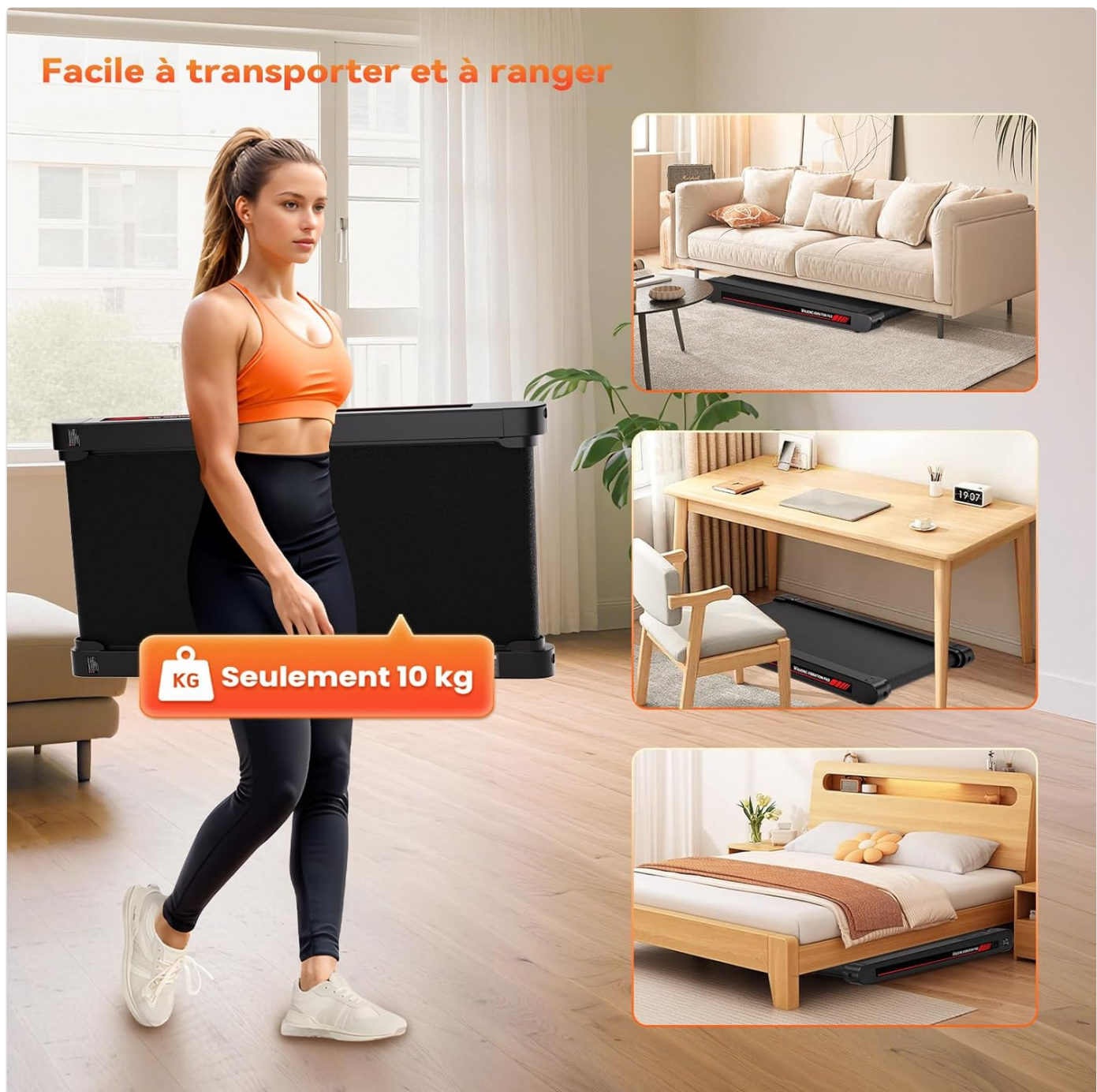
Figure 3.4: Space-saving design and easy storage options.