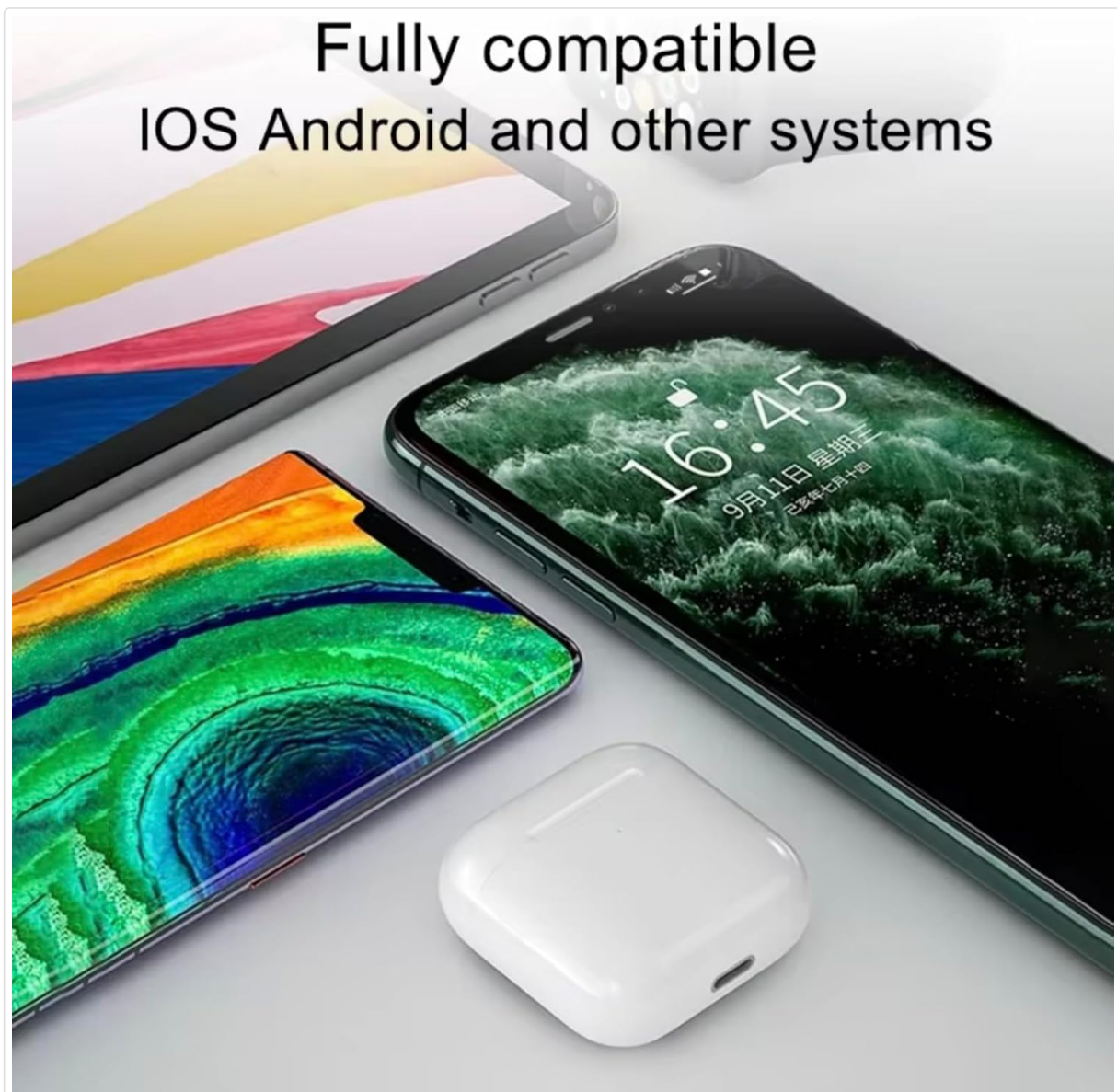
Image: The Pro4 TWS charging case positioned near various smartphones, illustrating its compatibility with both iOS and Android operating systems.