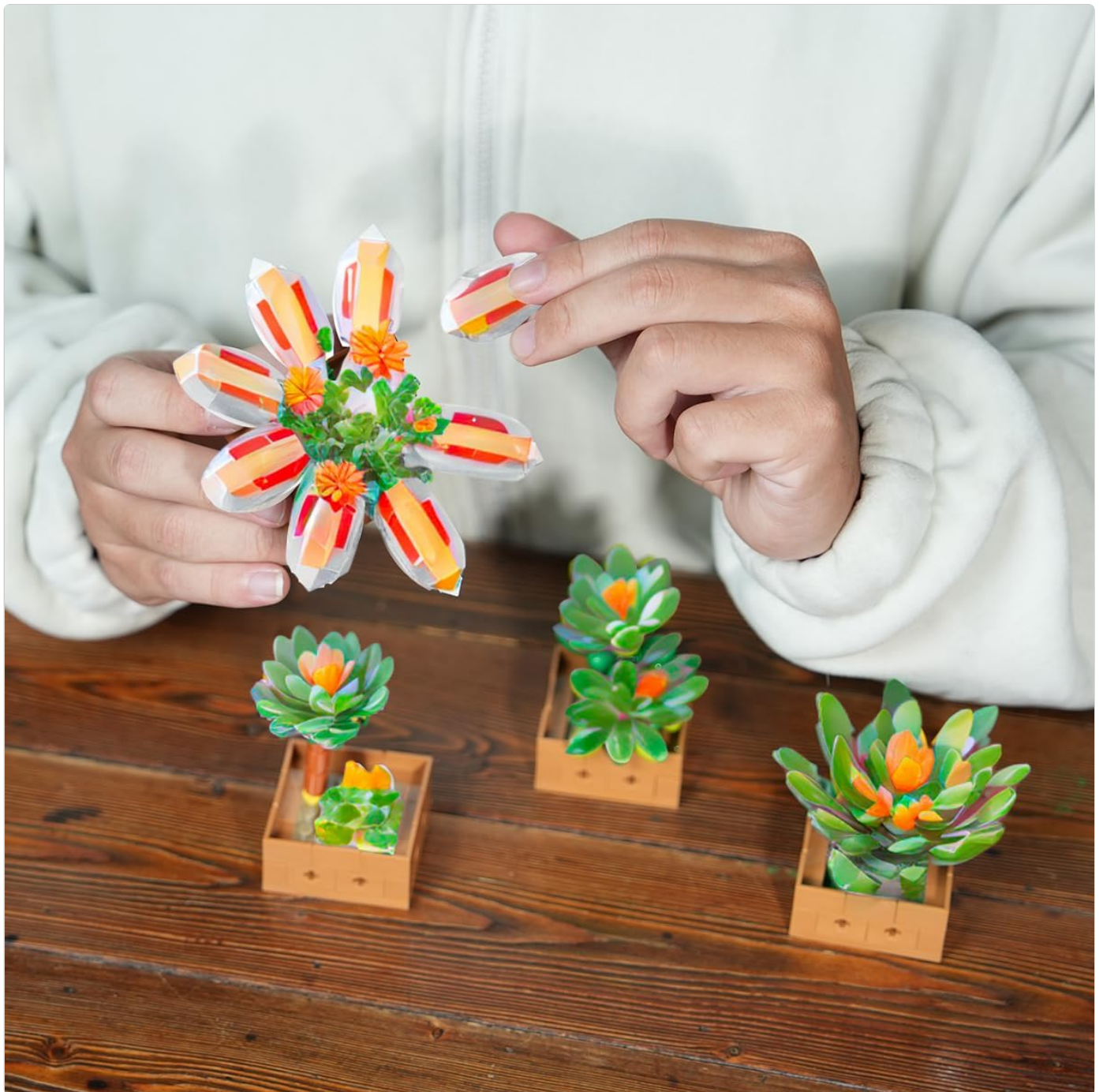
Image 4.1: A user assembling one of the botanical models, demonstrating the process of connecting building blocks.