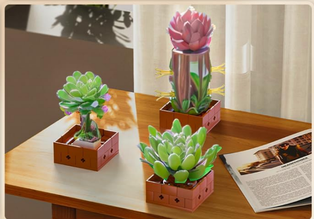
Image 4.2: Collaborative assembly of the succulent building sets, showing multiple models in progress and completed.