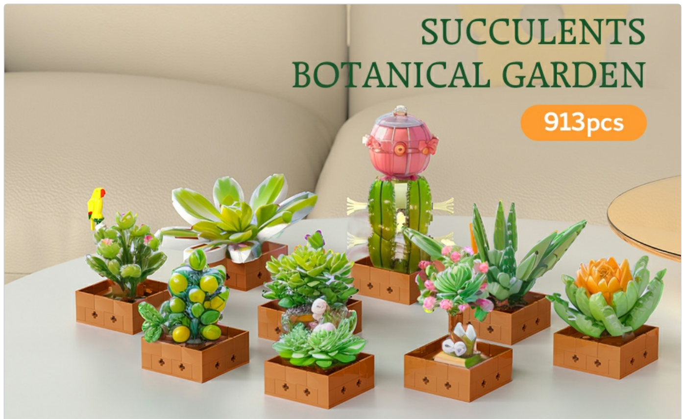
Image 1.1: Overview of the BIGEARN Succulents Botanical Garden building set, showcasing the variety of 9 different assembled succulent models.

This manual provides detailed instructions for assembling and caring for your BIGEARN Artificial Flowers Building Sets, Model 784. This set includes components to create 9 unique botanical succulents, designed for adults and enthusiasts of building block models. The finished models serve as decorative elements for home or office environments.