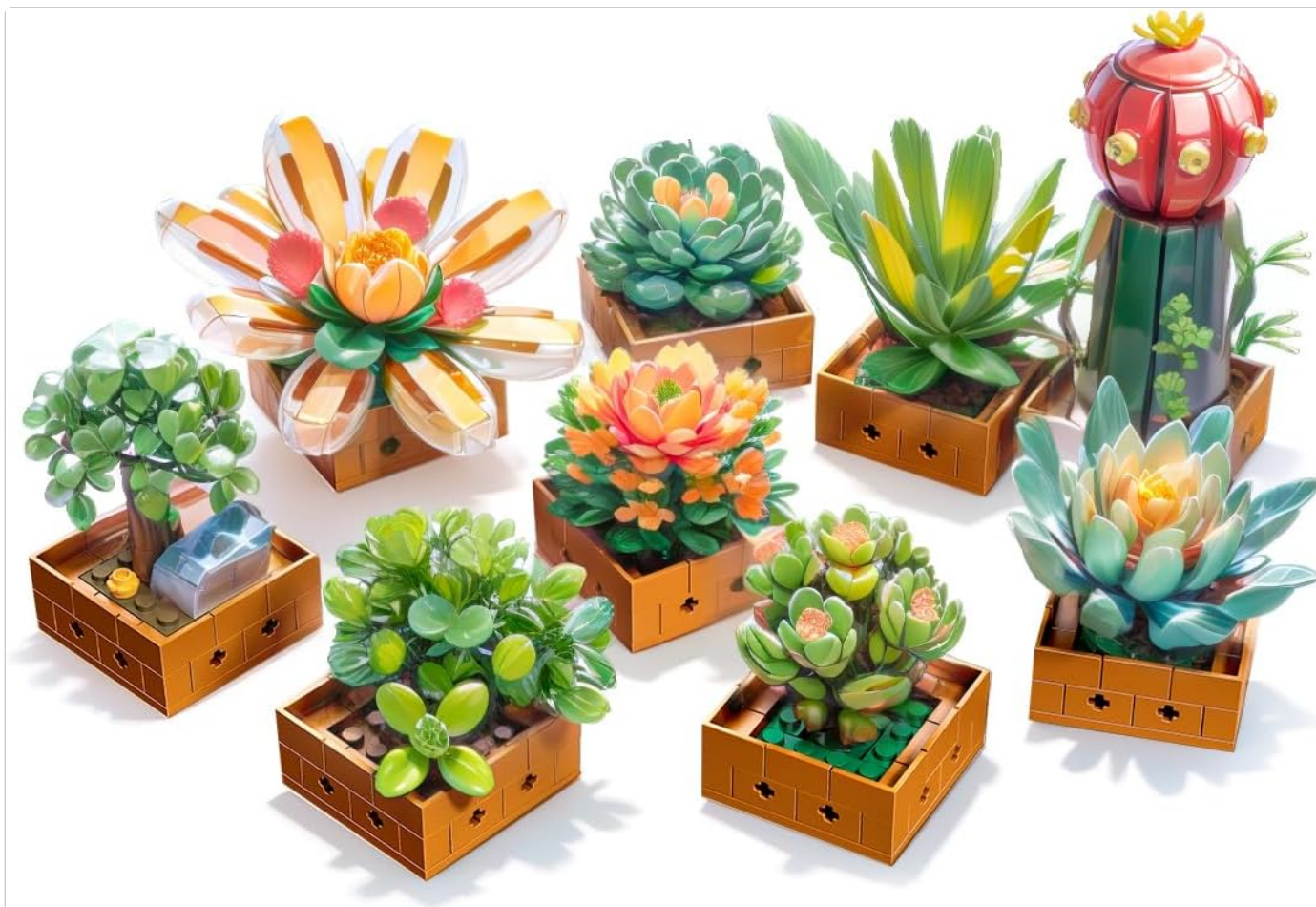
Image 5.1: A complete set of 9 assembled succulent models, ready for display.