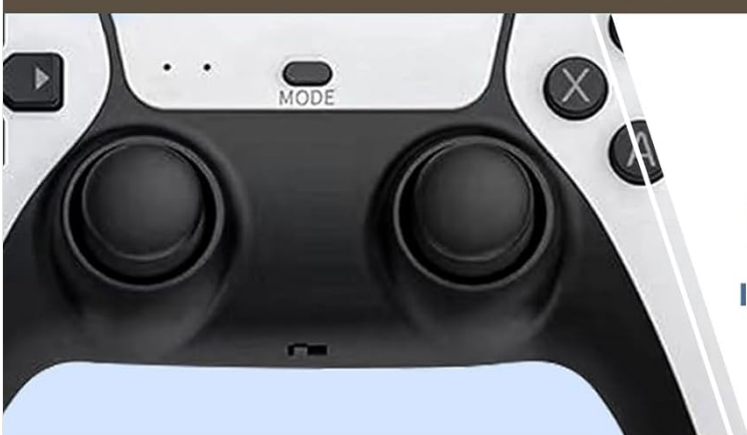
Figure 4: Wireless control range of up to 8 meters.

The controllers feature a streamlined design for comfortable grip and highly sensitive joysticks for precise control. Several buttons can be used in combination for specific in-game actions.