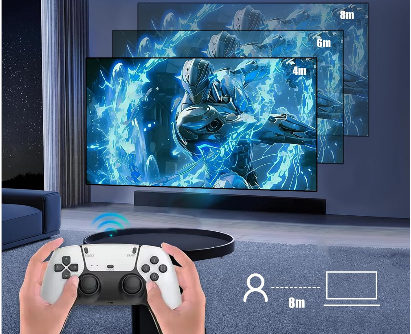
Figure 5: Controller features including handle design and button layout.