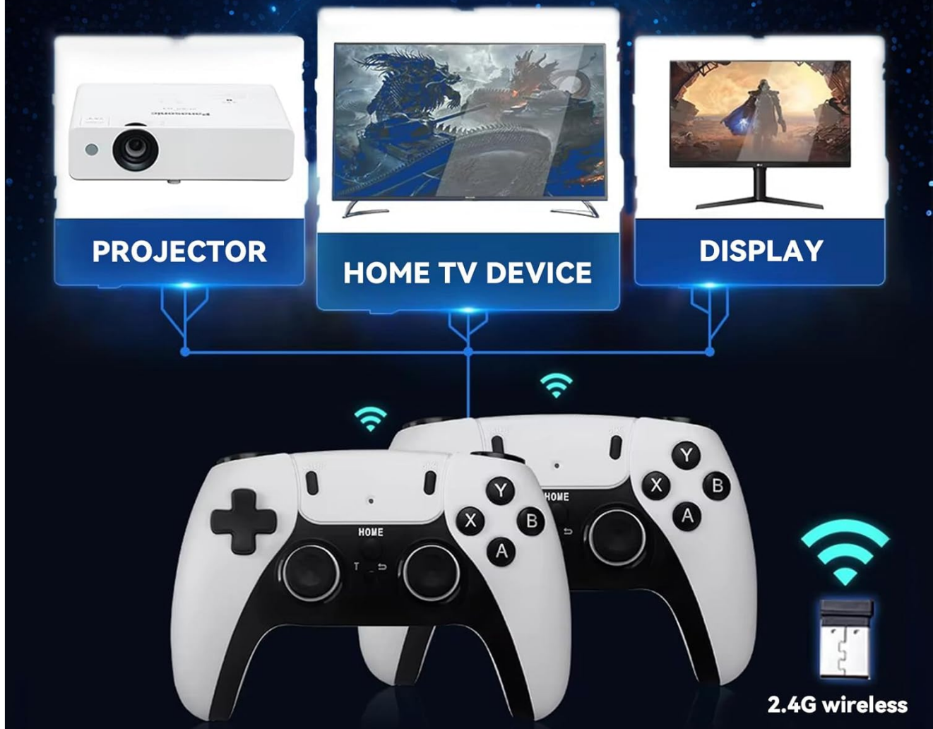
Figure 6: Experience 4K HD TV video output.