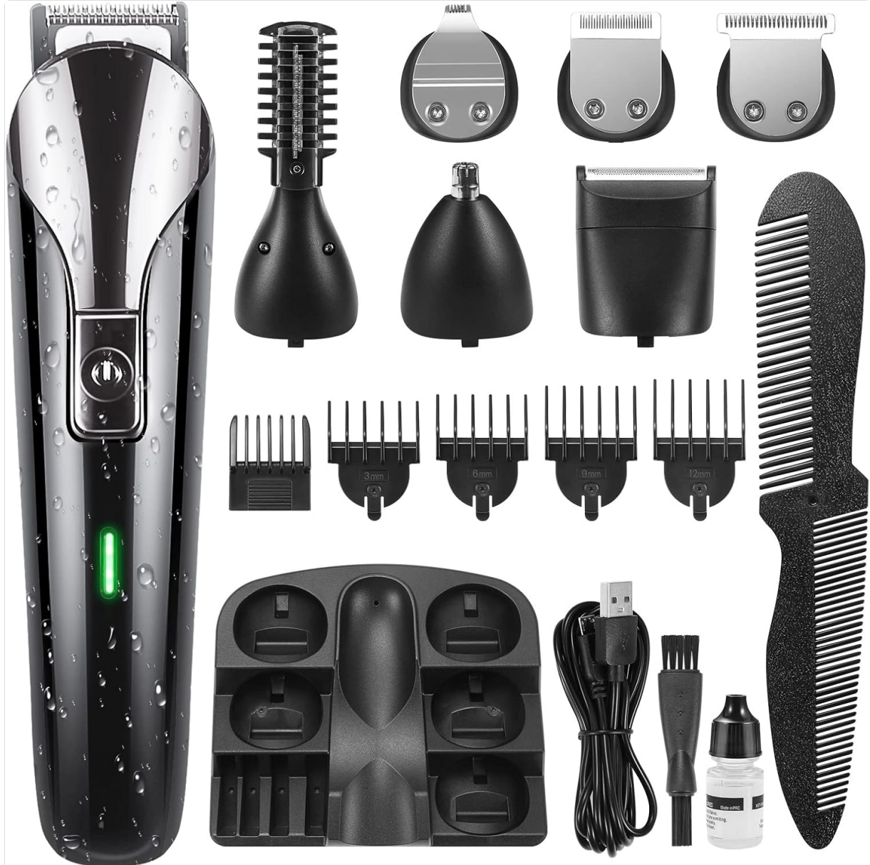
Image: Complete eboboin Beard Trimmer Kit showing the main unit, various trimmer heads, guide combs, charging stand, USB cable, cleaning brush, and oil.

The eboboin Multi-Functional Beard Trimmer Kit includes a main cordless trimmer unit and six interchangeable heads designed for various grooming needs. The kit also features a convenient charging stand to keep all accessories organized.