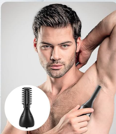
Body Hair Trimmer