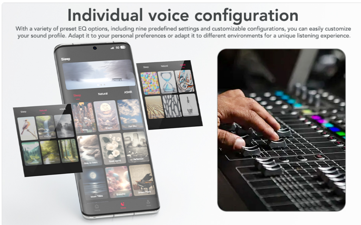
Image 4.3: The Saymi app offers individual voice configuration and sound customization options.