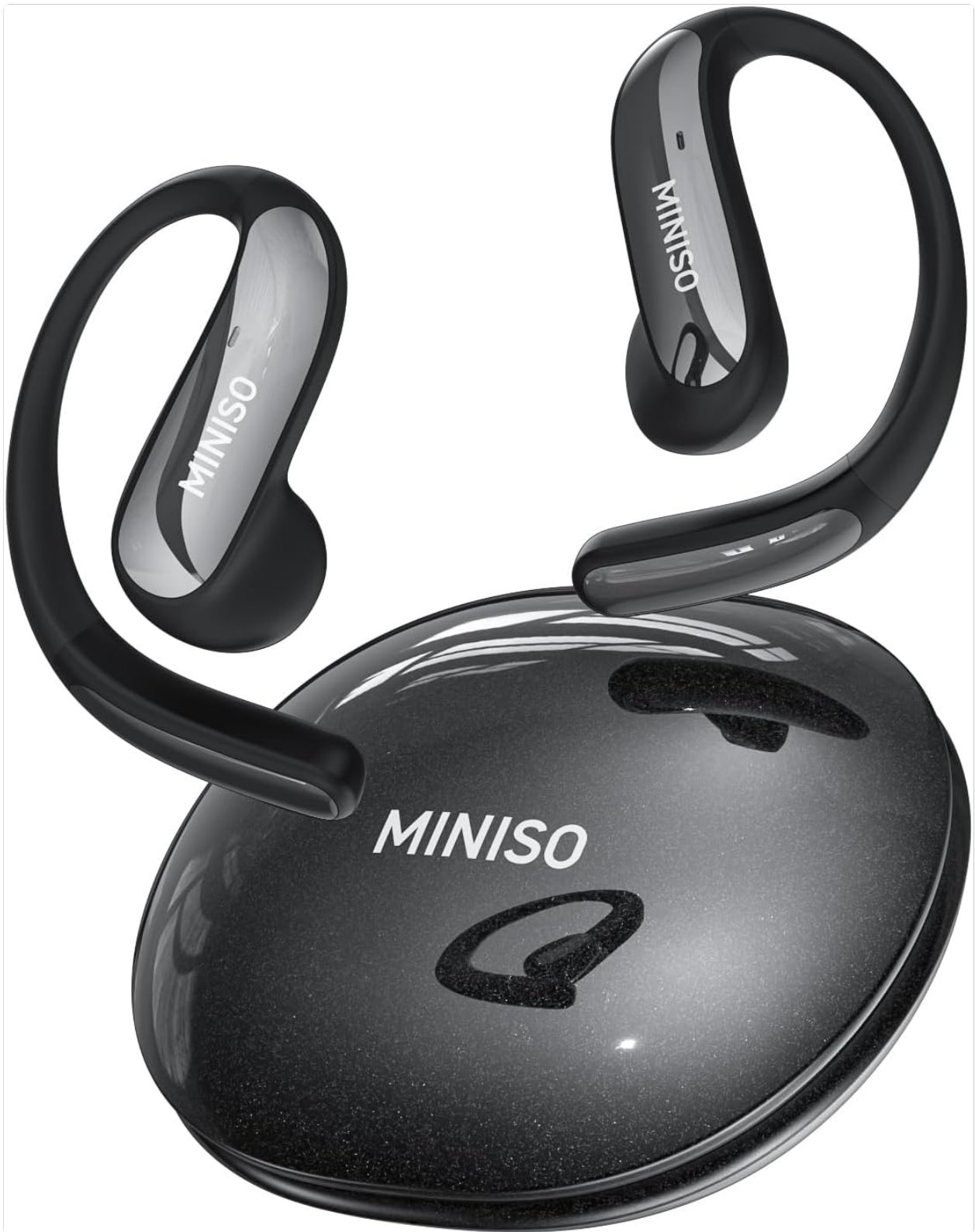
Image 1.1: MINISO AI Translation Earbuds Model X31 with its charging case.