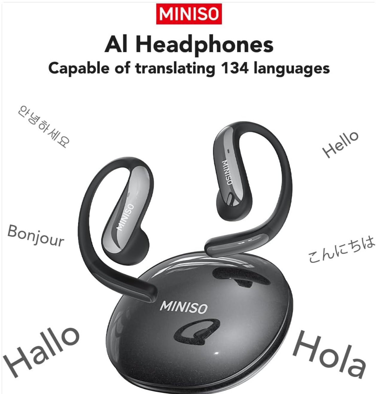
Image 2.1: The MINISO AI Translation Earbuds are capable of translating 134 languages, facilitating global communication.