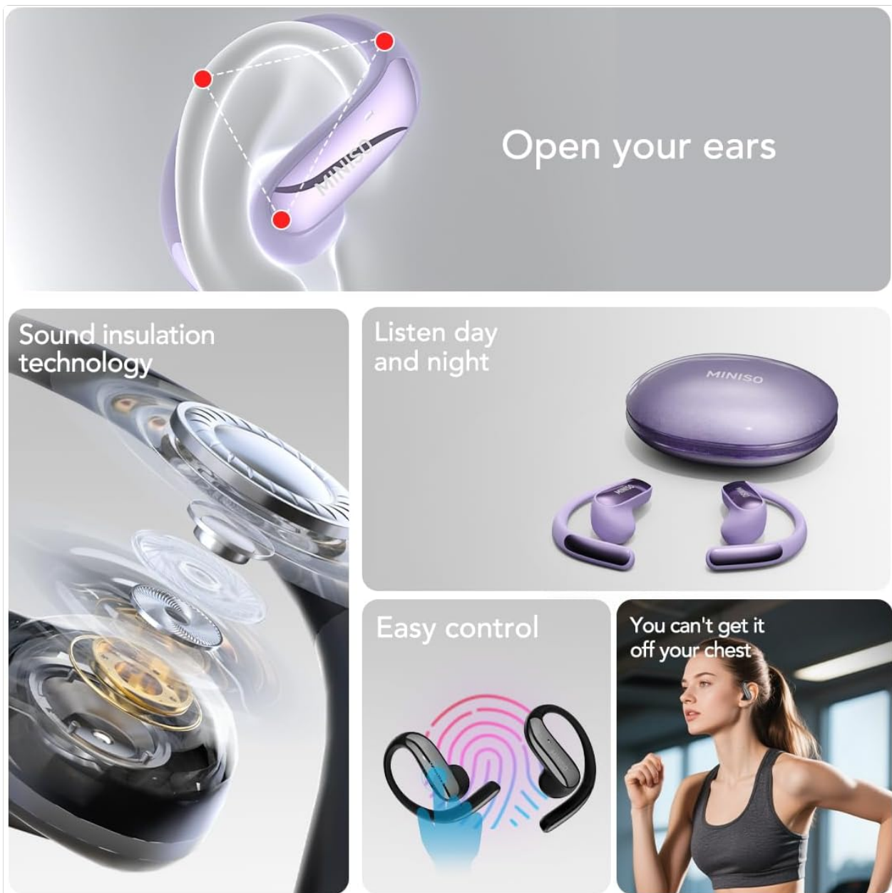
Image 2.2: Key design and audio features, highlighting the open-ear comfort and sound technology.