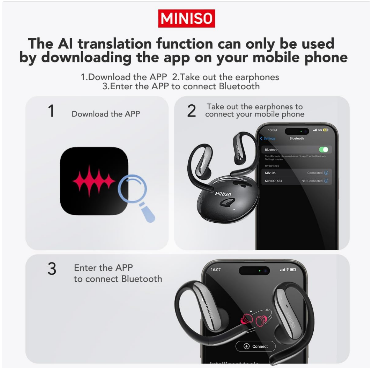
Image 3.1: Step-by-step guide for app download and Bluetooth connection.

5. Connect within App: Open the Saymi app. The app will prompt you to connect the earbuds. Tap "Connect" to establish the connection within the application for translation functionalities.