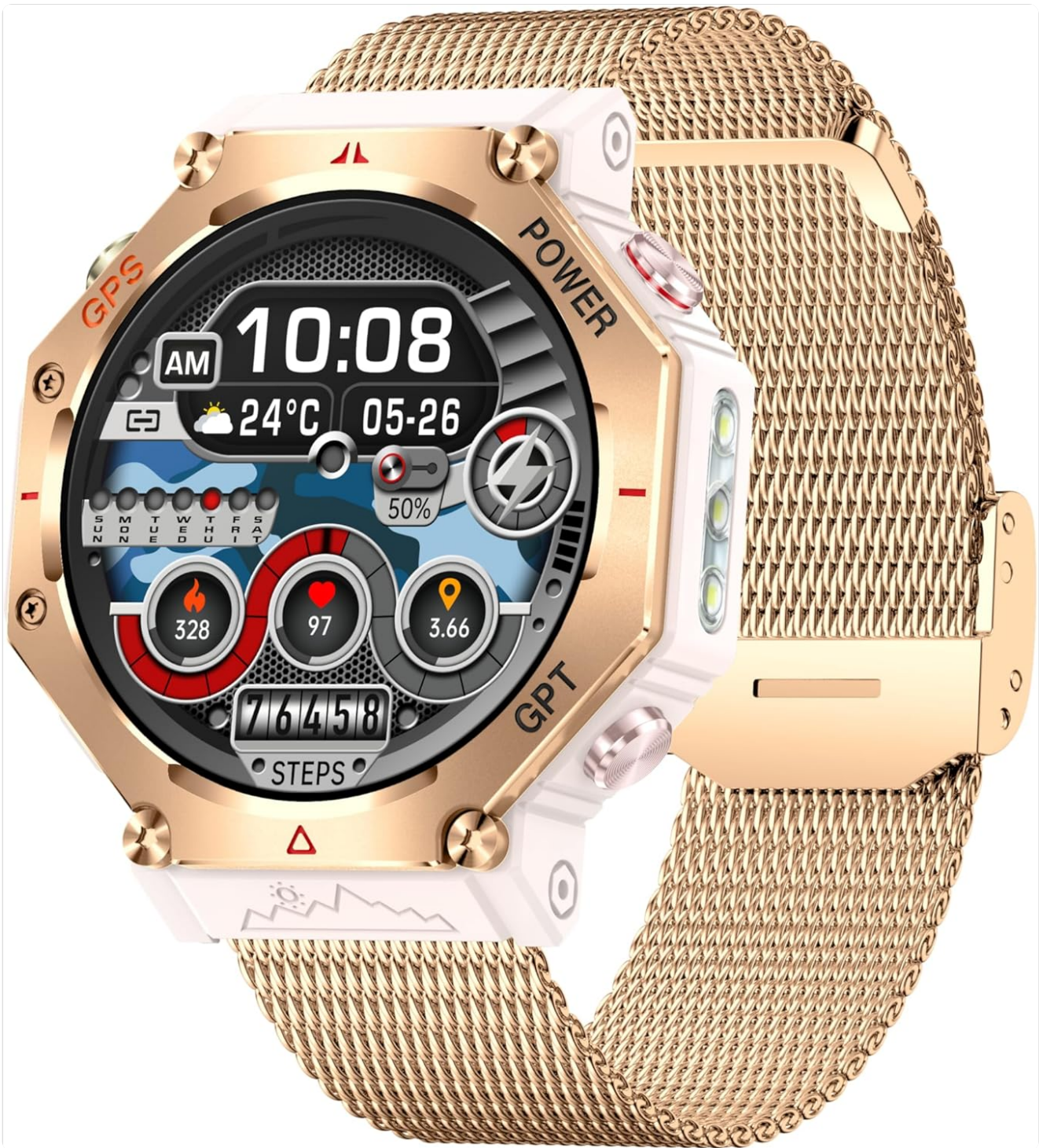
Image: The ZLKJ ZL-SW8 Smartwatch in Rose Gold, showcasing its round display and metallic mesh strap.