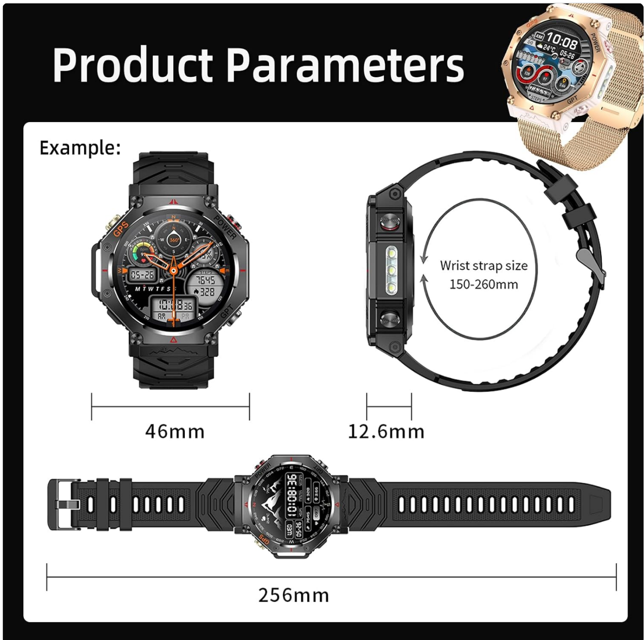
Image: Diagram illustrating the dimensions and button layout of the ZLKJ ZL-SW8 Smartwatch, including labels for GPS, Power, and GPT buttons.