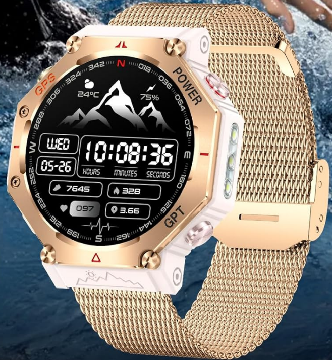
Image: A person swimming while wearing the ZL-SW8 smartwatch, illustrating its IP68 waterproof capability for aquatic activities.