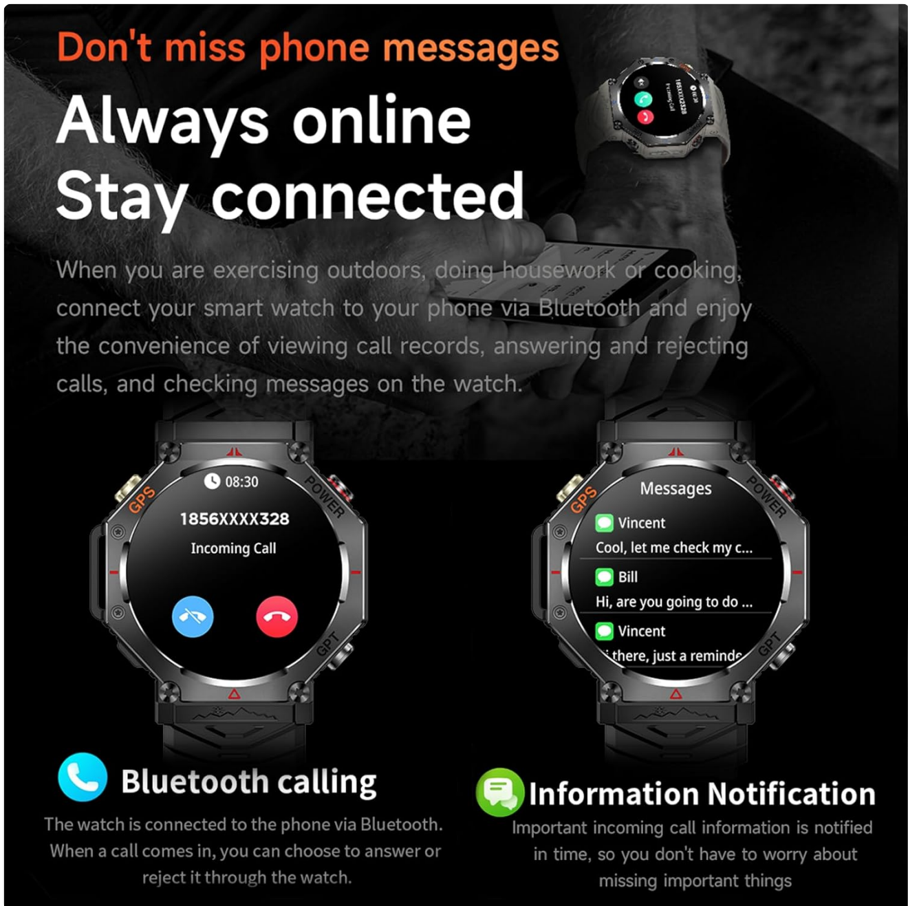
Image: A visual representation of the smartwatch displaying an incoming call and message notifications, highlighting its Bluetooth calling and notification features.