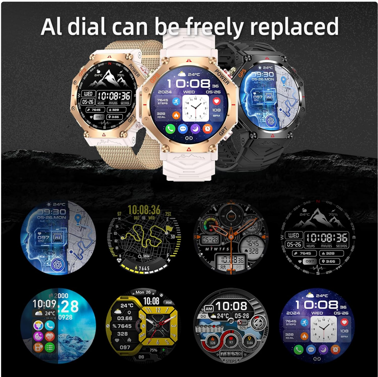
Image: The ZL-SW8 smartwatch displaying multiple customizable watch faces, including digital and analog styles, and options to upload personal photos.