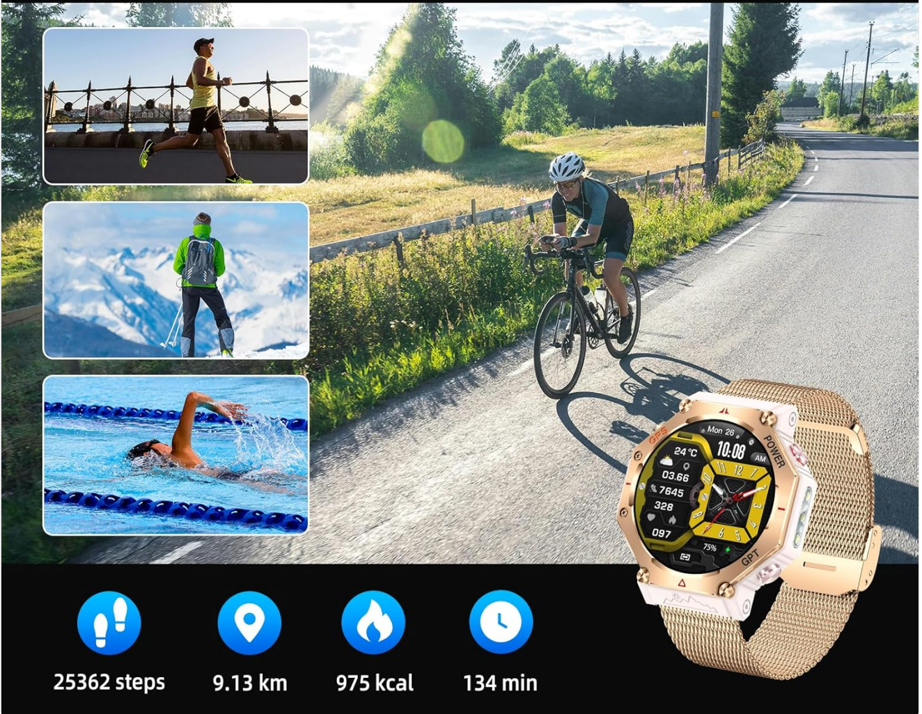
Image: The ZL-SW8 smartwatch interface showing icons for over 100 sports modes, with background images of people engaging in various outdoor activities like cycling, hiking, and swimming.