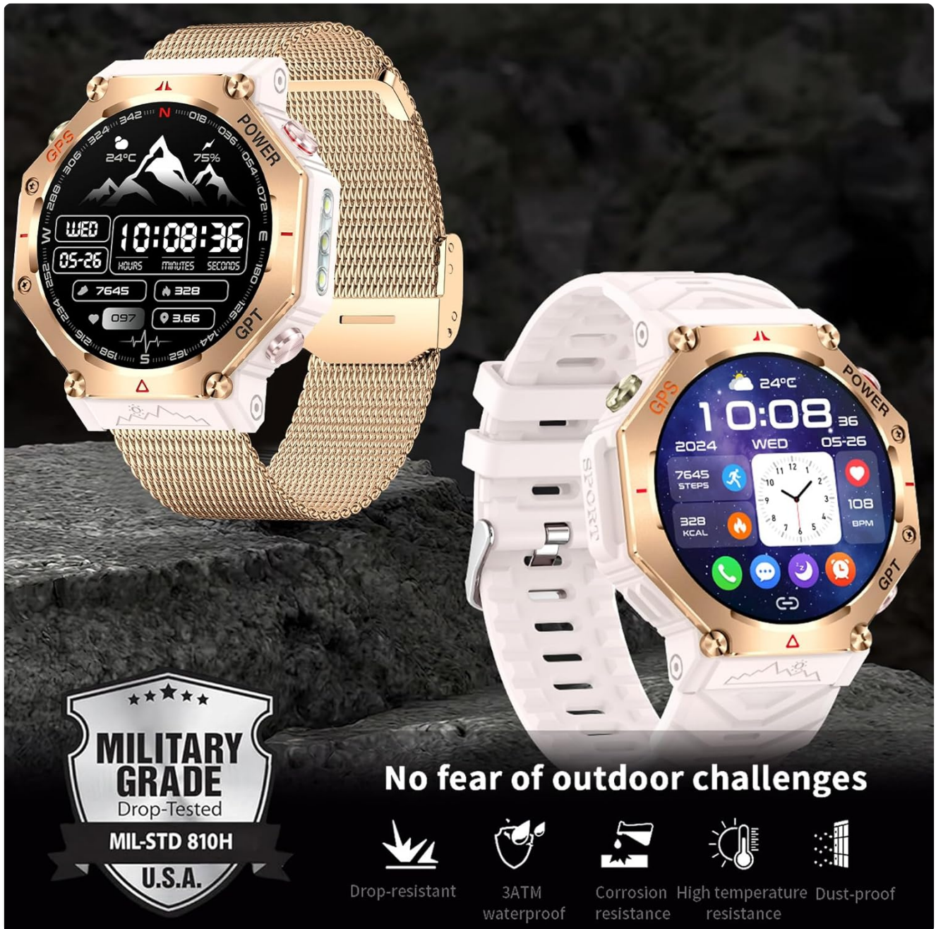
Image: Two ZL-SW8 smartwatches (Rose Gold and Black) highlighting military-grade drop resistance and 3ATM waterproof features, suitable for outdoor challenges.