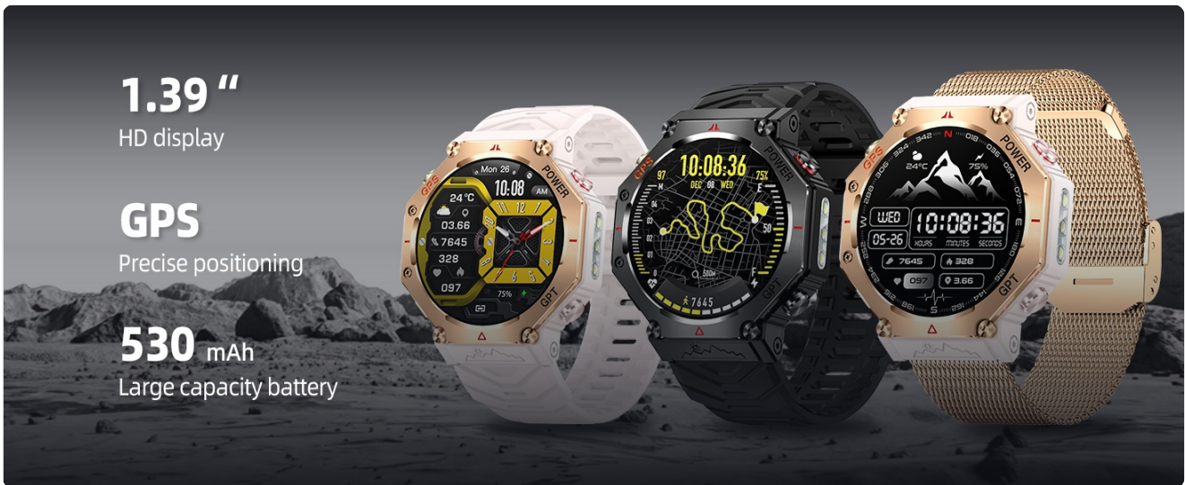
Image: Three ZL-SW8 smartwatches (white, black, rose gold) illustrating key specifications: 1.39" HD display, precise GPS, and a 530 mAh large capacity battery.