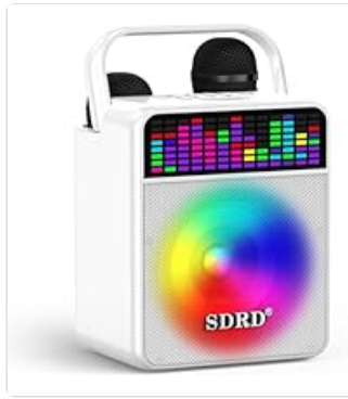
Image: Interactive sound effects buttons on the karaoke machine.