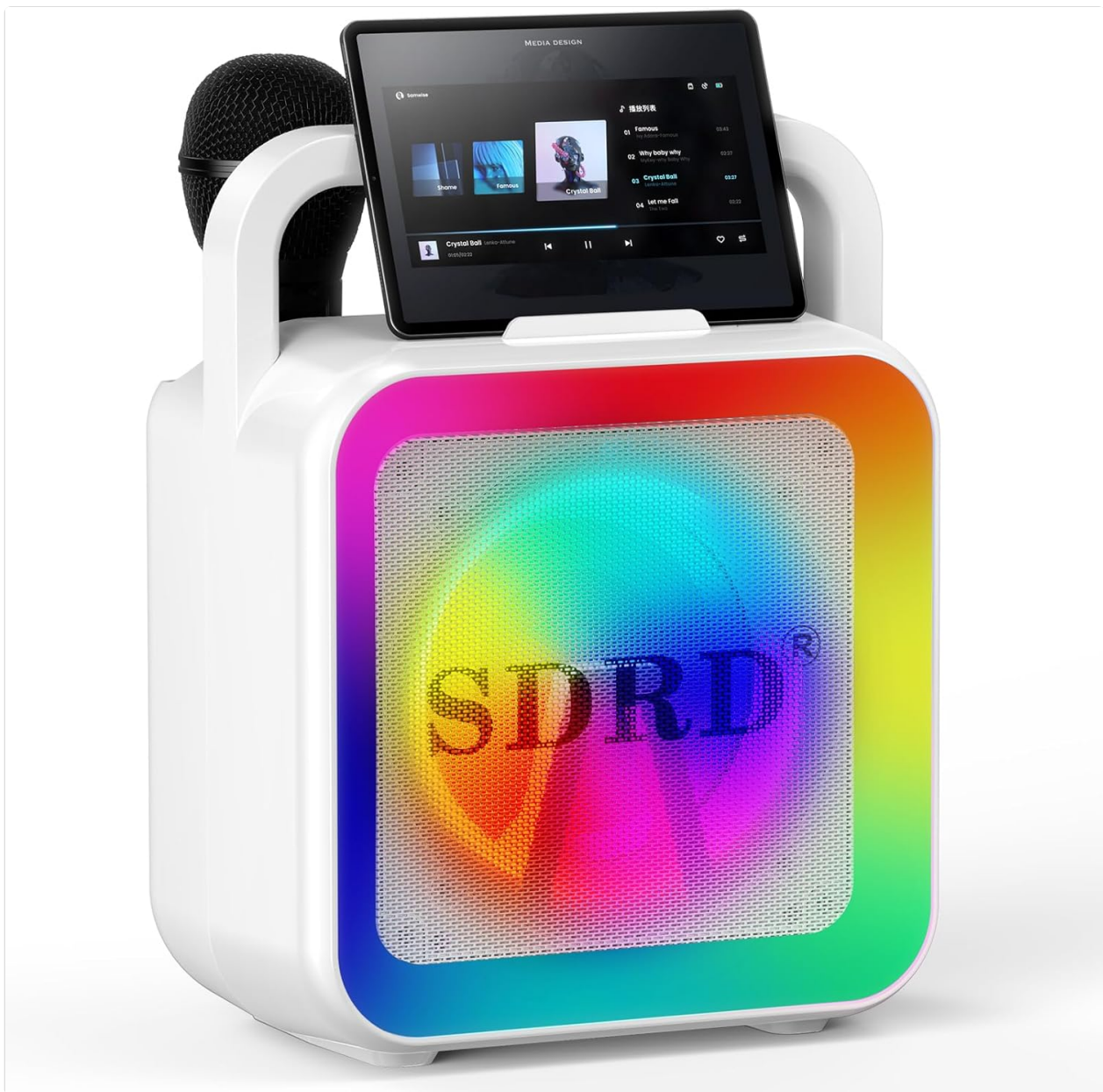
Image: The SDRD SD-516 Karaoke Machine with its two wireless microphones.