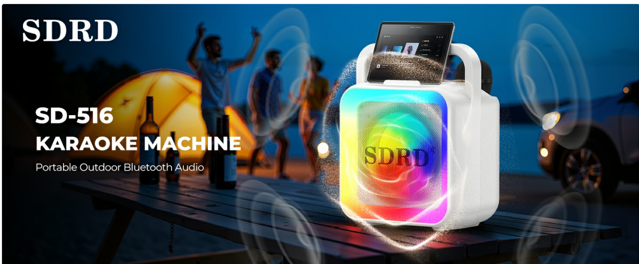
Image: The SDRD SD-516 in various usage scenarios.

The portable design and long battery life make the SDRD SD-516 suitable for various occasions, including home use, camping trips, street performances, small music festivals, and birthday parties.