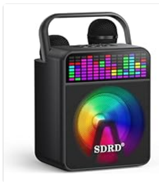
Image: Seven dynamic LED light modes.

The karaoke machine features dynamic LED lights with 7 different modes. Press the 'LED Light' button on the control panel to cycle through the available lighting effects and match the mood of your event.