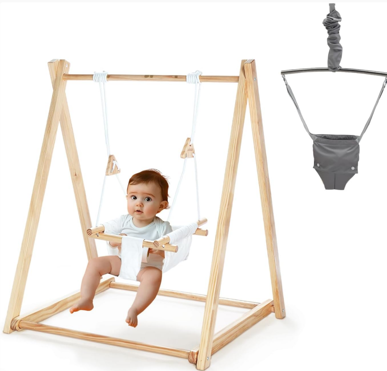
Image: The complete JOYMOR 2-in-1 Wooden Baby Swing and Jumper set.