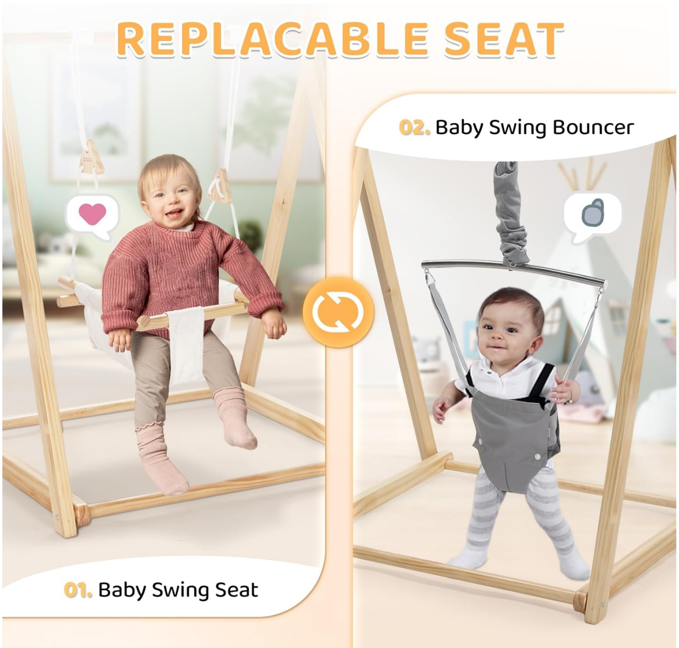
Image: Demonstration of the replaceable seat feature, highlighting the swing seat and bouncer options.