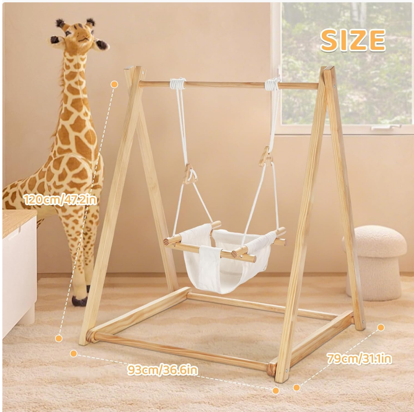
Image: Product dimensions for the A-frame baby swing.