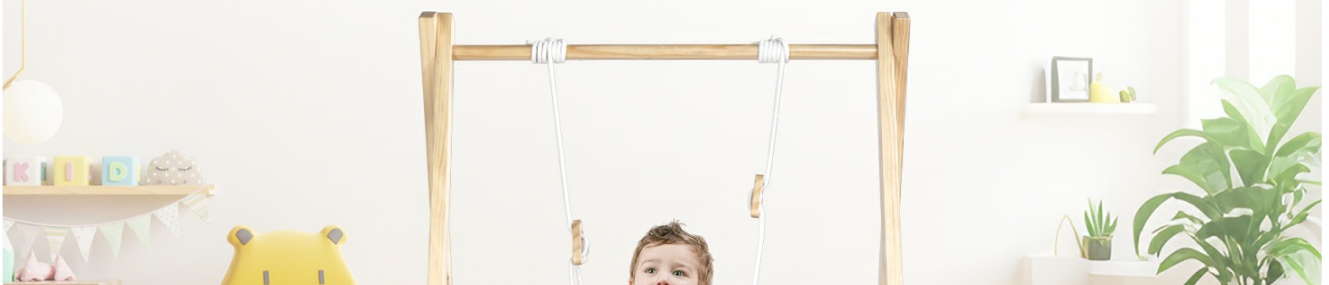
Image: Confirmation of safe and high-quality materials with relevant safety certifications.