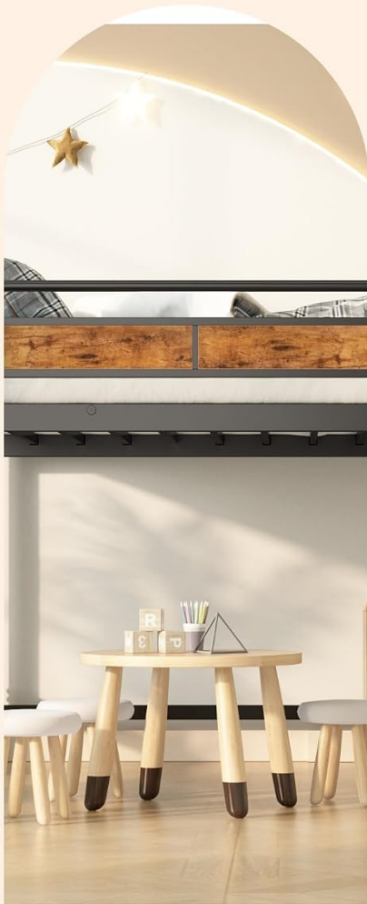
A reading area