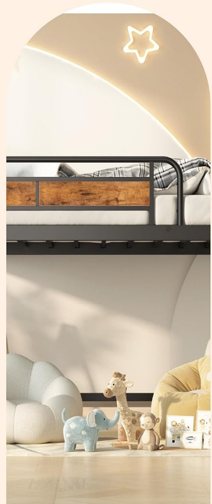
A little cozy area

Image 5: Visual examples demonstrating how the 31-inch under-bed space can be utilized for a reading area, playing area, or cozy nook.