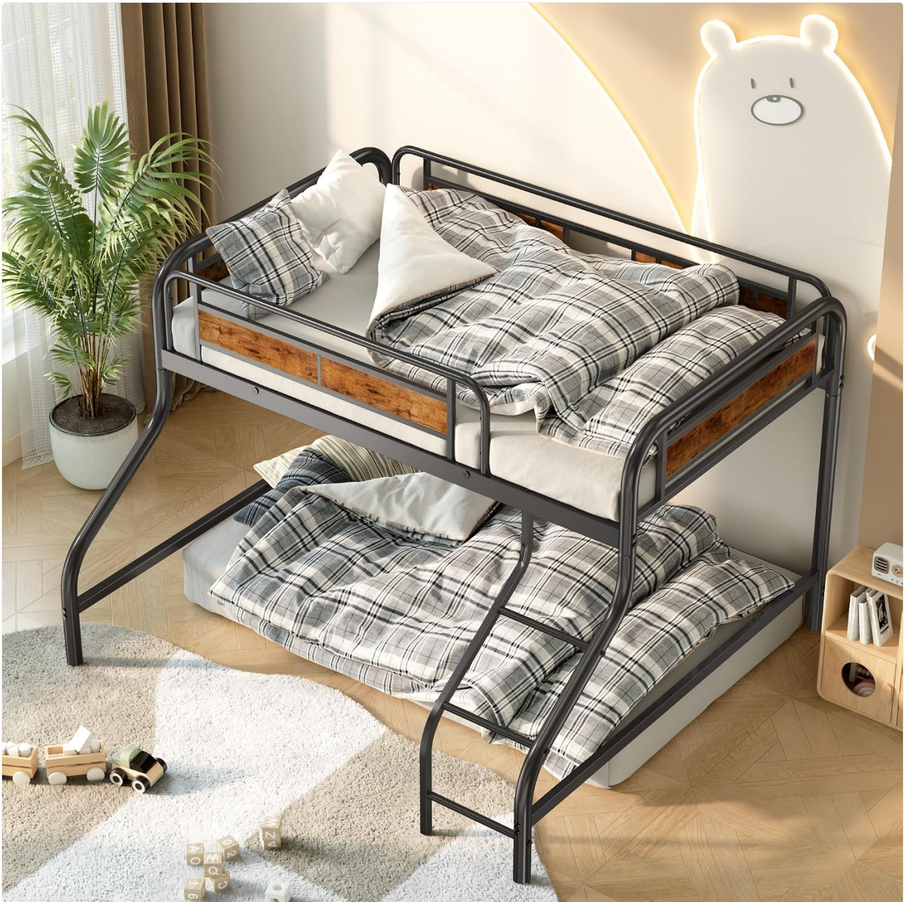
Image 1: Fully assembled soges Twin Metal Loft Bed Frame, showcasing its design and structure.