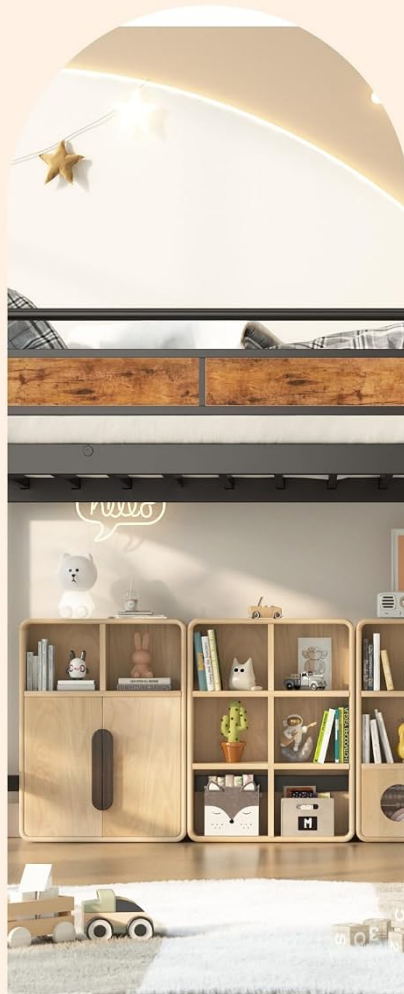
A playing area