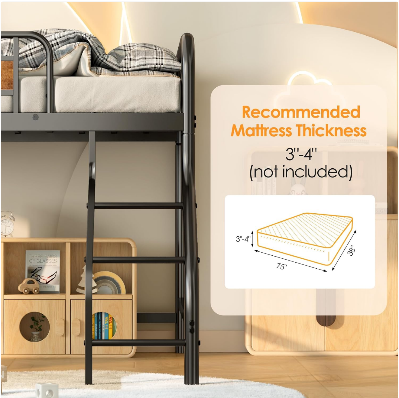
Image 4: Illustration showing the recommended mattress thickness of 3-4 inches for optimal safety and guardrail effectiveness.