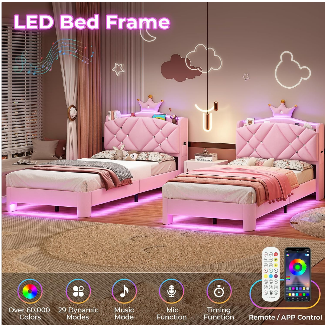
Image: LED Bed Frame Features. This image illustrates the bed frame with its active LED lights and highlights control options via remote or app, offering over 60,000 colors, 29 dynamic modes, music function, microphone function, and timing function.