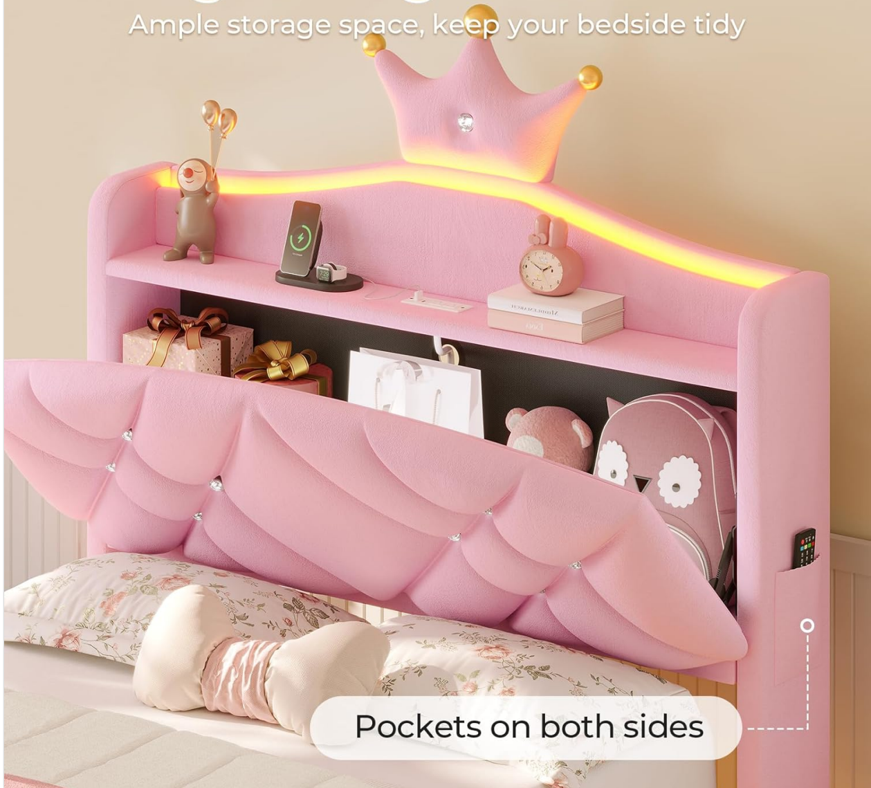
Image: Large Storage Headboard. This image displays the headboard's storage capabilities, including a hidden compartment, an open shelf, and side pockets, designed to keep bedside items organized and the room tidy.

Ample storage space, keep your bedside tidy