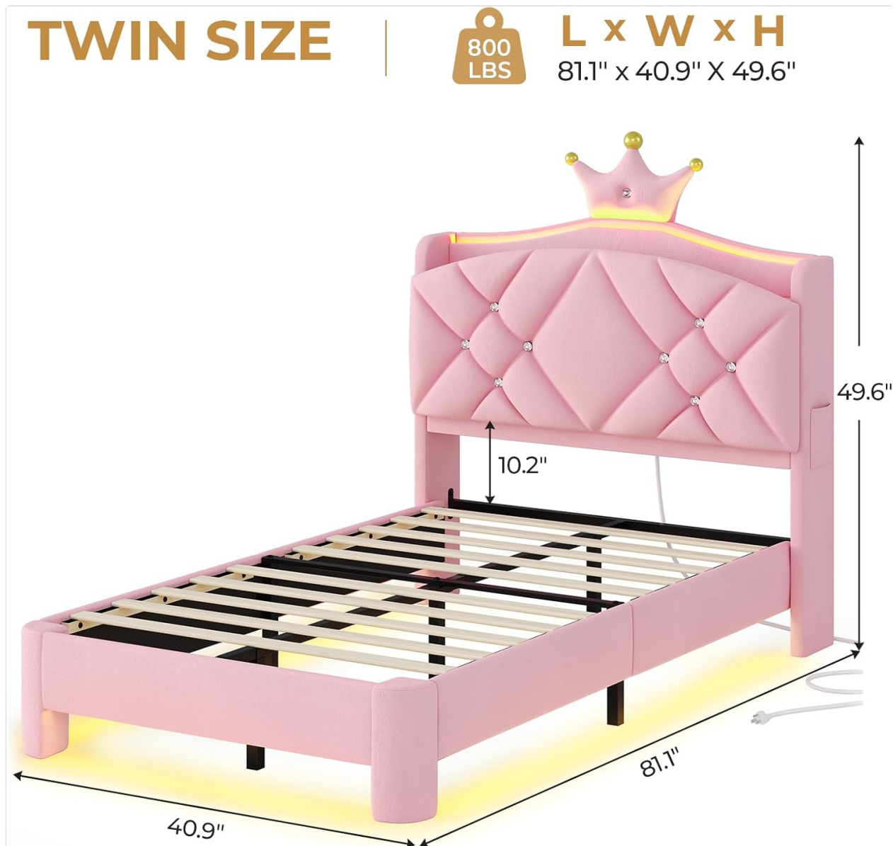
Image: Dimensions of the MSmask Twin Bed Frame. The bed measures 81.1 inches long, 40.9 inches wide, and 49.6 inches high. The headboard height from the slats is 10.2 inches.