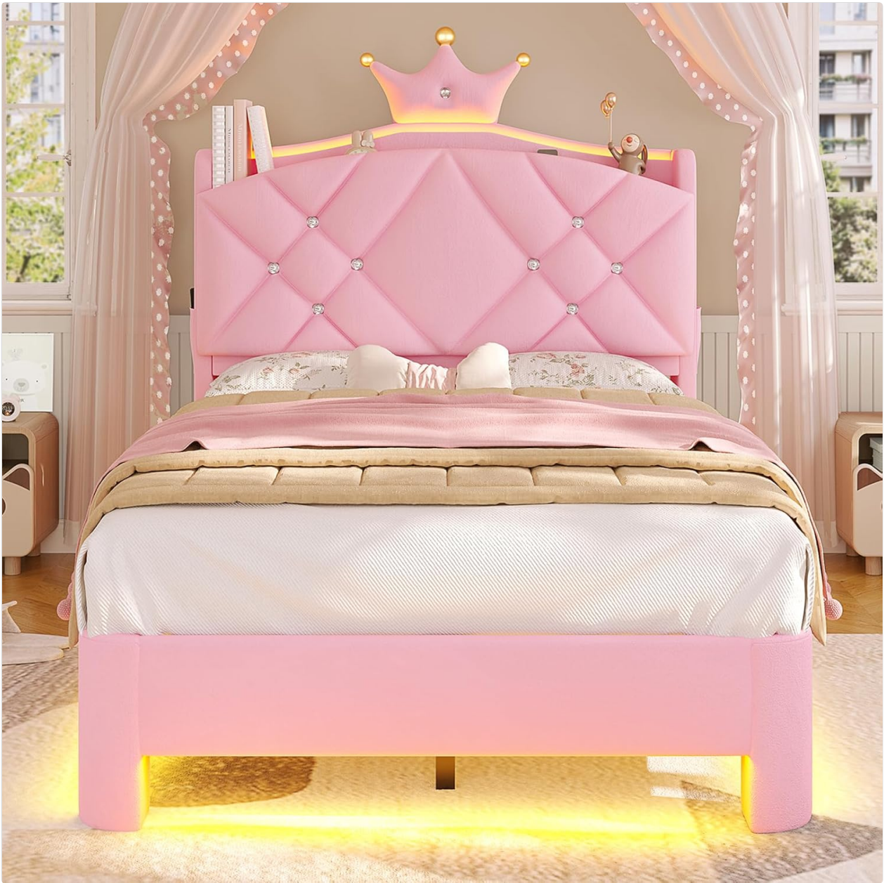
Image: MSmask Twin Bed Frame. A full front view of the assembled bed frame, showcasing its pink velvet upholstery, LED lights, and decorative headboard.