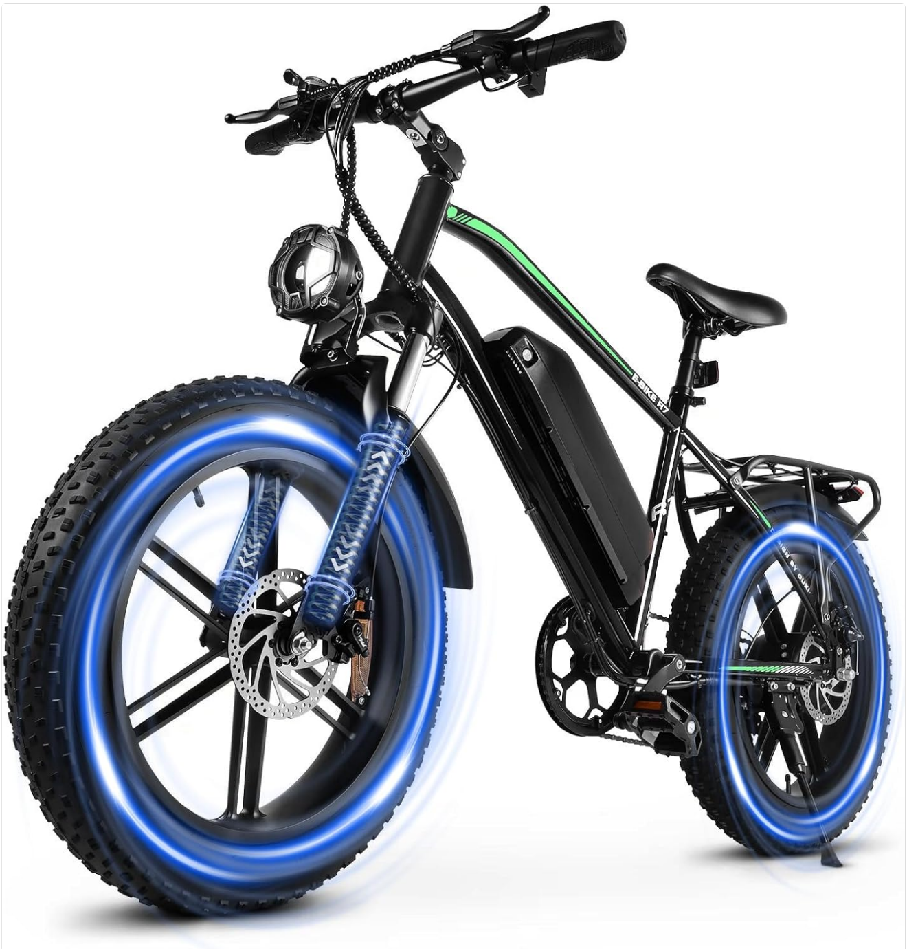
Figure 4.1: Fully assembled OUXI R7 Electric Bike. This image shows the complete bike with fat tires, front suspension, headlight, rear rack, and the battery integrated into the frame.

The OUXI R7 Electric Bike requires some assembly. General assembly involves attaching the front wheel, handlebars, pedals, and seat. Ensure all bolts and quick releases are securely fastened before riding. It is recommended to consult the assembly video available on the product page for detailed visual instructions.