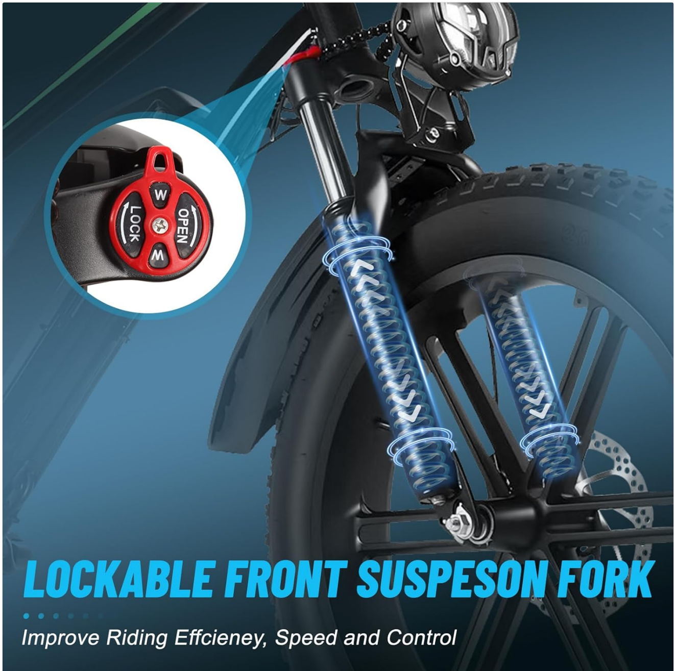
Figure 5.3: Detail of the lockable front suspension fork, showing the 'Lock' and 'Open' settings for adjusting ride efficiency and control.