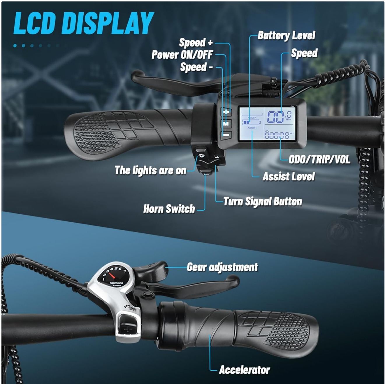
Figure 5.2: Close-up view of the handlebar controls, including the clear LCD display showing battery level, speed, and PAS level, along with the 7-speed shifter, headlight, and taillight.