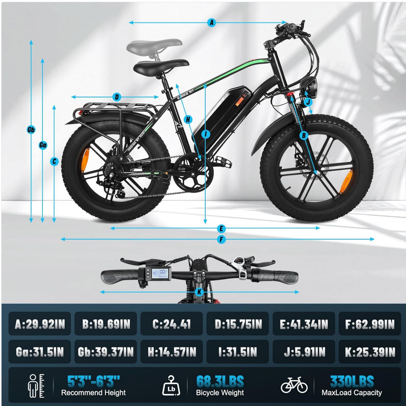
Figure 9.1: Detailed diagram illustrating the dimensions of the OUXI R7 Electric Bike and key specifications such as recommended height, bicycle weight, and maximum load capacity.