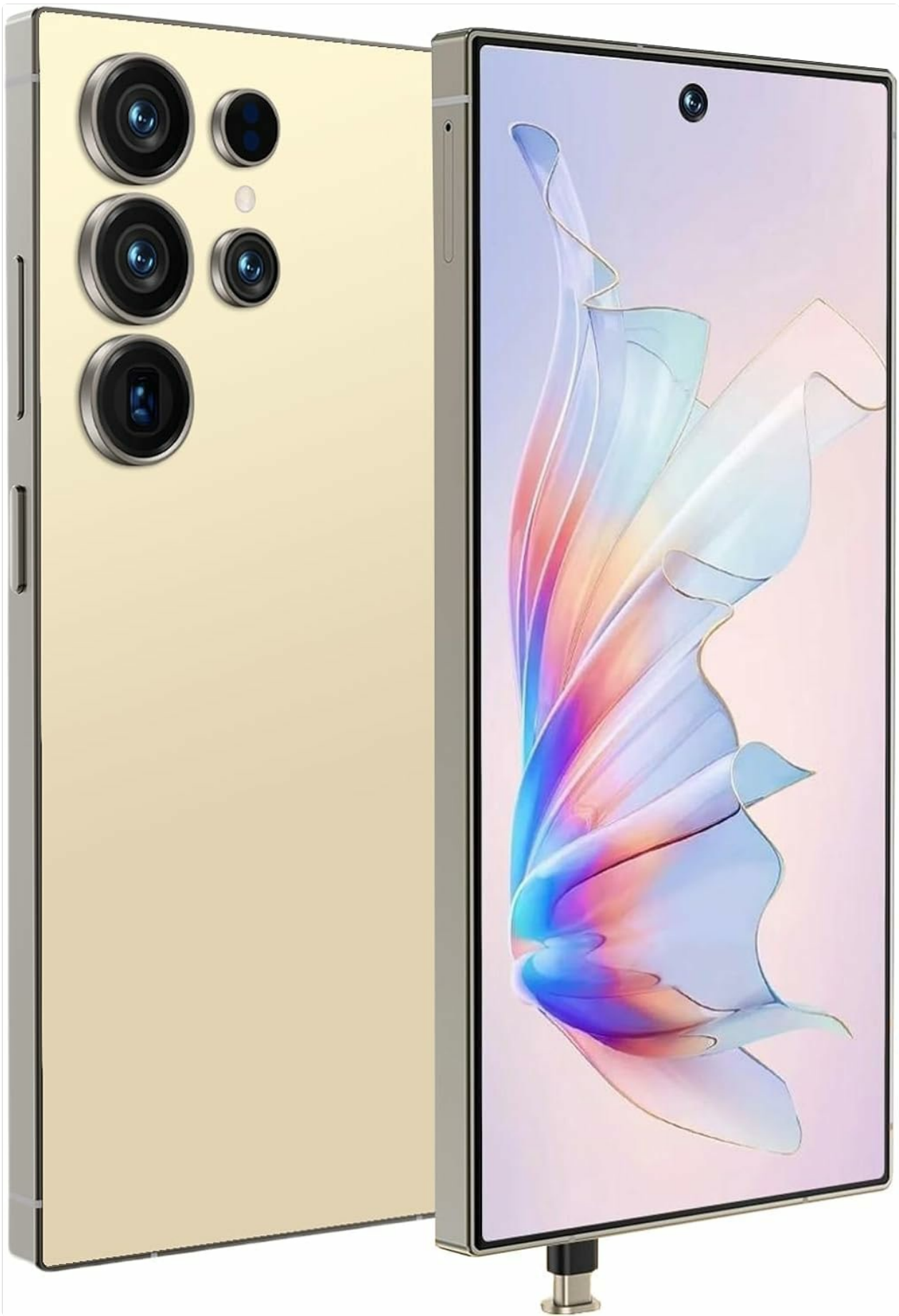
Image: Front and rear view of the SANSHREUNI C25 Ultra.