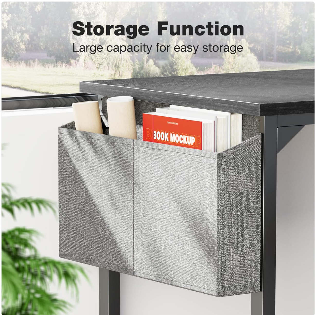
Image 5.1: The multifunctional storage bag keeps your workspace organized.