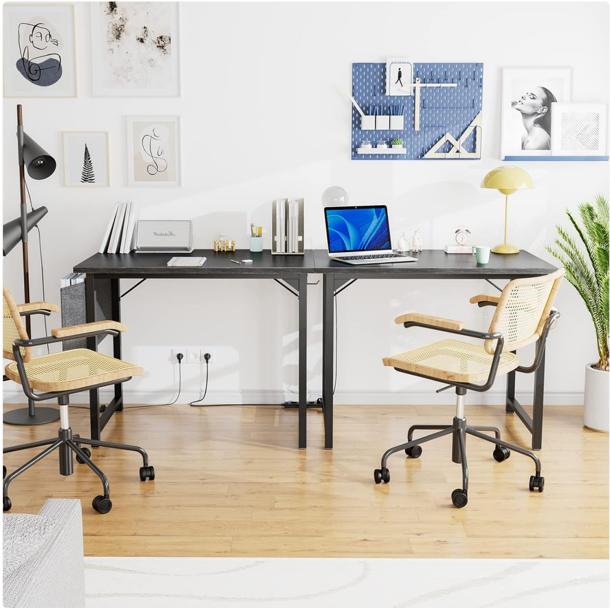
Image 5.3: The desk's compact size makes it ideal for smaller spaces.