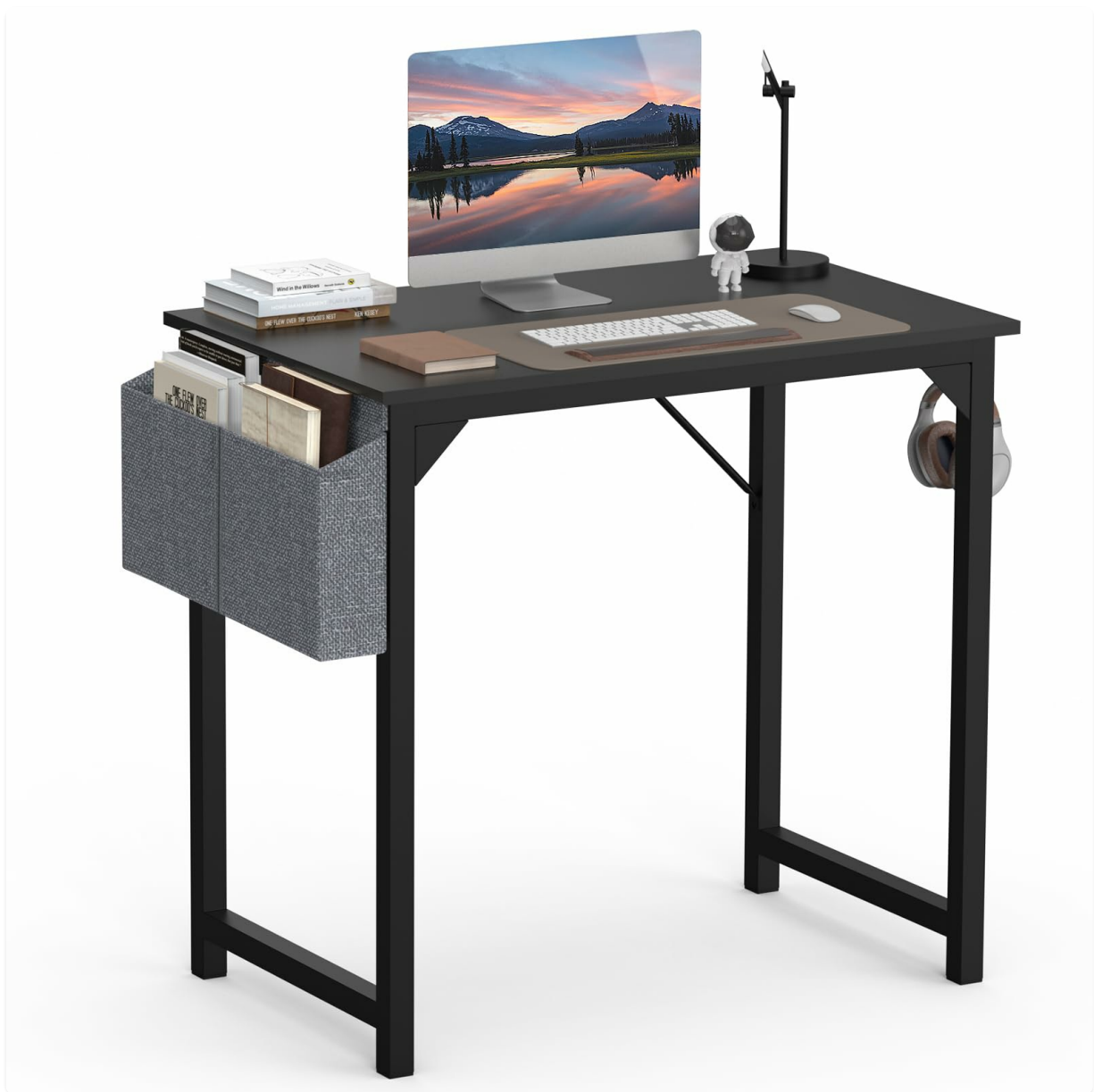
Image 1.1: The OLIXIS 32 Inch Office Desk in a modern home office setup.