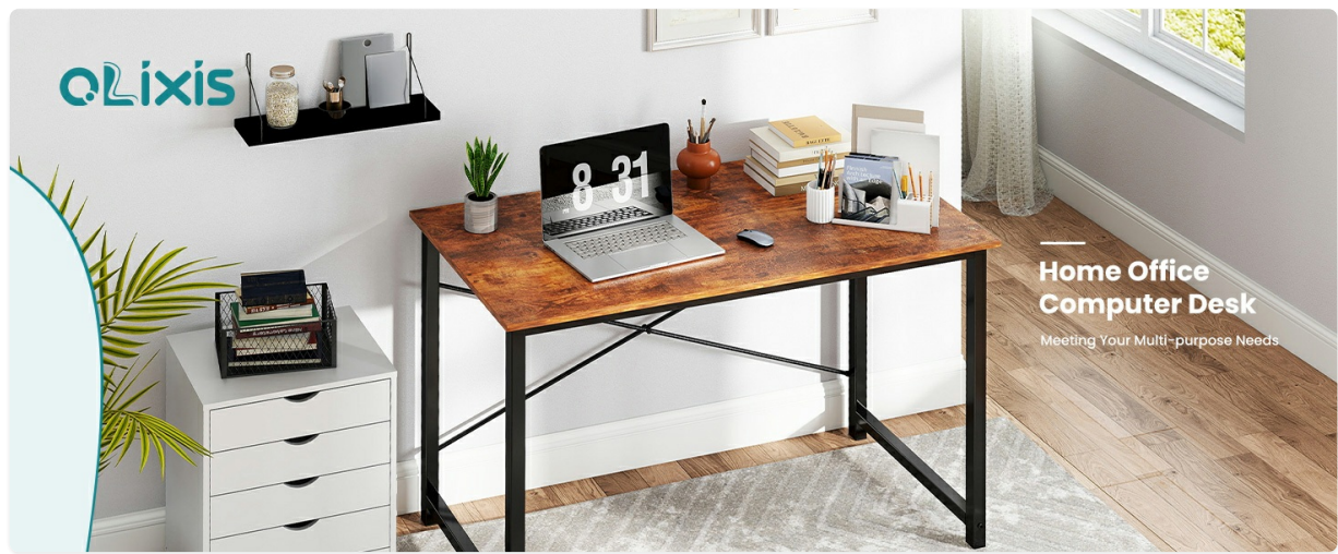
Image 4.2: The heavy-duty metal frame ensures stability and durability.