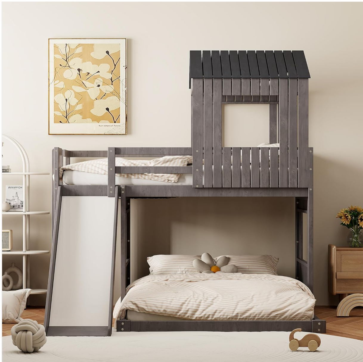
Image: The GDFStudio Twin Over Full House Bunk Bed with Slide, showcasing its playhouse design and integrated slide, set up in a child's bedroom.