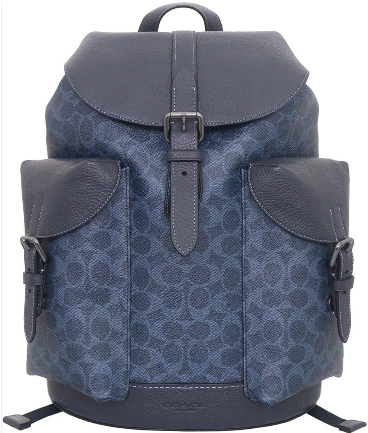
Figure 2.1: Front view of the COACH Warner Signature Coated Canvas Leather Backpack, Model CW211. This image displays the main flap, buckle detail, and the two front magnetic pockets, highlighting the signature pattern and leather trim.