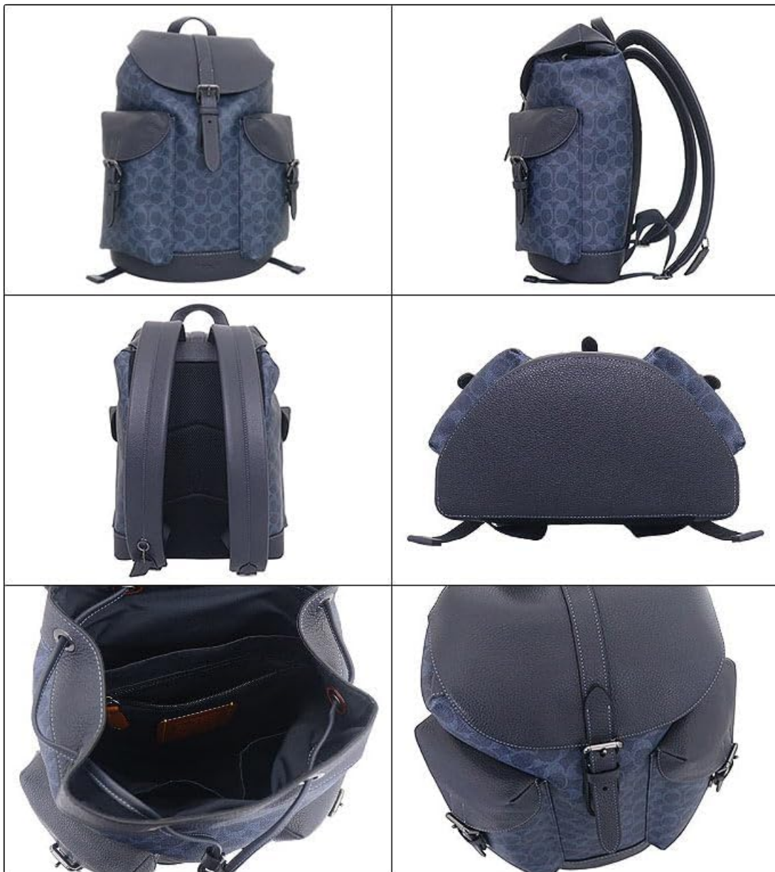
Figure 4.1: This collage displays various angles of the COACH Warner backpack, including the front, side, back, and bottom. A detailed view of the open interior reveals the zipper pocket, gusseted open pocket, and other organizational features.