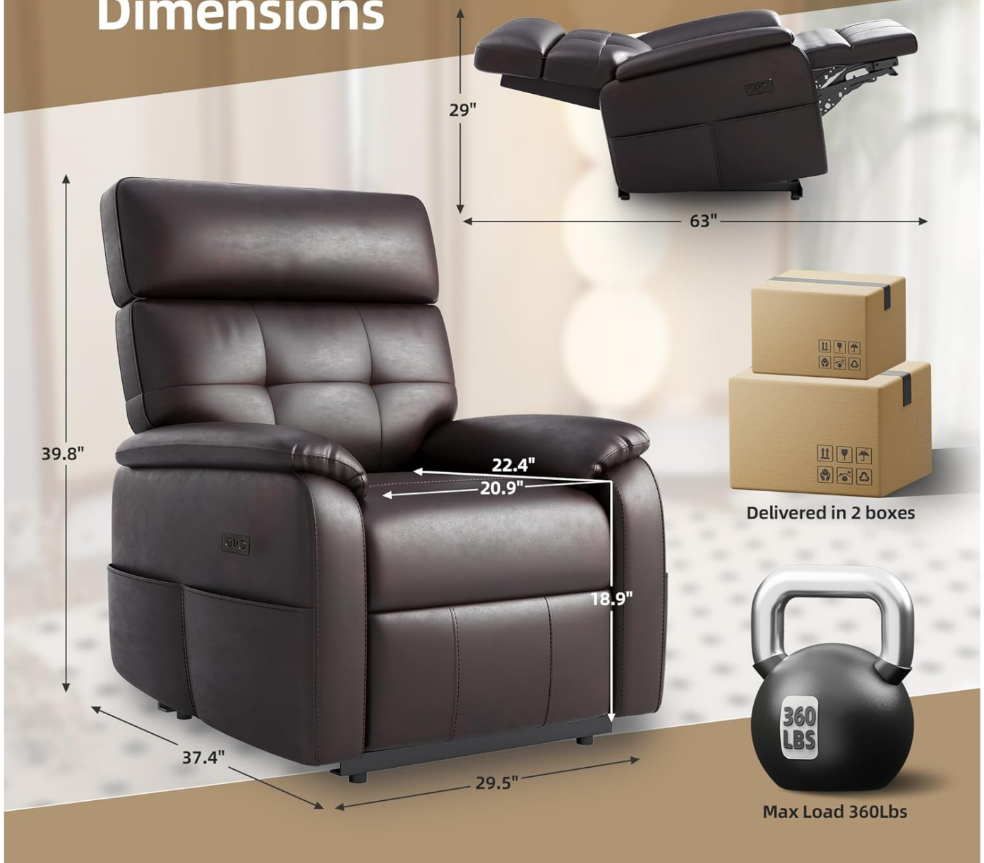
Image: Detailed product dimensions including depth, width, and height, along with seat depth and armrest height.