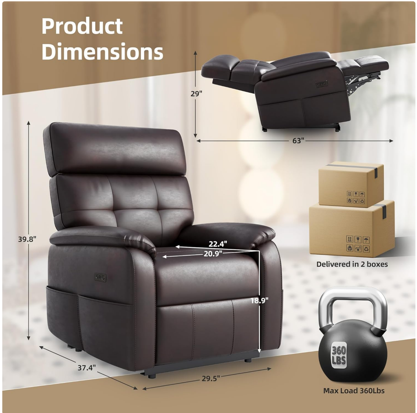
Image: Diagram illustrating the product dimensions and indicating that the chair is delivered in two boxes.