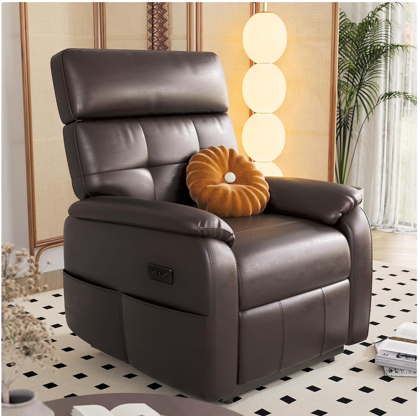
Image: The Claiks Zero Gravity Recliner Chair, showcasing its dark brown PU leather finish and comfortable design.