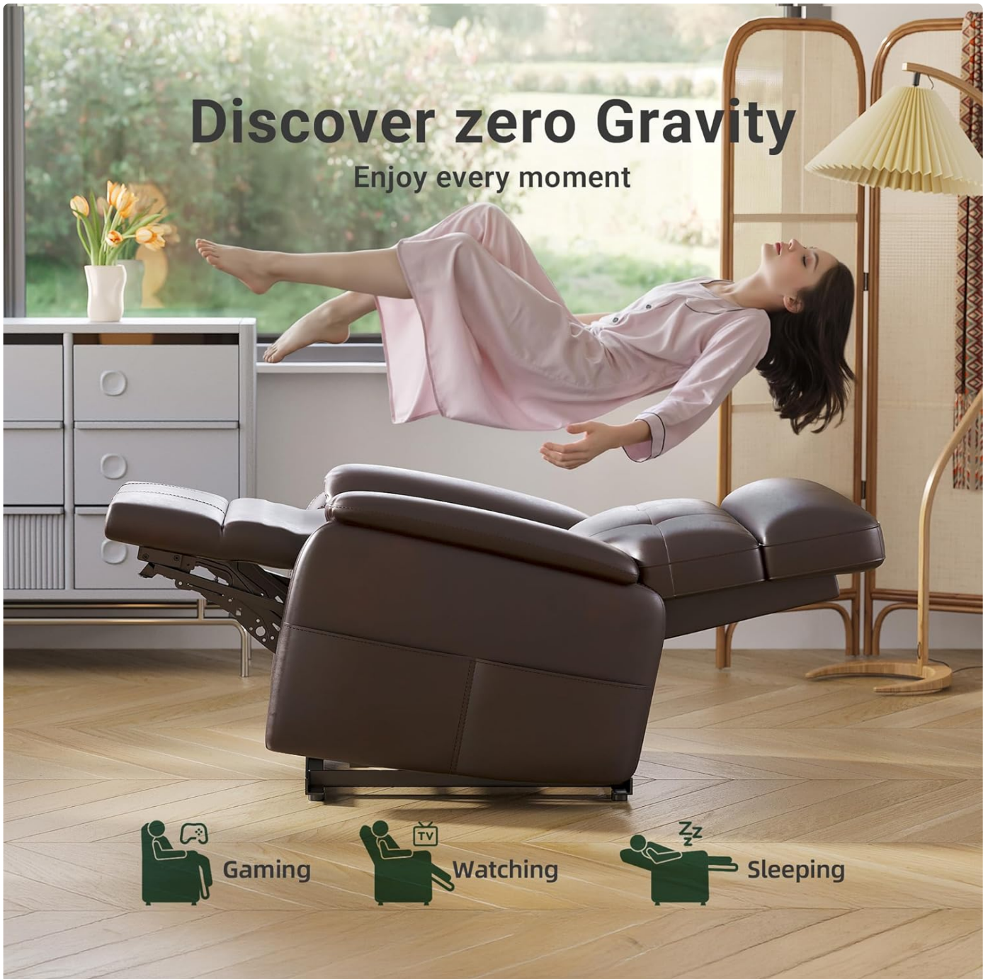
Image: Visual representation of the zero gravity recline feature, showing how it can be used for gaming, watching, or sleeping.