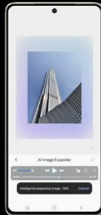
AI Image Expander