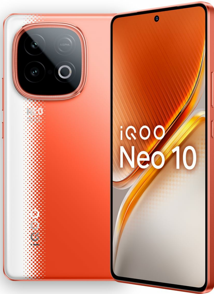
Image: The iQOO Neo 10 smartphone in Inferno Red, showcasing its sleek design and camera module.