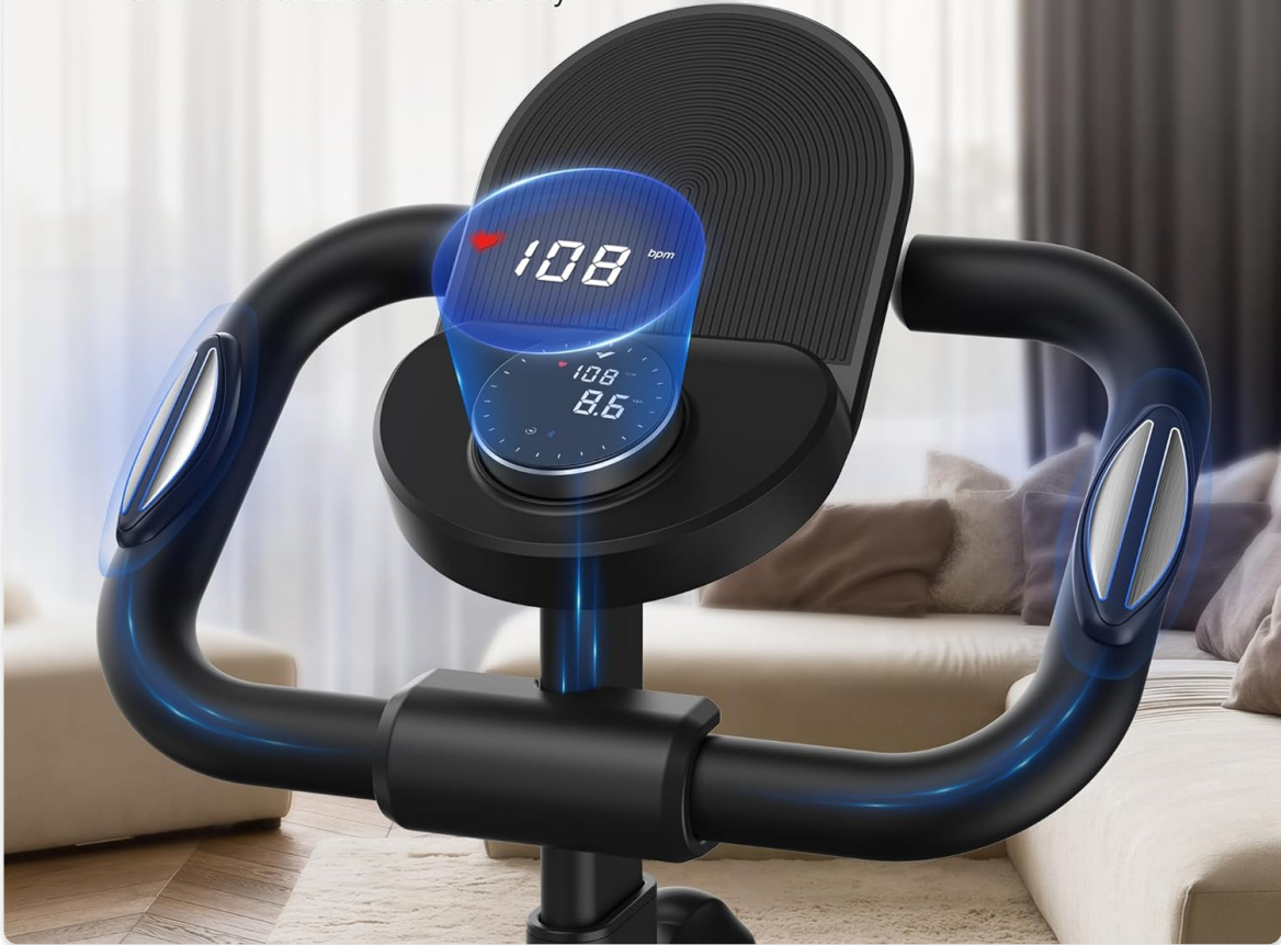
Figure 5.4: Heart rate monitoring feature of the MERACH E19, displaying real-time heart rate on the console. This helps users track their intensity and maintain a healthy exercise zone.

Detect Heart Rate in Real Time, Follow Up Heart Rate Changes and Control Exercise Intensity