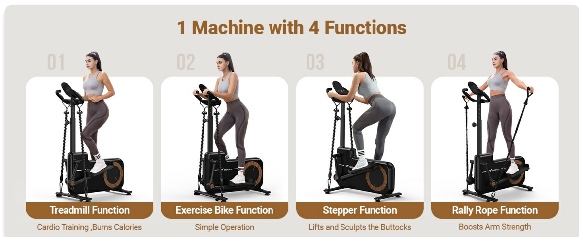
Figure 5.5: The MERACH E19 is a versatile machine offering four distinct exercise functions: Treadmill for cardio, Exercise Bike for simple operation, Stepper for glute sculpting, and Rally Rope for arm strength. The image illustrates

The MERACH E19 offers 4 functions in one machine: Treadmill, Exercise Bike, Stepper, and Rally Rope. This versatility allows for cardio training, calorie burning, simple operation, glute sculpting, and arm strength boosting.