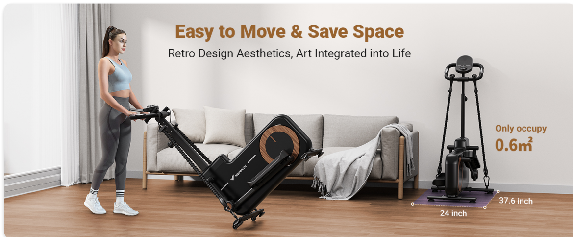
Figure 6.1: The MERACH E19 is designed to be easy to move and save space, making it convenient for home use. The image shows a woman effortlessly relocating the elliptical, emphasizing its portability and minimal footprint.