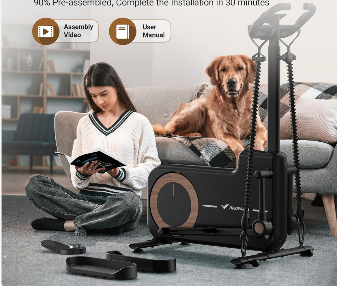
Figure 4.1: Easy assembly of the MERACH E19 elliptical machine. The image shows a woman sitting on the floor, reading a manual next to the partially assembled elliptical, with a dog resting nearby. This highlights the user-friendly design for quick setup.