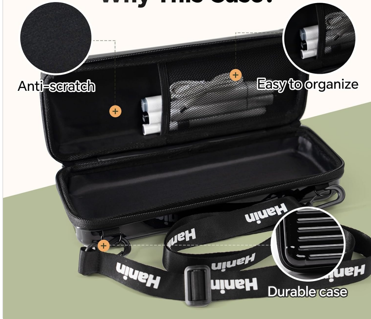
Image: A detailed view of the carrying case's interior, highlighting its anti-scratch lining, easy organization compartments, and durable construction.