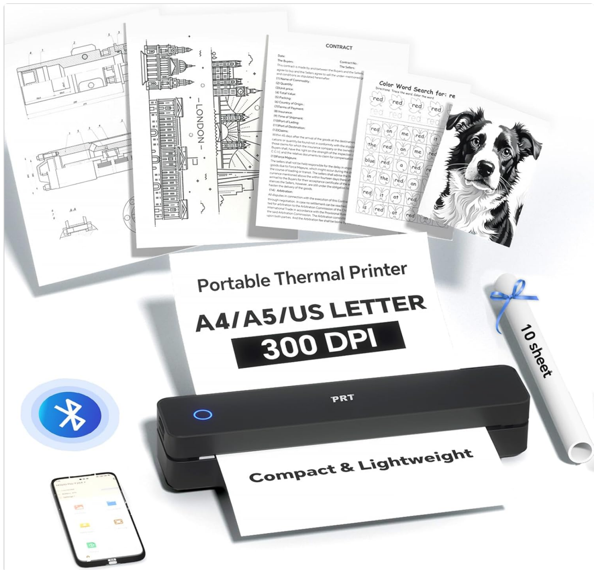
Image: The PRT MT610 Pro Thermal Printer shown with various documents it can print, including text, images, and forms. A roll of thermal paper and a carrying case are also visible, highlighting its versatility and portability.