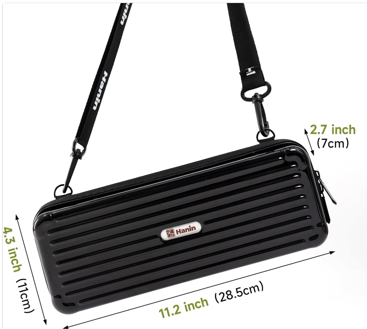
Image: The dimensions of the PRT MT610 Pro Thermal Printer carrying case are displayed, showing it measures 11.2 inches (28.5cm) in length, 4.3 inches (11cm) in width, and 2.7 inches (7cm) in height.