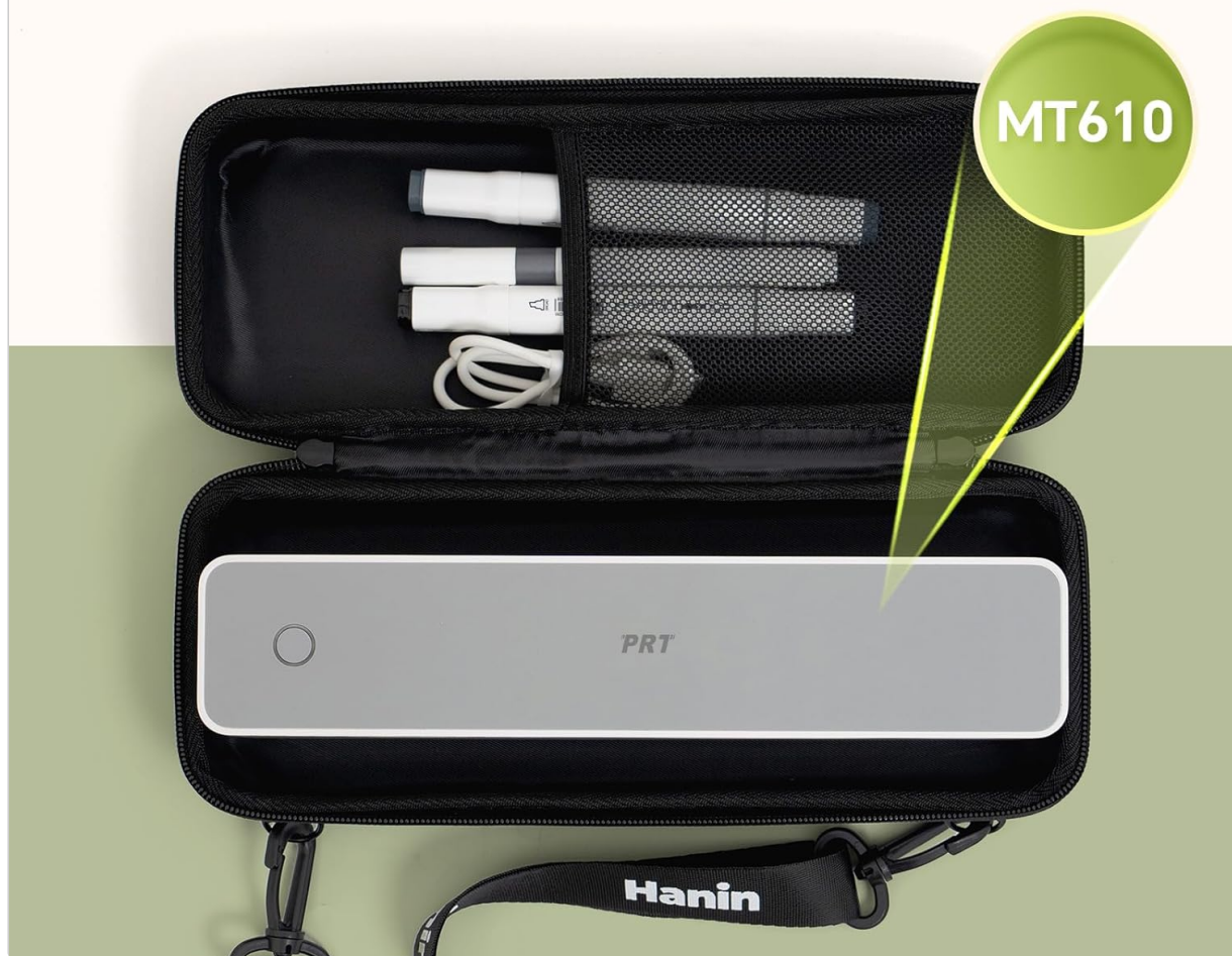
Image: The PRT MT610 Pro Thermal Printer neatly placed inside its custom-fit carrying case, alongside accessories like charging cables and extra paper rolls.