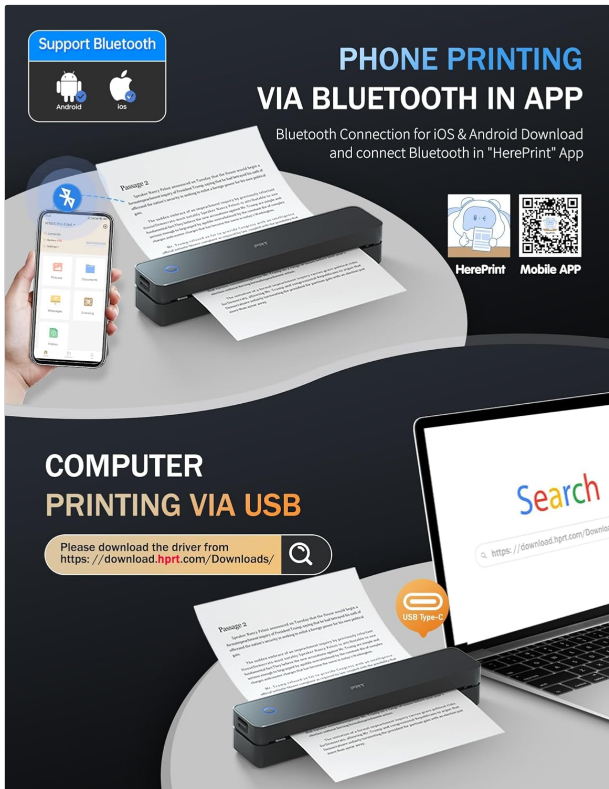
Image: The PRT MT610 Pro Thermal Printer is shown with illustrations of phone printing via Bluetooth (Android/iOS app) and computer printing via USB, along with QR codes for the HerePrint mobile app and driver downloads.