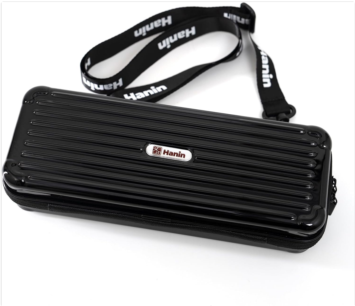
Image: A close-up of the sleek black carrying case for the PRT MT610 Pro Thermal Printer, featuring a textured exterior and a branded logo.