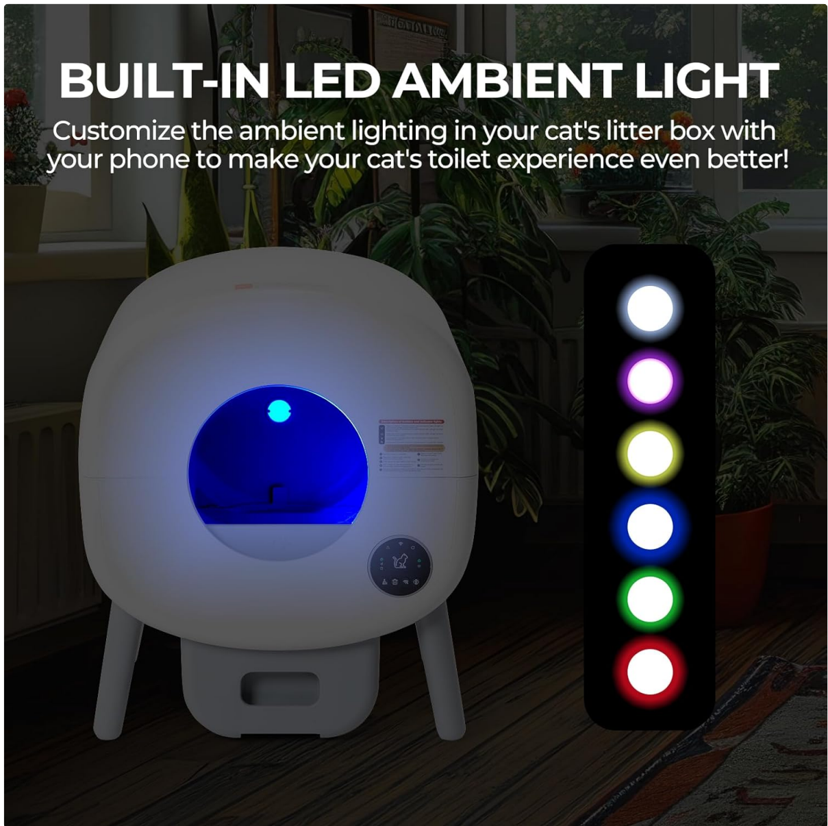
Figure 5.2: The litter box features adjustable colorful ambient lights for a calming atmosphere.

Customize the ambient lighting in your cat's litter box with your phone to make your cat's toilet experience even better!