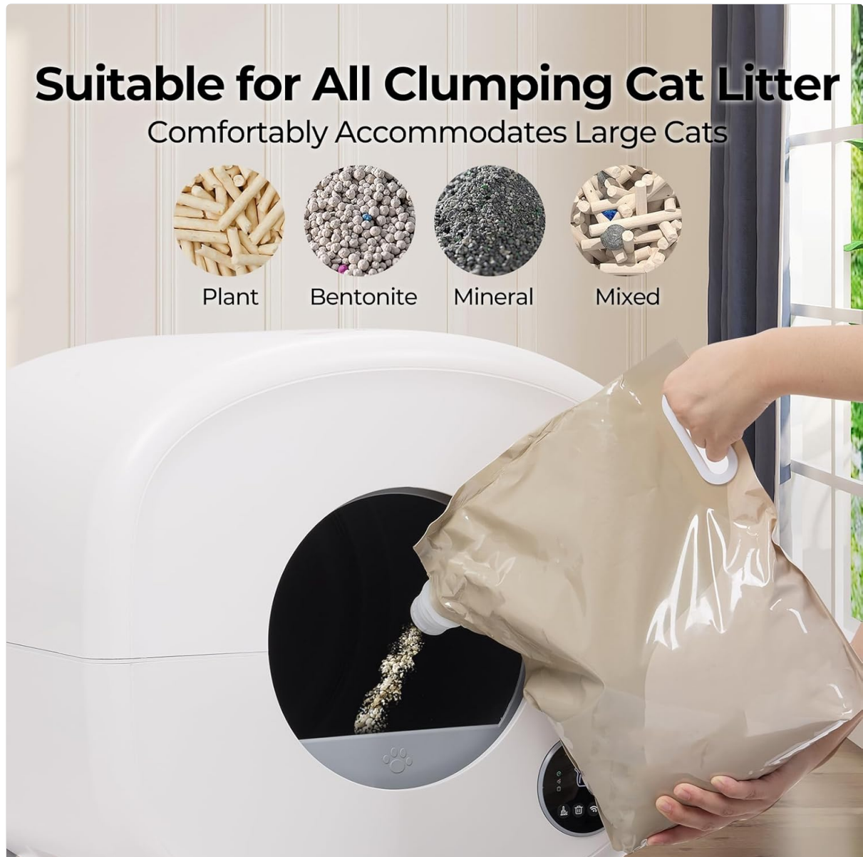
Figure 4.1: The litter box is compatible with most clumping litter types, excluding crystal litter.