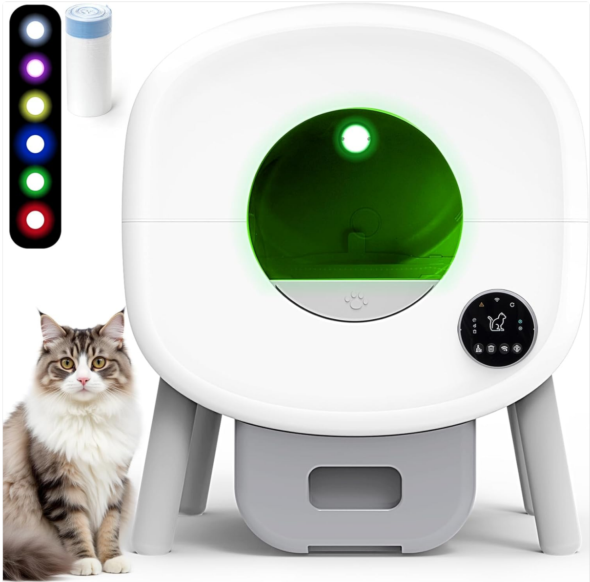
Figure 1.1: Fsitego Self-Cleaning Cat Litter Box, showcasing its sleek design and integrated control panel.