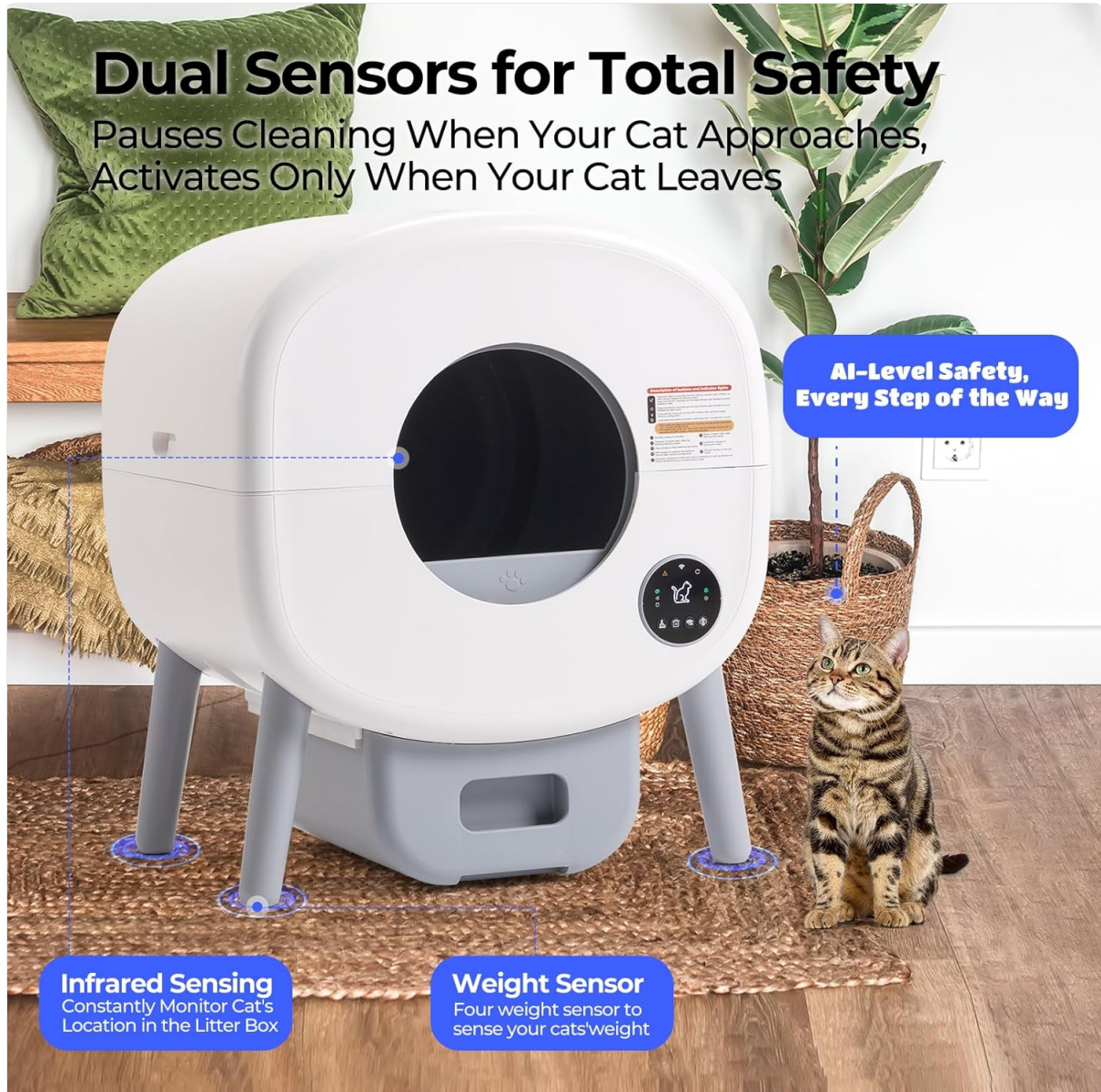
Figure 3.1: Illustration of the dual infrared and gravity sensors that pause cleaning when a cat is detected.