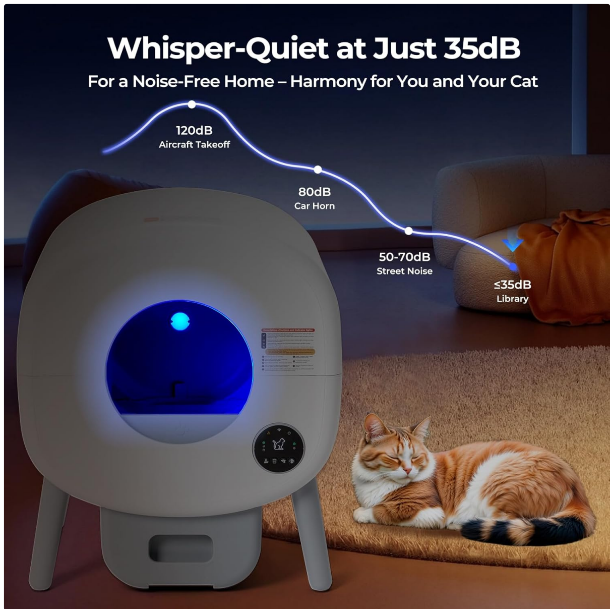
Figure 5.3: The Fsitego litter box operates at a quiet 35dB, ensuring a peaceful home environment.