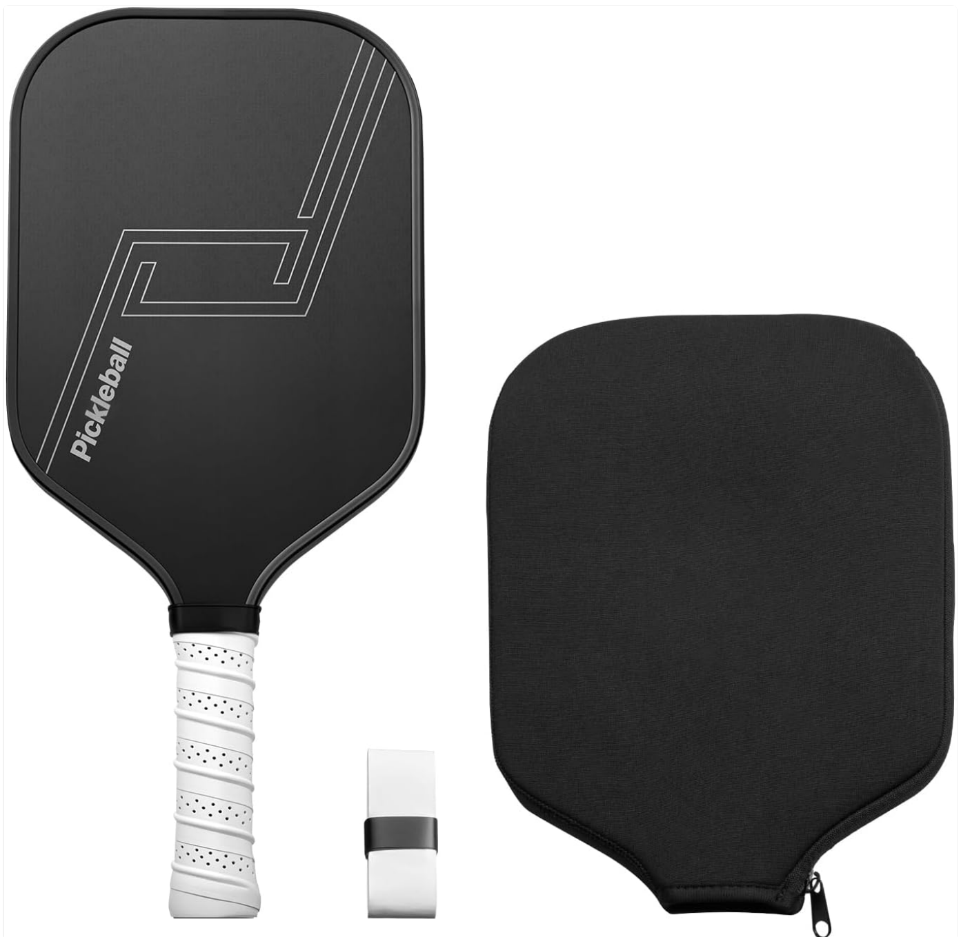
Image 1.1: VEVOR Pickleball Paddle, including the paddle, protective cover, and extra grip tape.