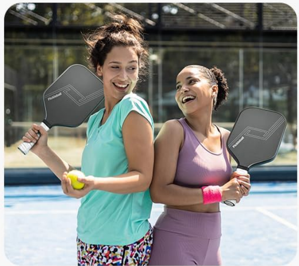
Community Open Spaces

Image 6.1: The VEVOR Pickleball Paddle is suitable for diverse playing environments.