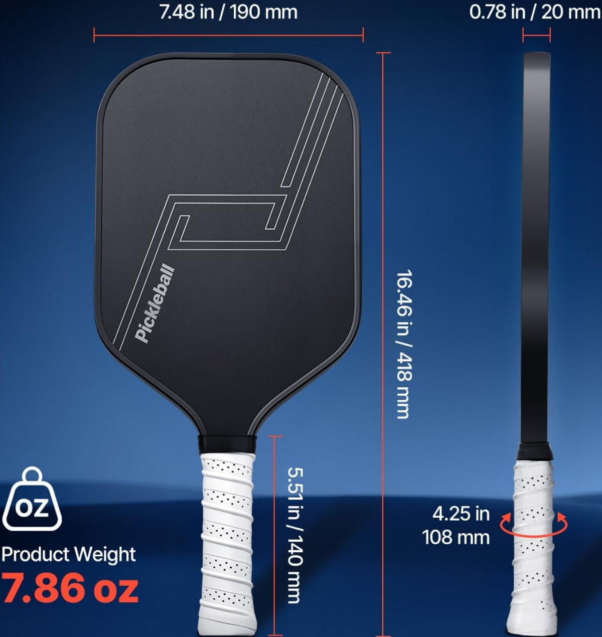
Image 3.1: Detailed dimensions and weight of the VEVOR Pickleball Paddle.