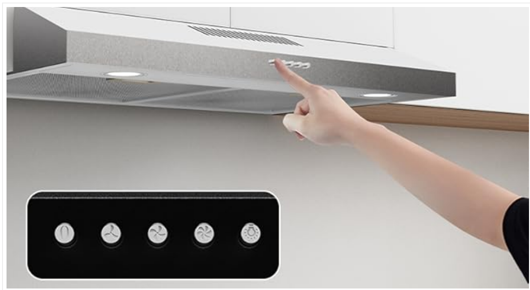
Image: A hand pressing one of the control buttons on the range hood, with an inset showing the five distinct button icons.