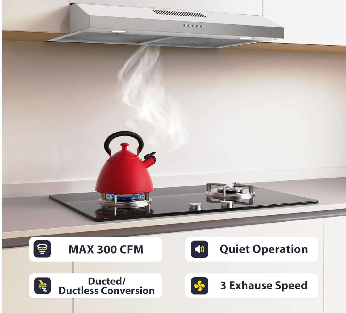
Image: The GRACEALL 30 Inch Under Cabinet Range Hood, Model JX3875S, in a kitchen setting.