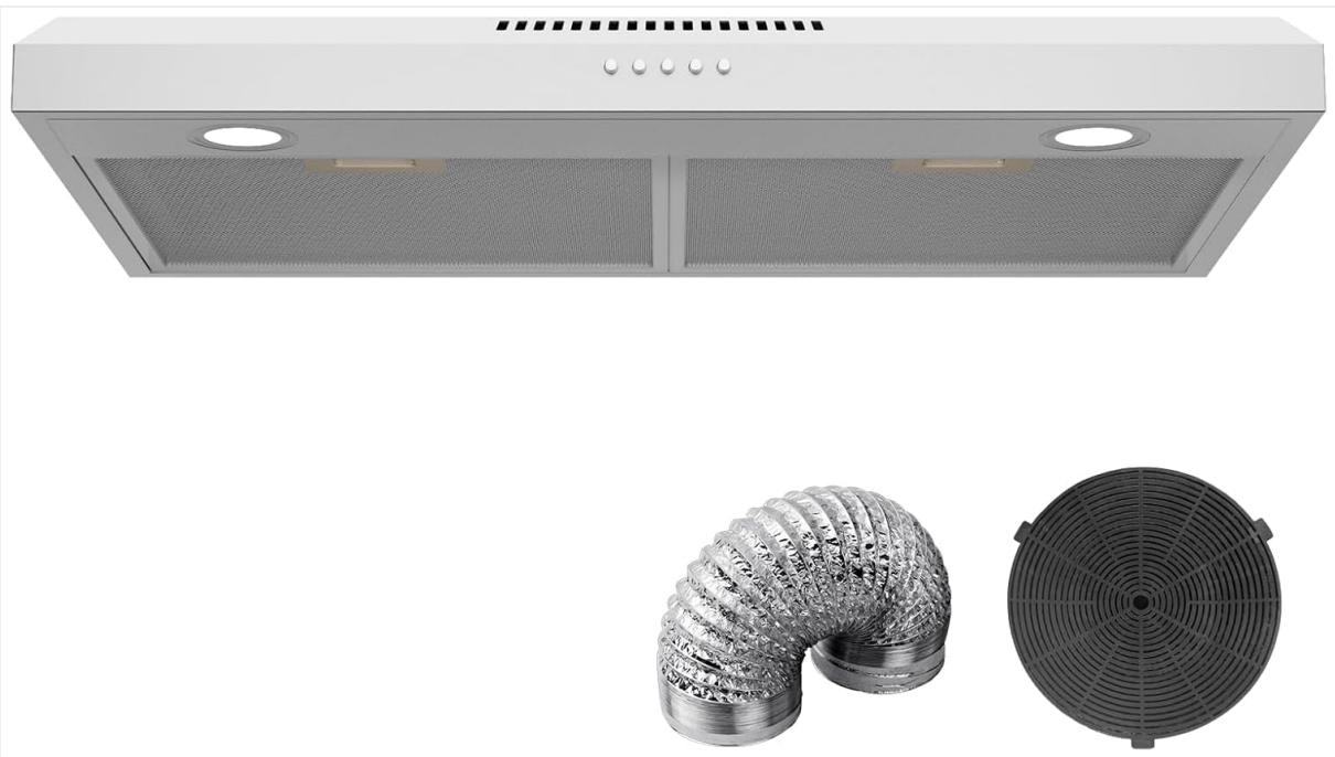
Image: The GRACEALL range hood, illustrating the internal charcoal filter used for ductless air recirculation.

If operating in ductless mode, the activated charcoal filter should be replaced approximately every 3 months, or more frequently depending on cooking habits. Refer to the product's official website or contact customer support for compatible replacement charcoal filters.