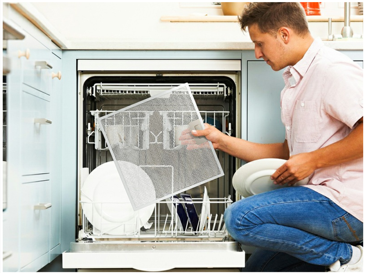
Image: A man placing a range hood filter into a dishwasher, demonstrating its dishwasher-safe feature.