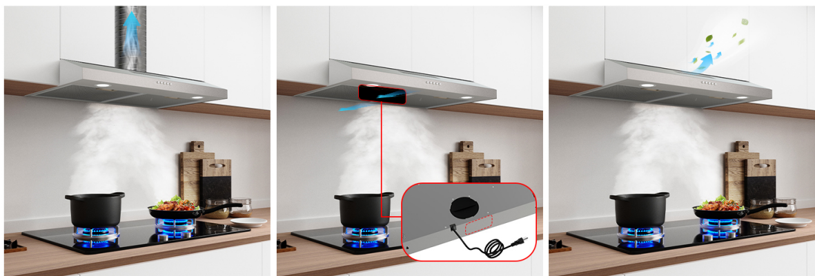
Top Venting Mode