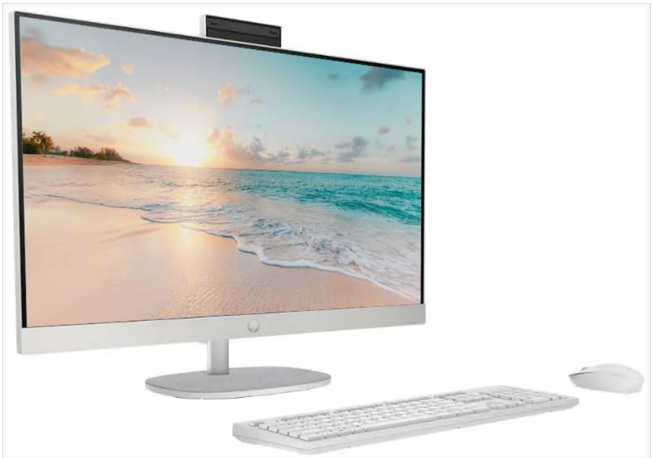
Image: A side view of the HP All-in-One computer, showcasing its slim design.