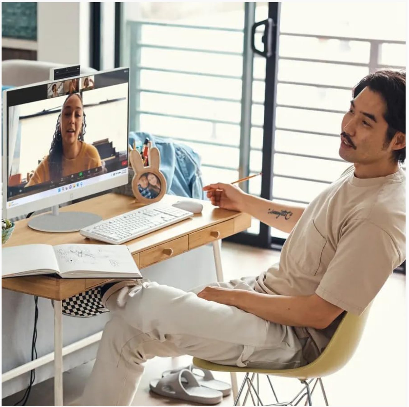
Image: A user engaged in a video call on the HP All-in-One computer, demonstrating its use in a home office setting.