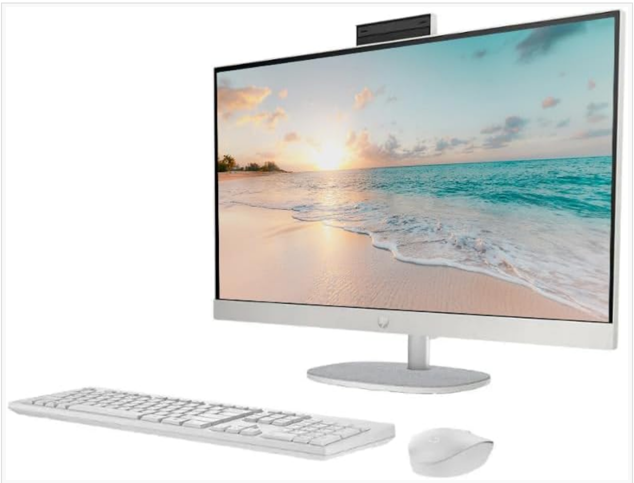
Image: The HP All-in-One computer with its wireless keyboard and mouse, ready for setup.