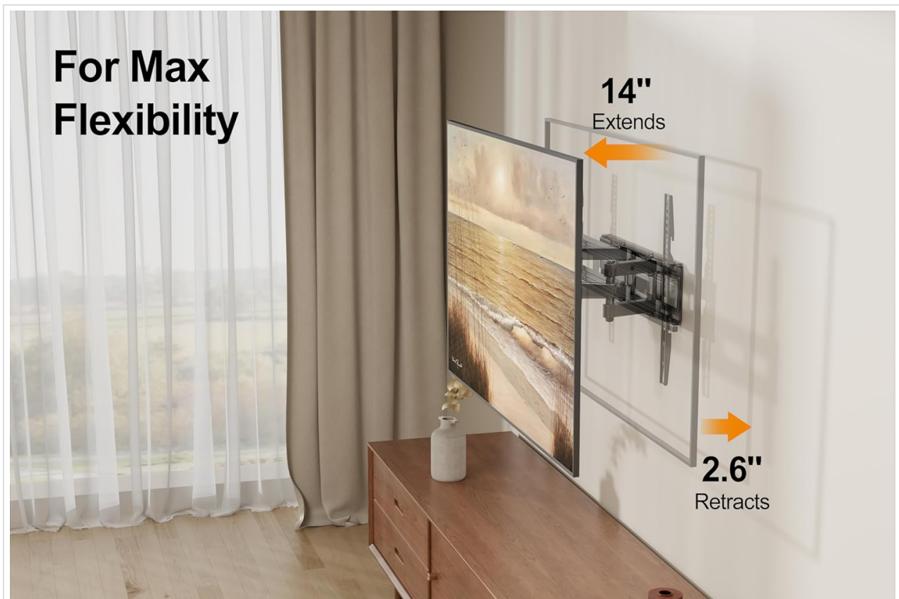
Figure 3: The TV mount extended from the wall, showcasing its maximum flexibility.