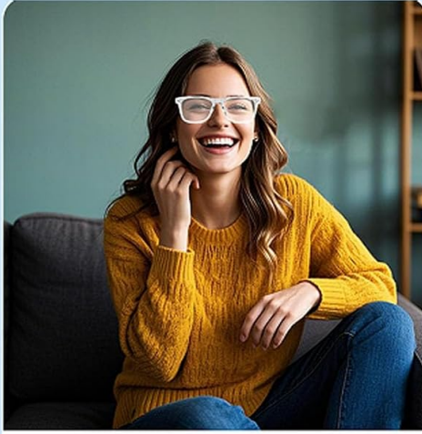
Listen to the music