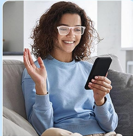
Communicate by telephone

The glasses are versatile for various activities including listening to music, office work, cycling, and phone communication.