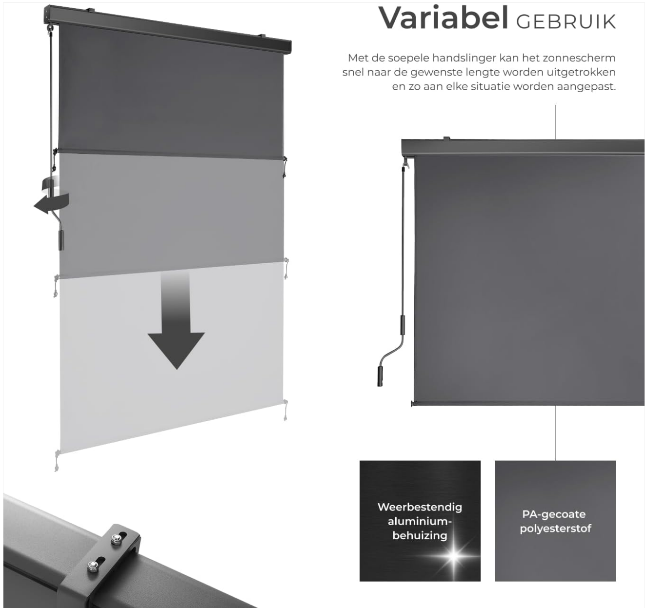
Figure 5: Variable use and crank mechanism.

Met de soepele handslinger kan het zonnescherm snel naar de gewenste lengte worden uitgetrokken en zo aan elke situatie worden aangepast.