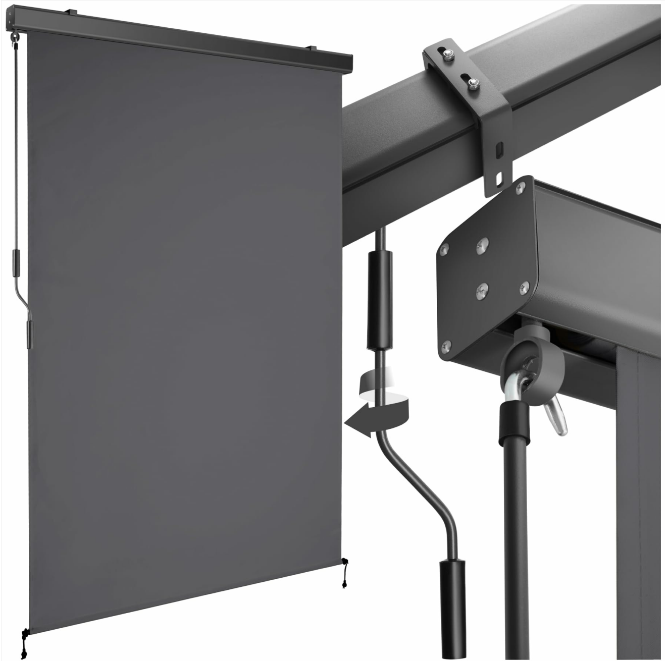
Figure 1: tectake Vertical Roller Blind, 120 x 250 cm, Black.

This vertical blind offers optimal protection against sun, wind, and unwanted views. Its individual length adjustment allows it to adapt to various situations, providing the exact amount of protection needed. The robust polyester fabric is water-repellent and offers UV protection of 50+. The crank drive system ensures easy operation, and the included mounting material allows for quick installation on walls or ceilings.