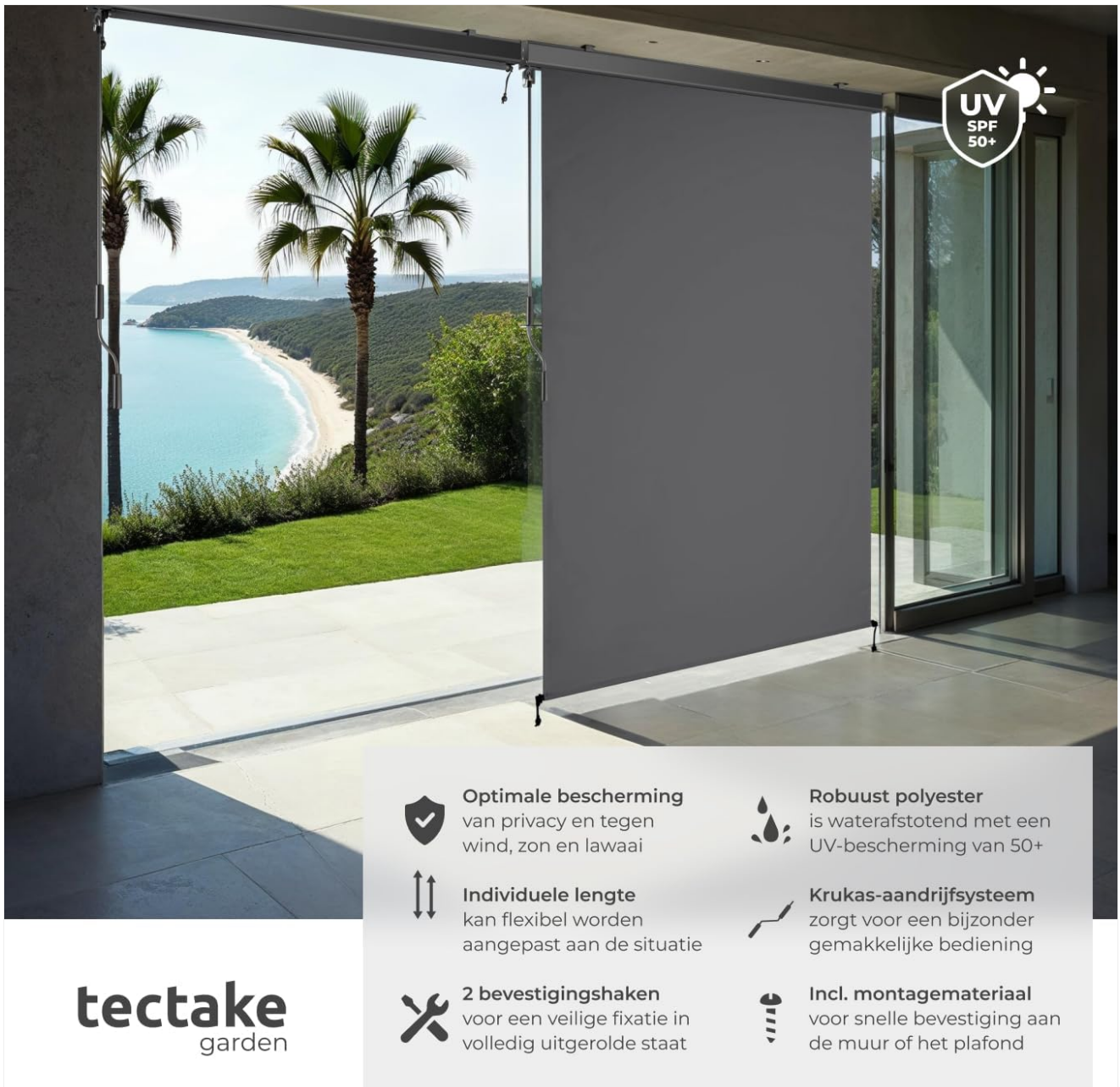
Figure 2: Key features of the tectake vertical roller blind.