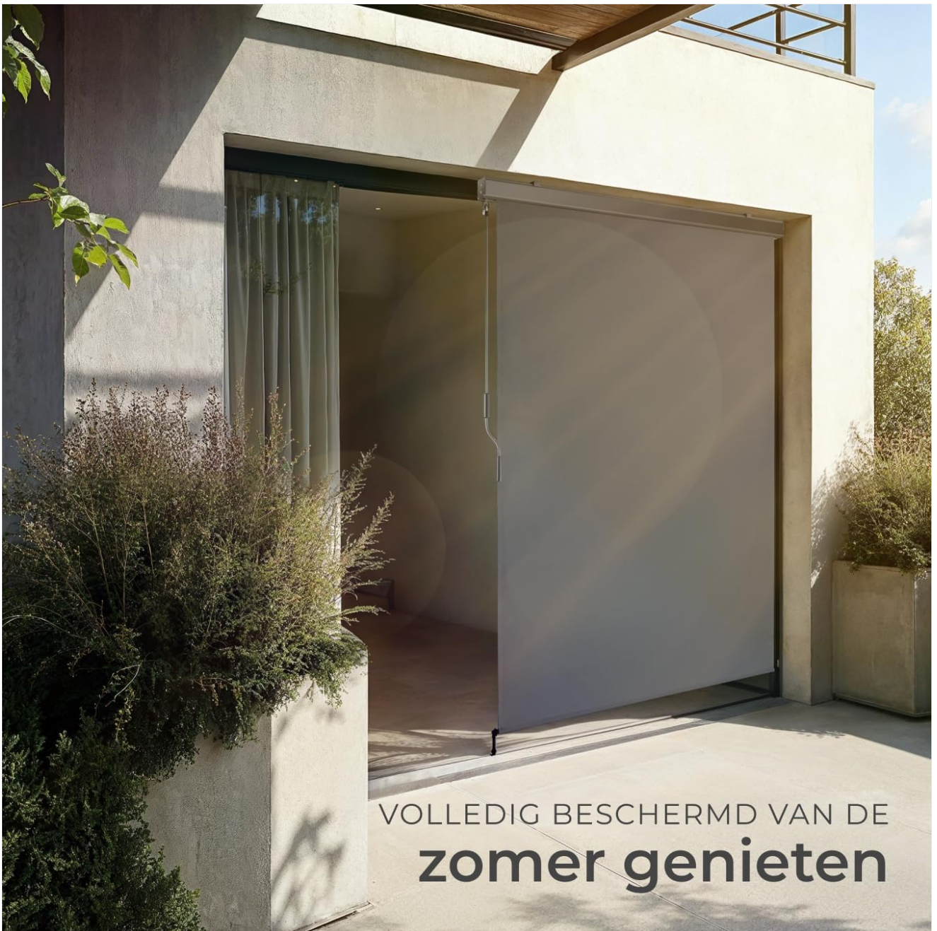
Figure 7: Enjoying a fully protected outdoor space.