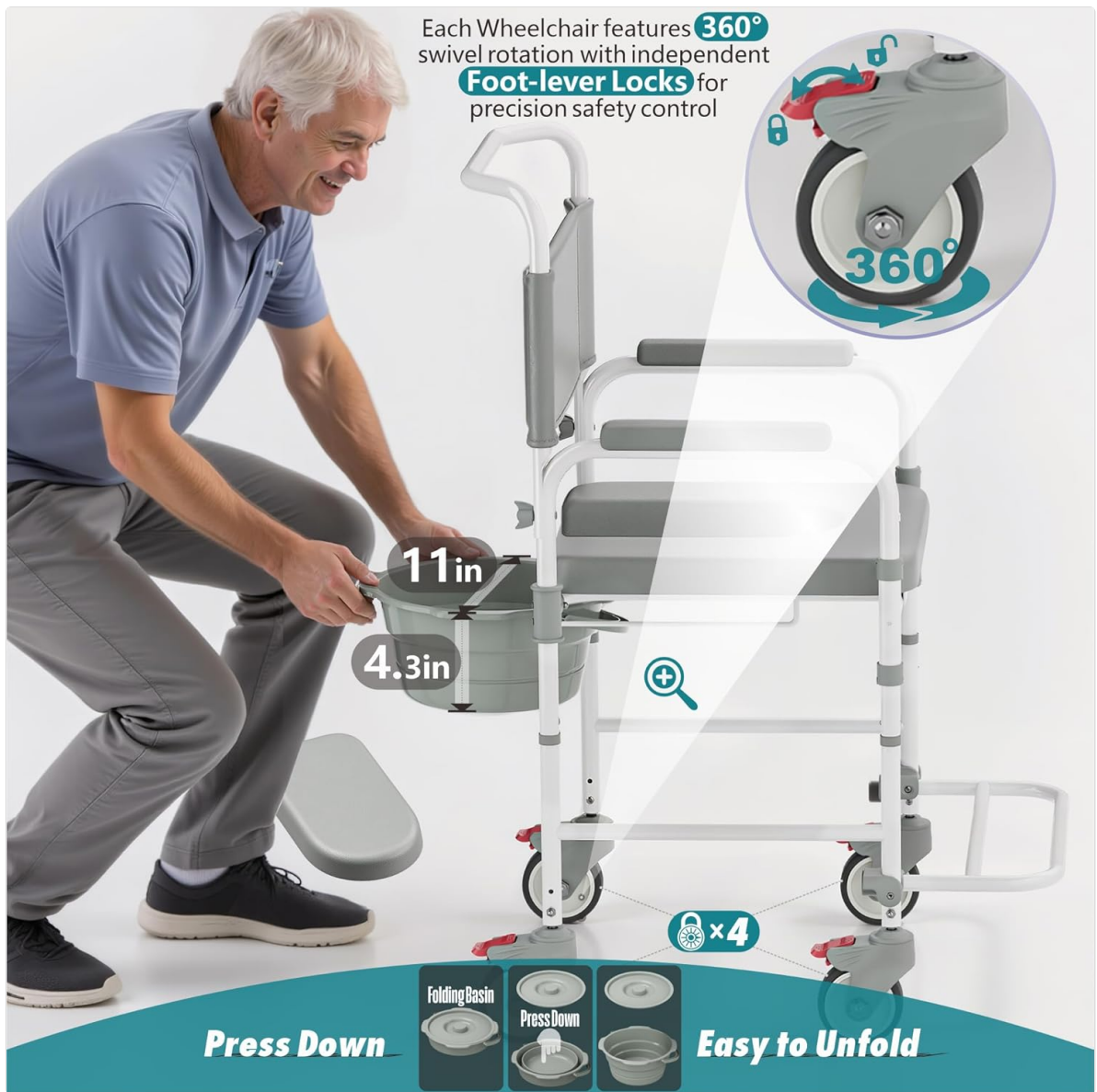
Image 5.2: The commode chair in Caregiver-Assisted Mode, showing a caregiver providing assistance.