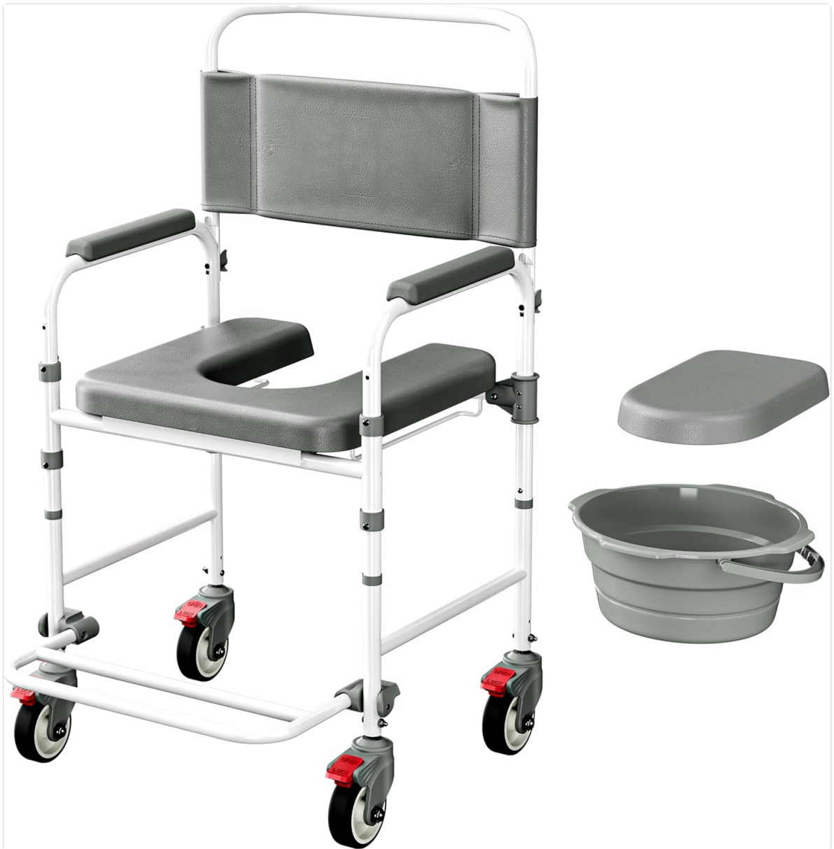
Image 1.1: The Littneo Bedside Commode with Wheels, Shower Wheelchair, shown with its commode bucket and seat cover.