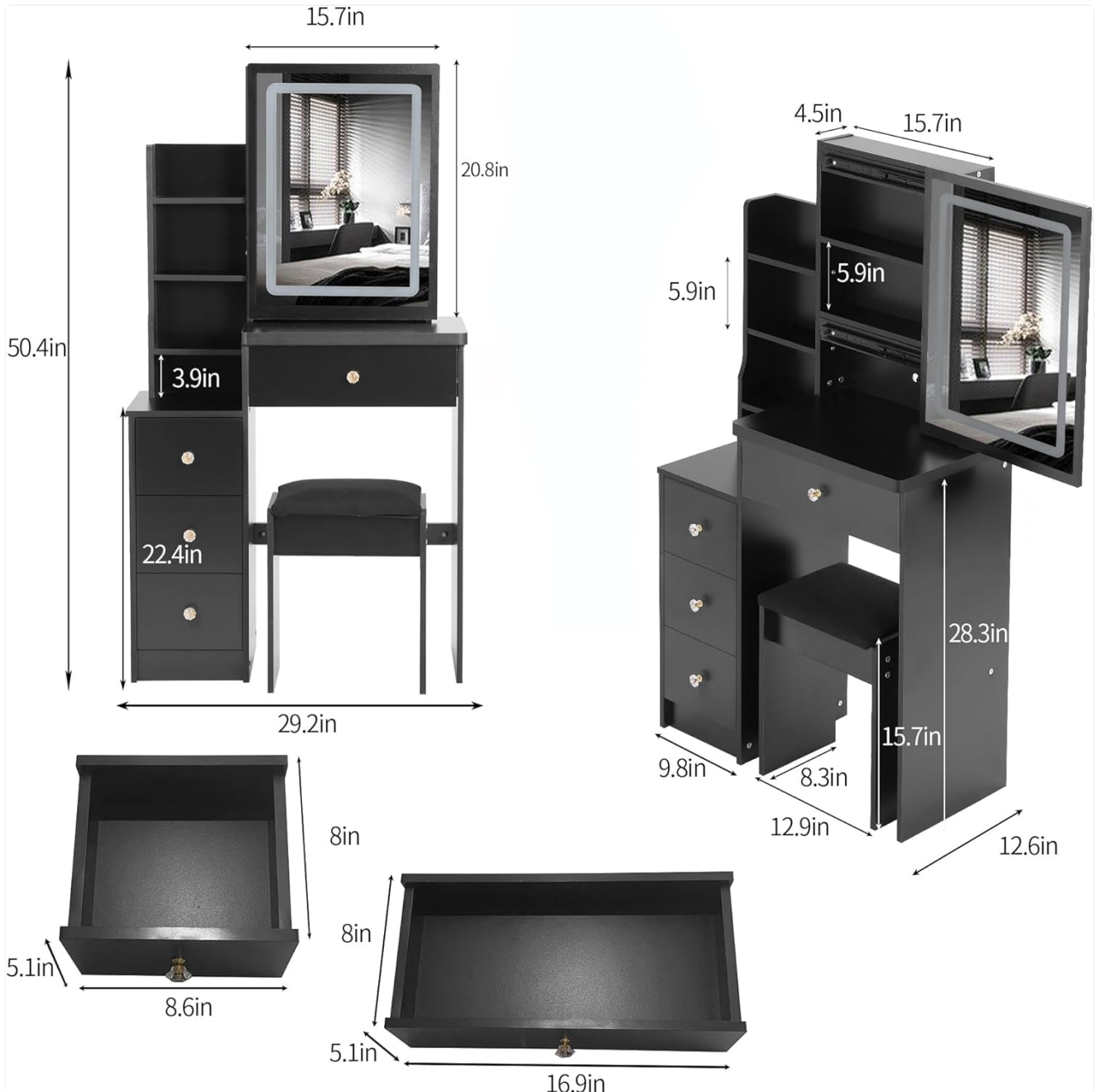
Figure 3.1: Dimensional diagram illustrating the main components and overall size of the vanity desk and stool.