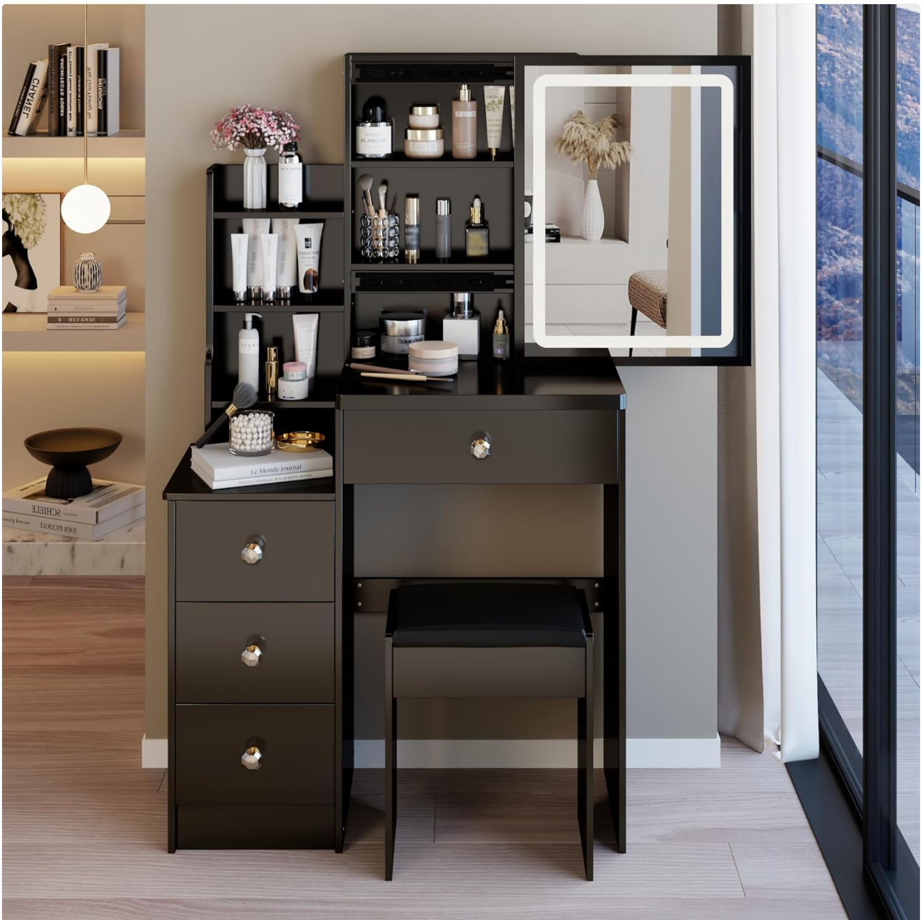
Figure 5.2: The mirror slides to the side, providing access to concealed storage shelves.