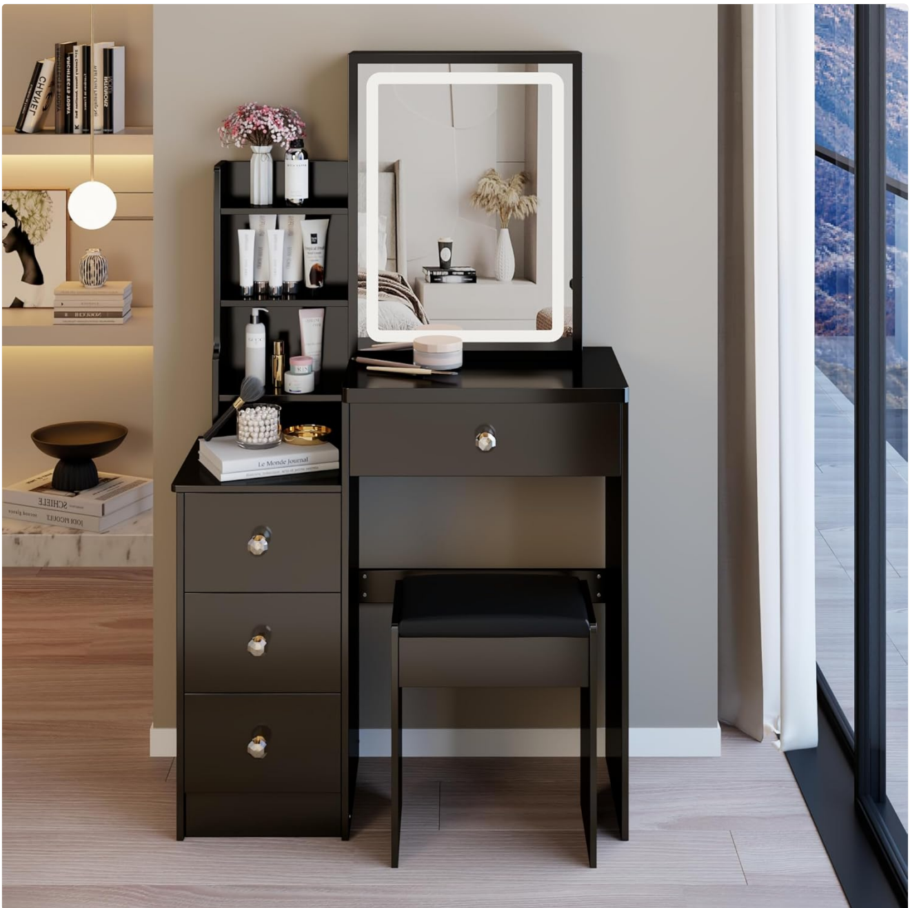
Figure 1.1: Fully assembled FammyLoft 29.2" Small Vanity Desk, showcasing its compact design and integrated mirror with lighting.