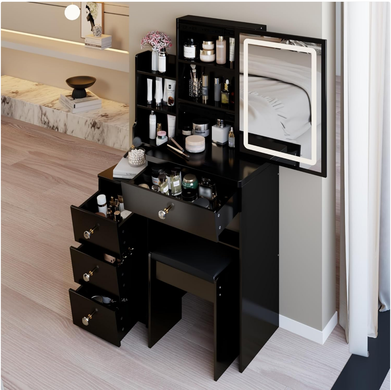
Figure 5.3: Drawers fully extended, demonstrating their capacity for organizing various items.