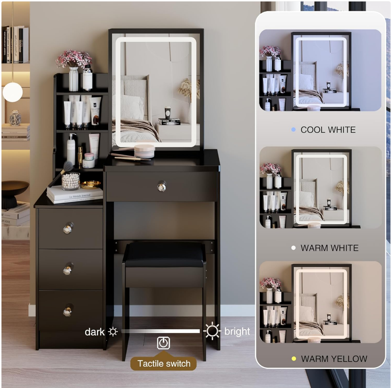
Figure 5.1: The LED mirror offers three distinct lighting colors and adjustable brightness via a tactile touch switch.