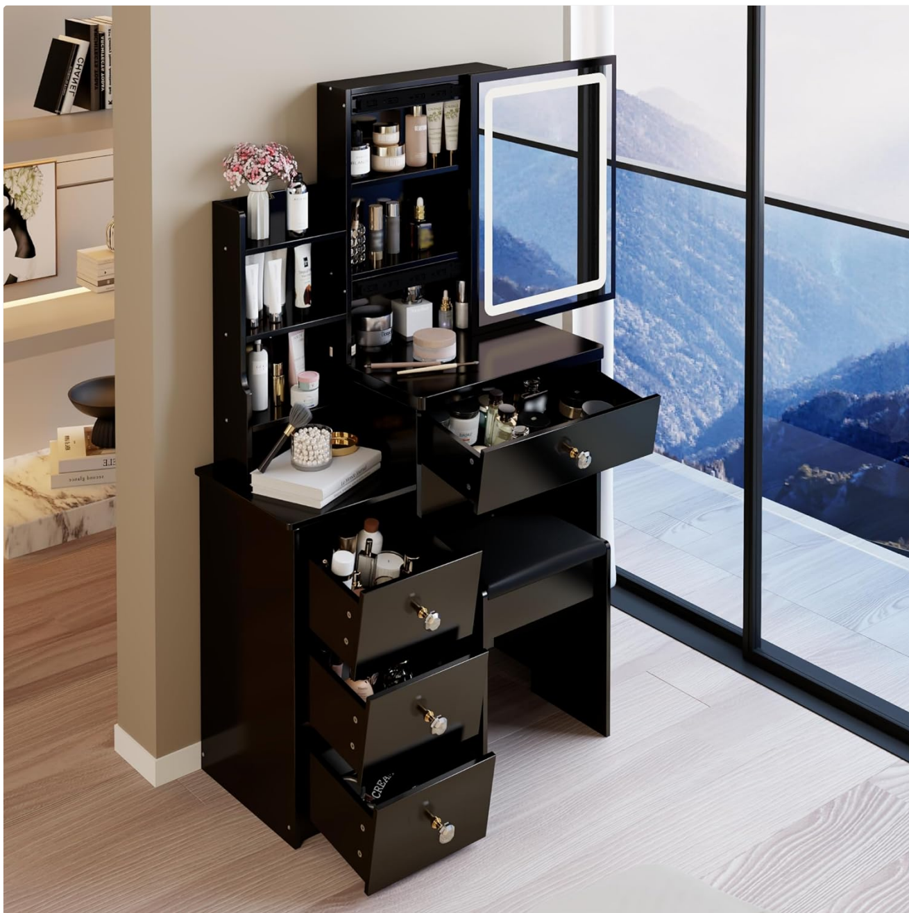
Figure 4.1: An overhead view demonstrating the internal structure and storage capabilities, which are assembled during setup.