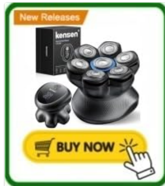
Image: All components of the Kensen 14-in-1 Professional Grooming Kit, including the main unit, various trimmer heads, guide combs, and accessories.