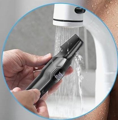
Image: A man using the Kensen trimmer in a shower setting, illustrating its IPX7 waterproof capability for safe wet use and easy cleaning.

No damage even when used directly in the shower