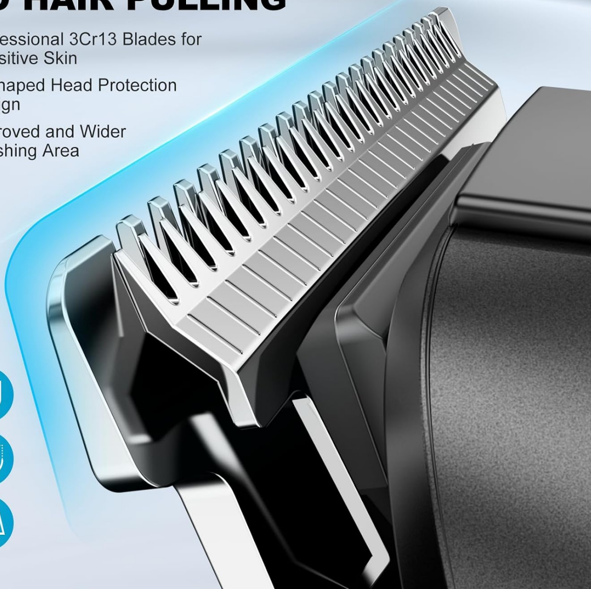
Image: Detail of the Kensen trimmer's precision 3Cr13 stainless steel blades with R-shaped head protection design, engineered for skin-friendly and precise trimming without pulling hair.