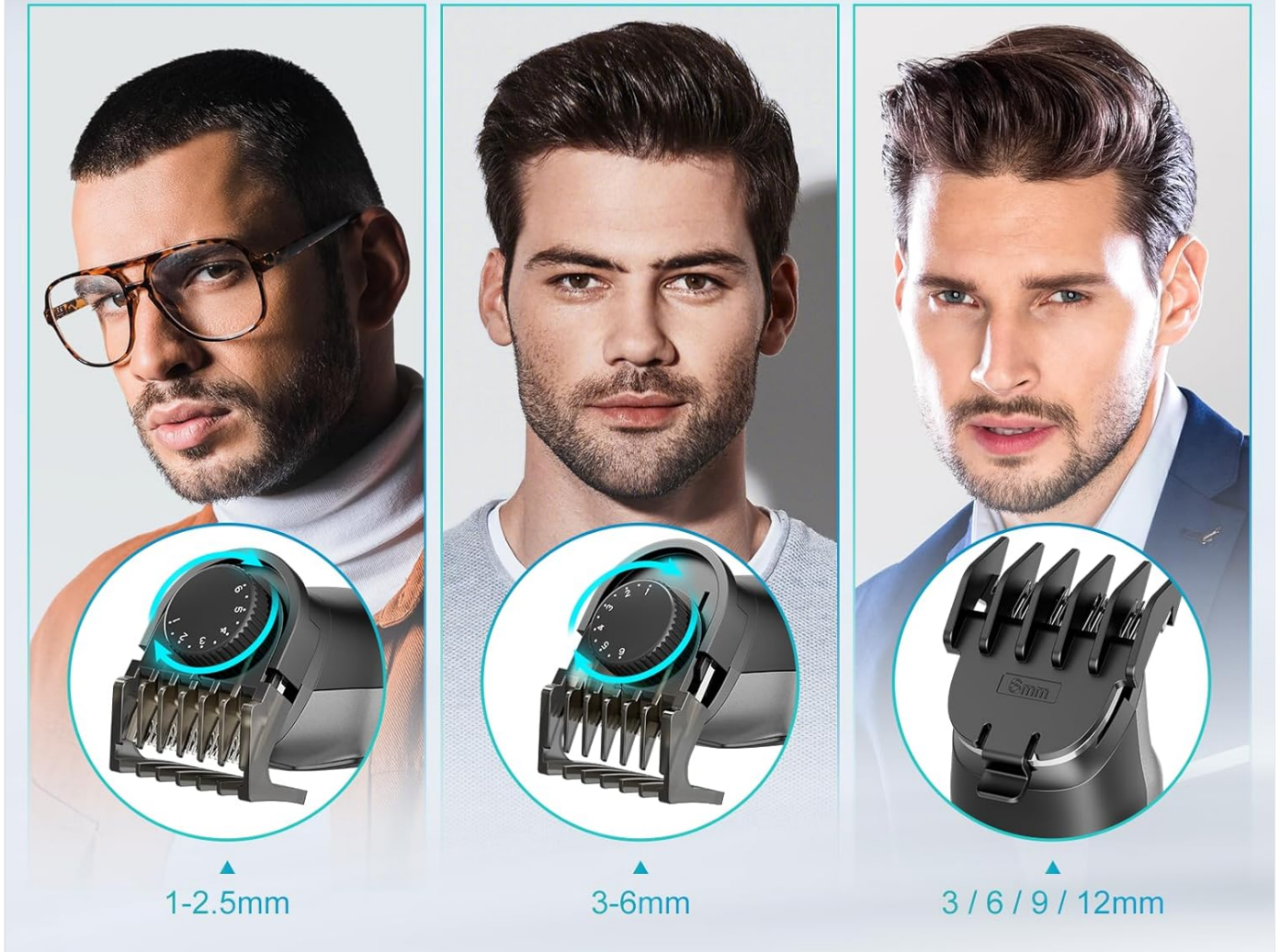
Image: Visual guide demonstrating how to achieve precise cutting lengths using the adjustable comb for beard trimming (1-2.5mm, 3-6mm) and fixed guide combs (3/6/9/12mm) for hair clipping with the Kensen grooming kit.

Create the Various Hairstyles You Desire