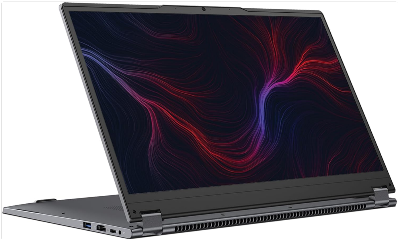
Figure 2.1: Front View of Laptop

Before first use, it is recommended to fully charge the laptop battery. Connect the power adapter to the charging port on the side of the laptop and then plug it into a power outlet. The charging indicator light will illuminate.