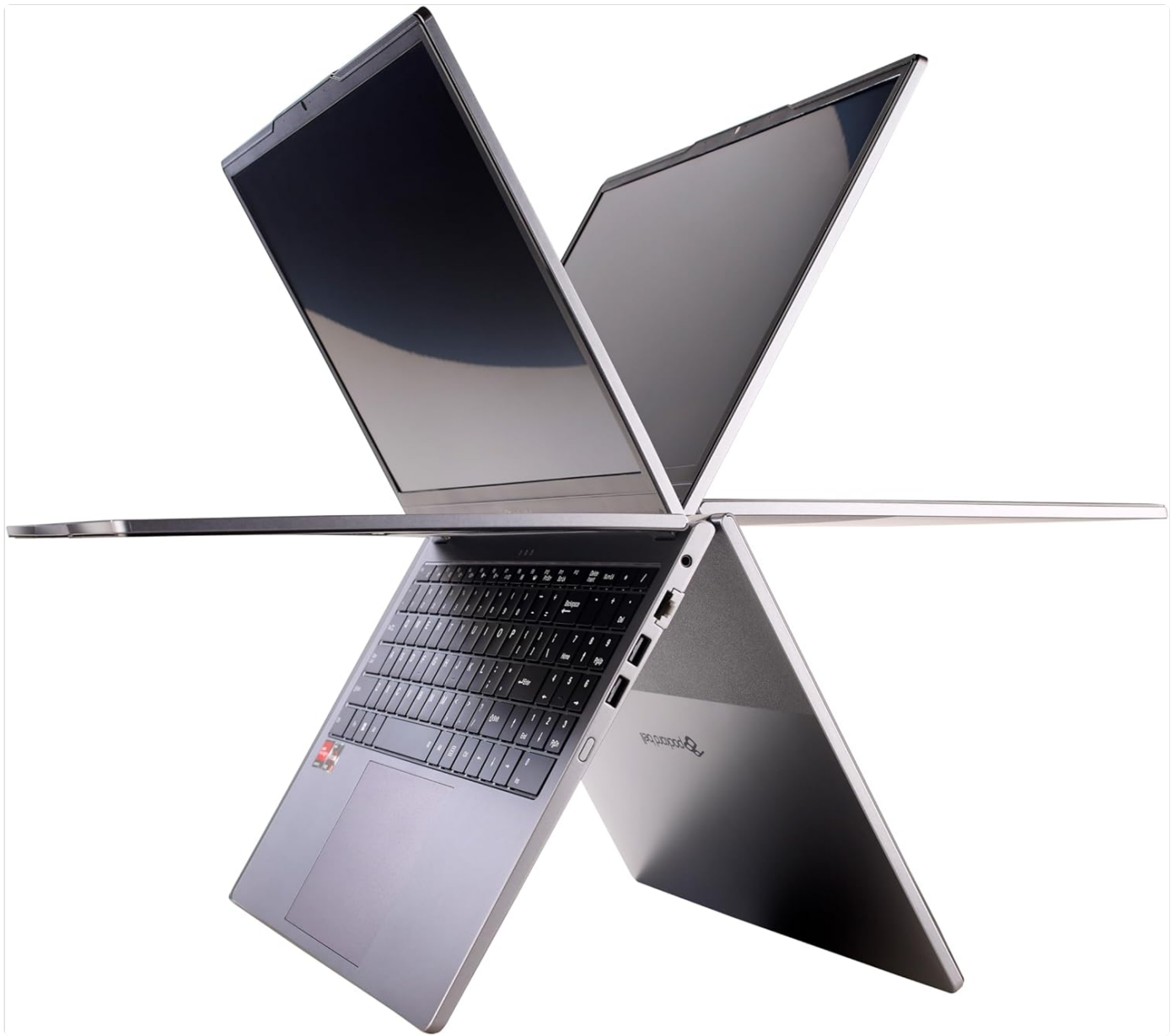
Figure 3.1: 360-Degree Flexibility

This image illustrates the Packard Bell Carrera F3 Flex laptop's 360-degree hinge capability, showing the device in multiple positions: a standard laptop, a tent-like configuration, and a fully folded tablet mode, highlighting its versatility.