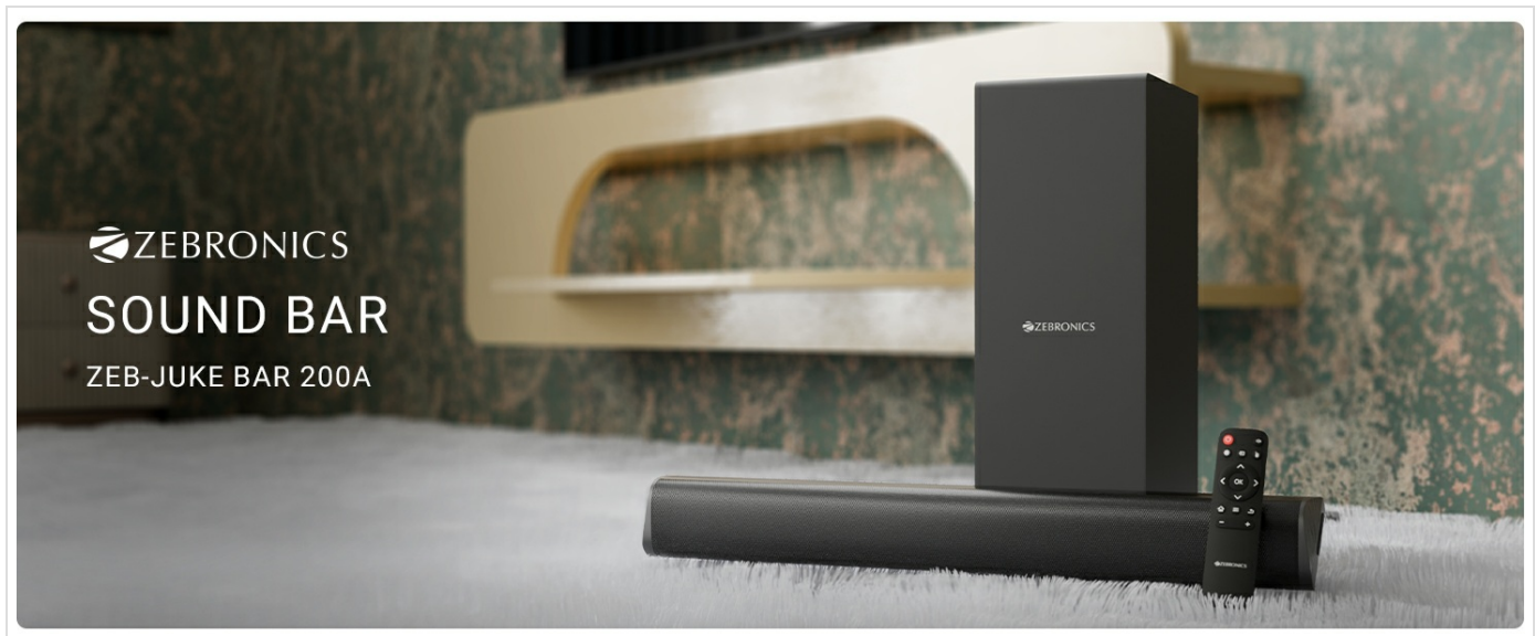
Figure 3.1: ZEBRONICS Juke BAR 200A Soundbar, Subwoofer, and Remote Control. This image displays the complete sound system, including the main soundbar unit, the separate subwoofer, and the remote control, providing a visual representation of all primary components.