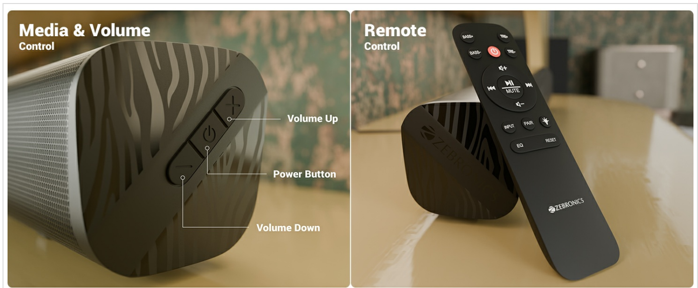
Figure 3.2: Soundbar Media and Volume Controls and Remote Control. This image highlights the physical control buttons on the soundbar for power, volume up, and volume down, alongside a detailed view of the included remote control, illustrating all available buttons for comprehensive audio management.