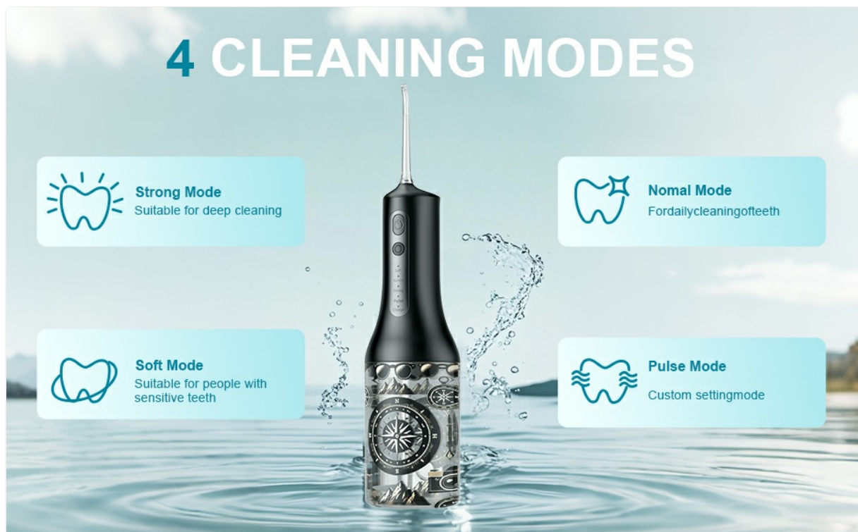
Figure 5: Overview of the 4 Cleaning Modes.