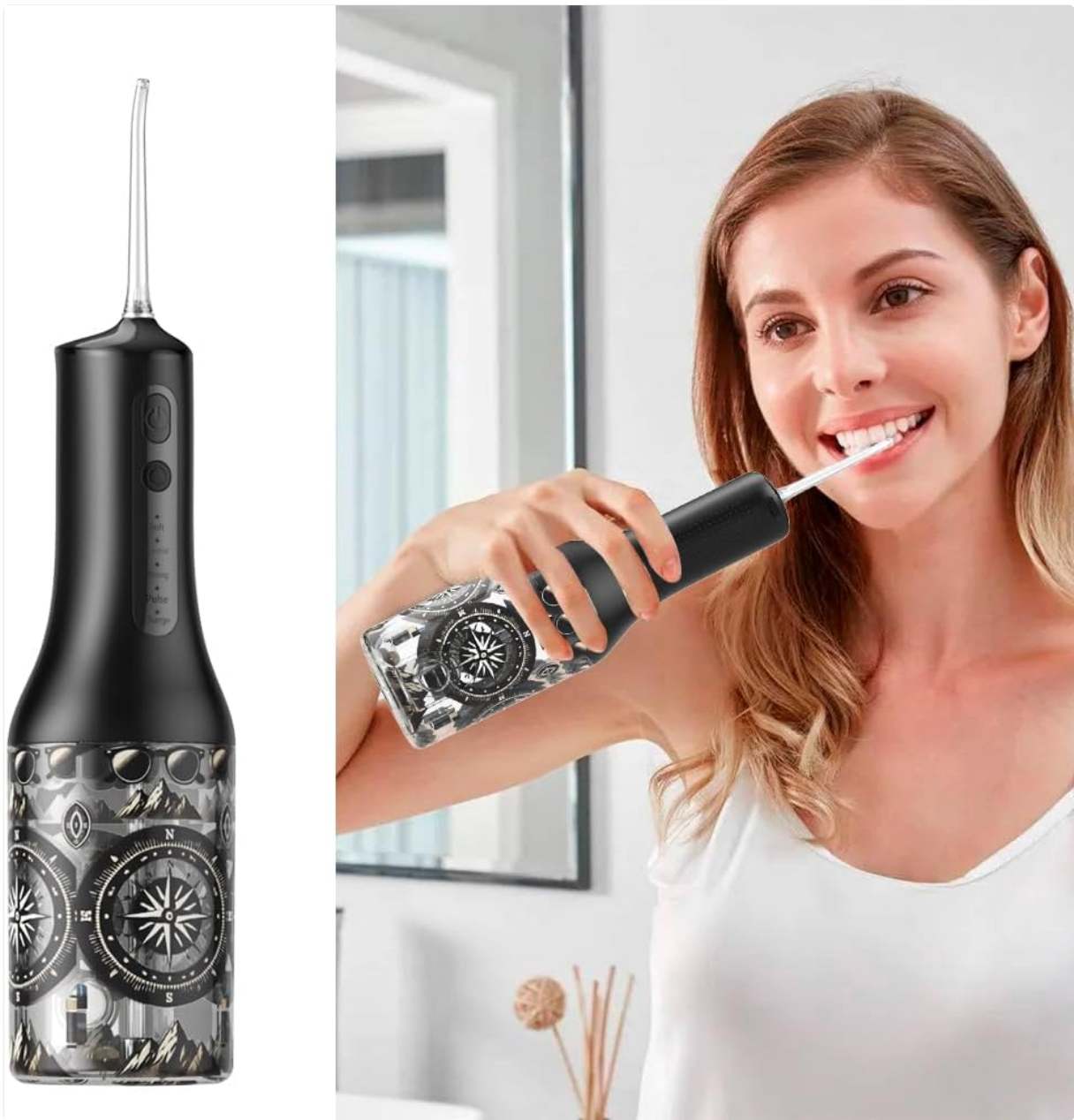
Figure 8: Proper usage of the water flosser.