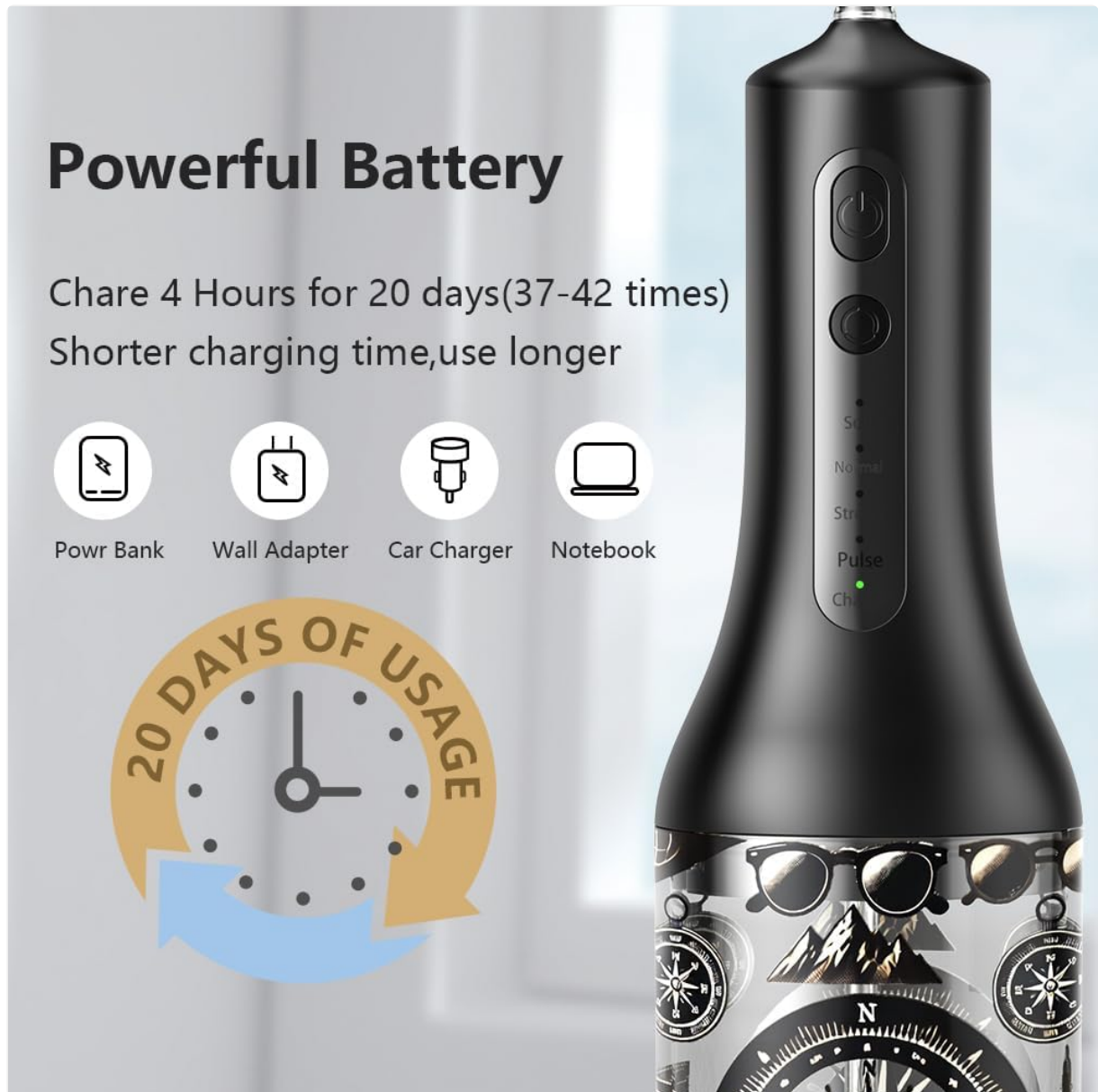
Figure 1: Charging the SARMOCARE Water Dental Flosser.