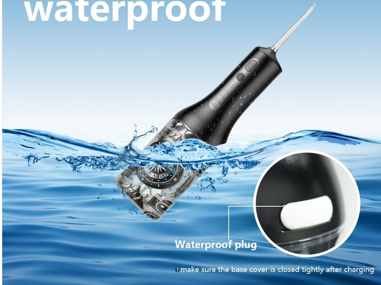
Figure 9: IPX7 Waterproof feature and waterproof plug.