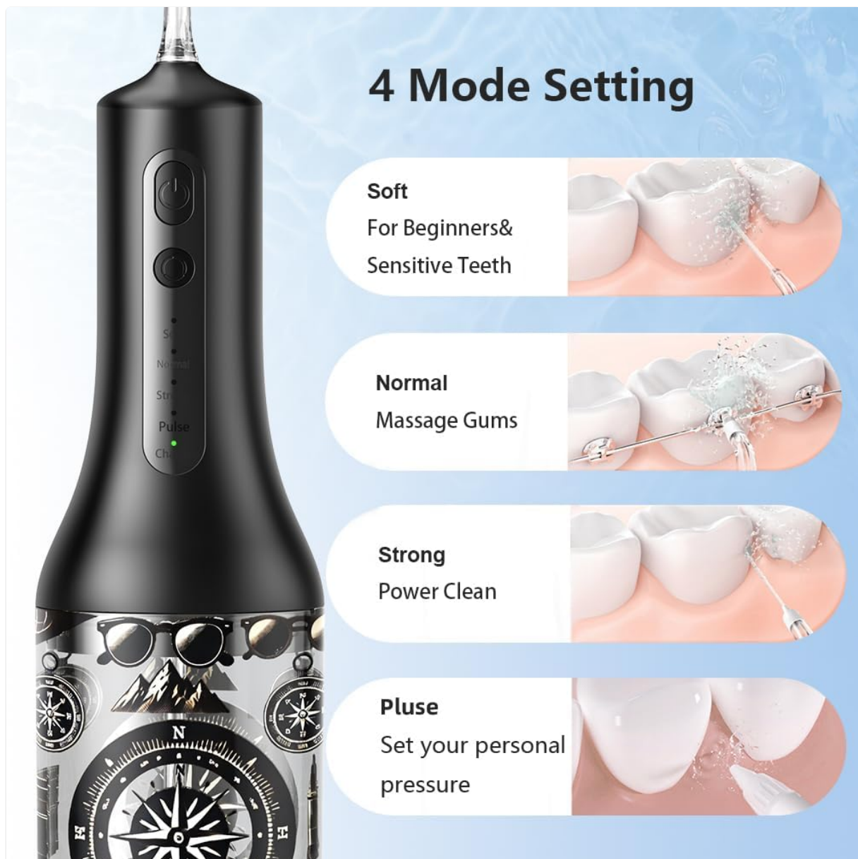
Figure 4: 4 Mode Settings for the Water Flosser.