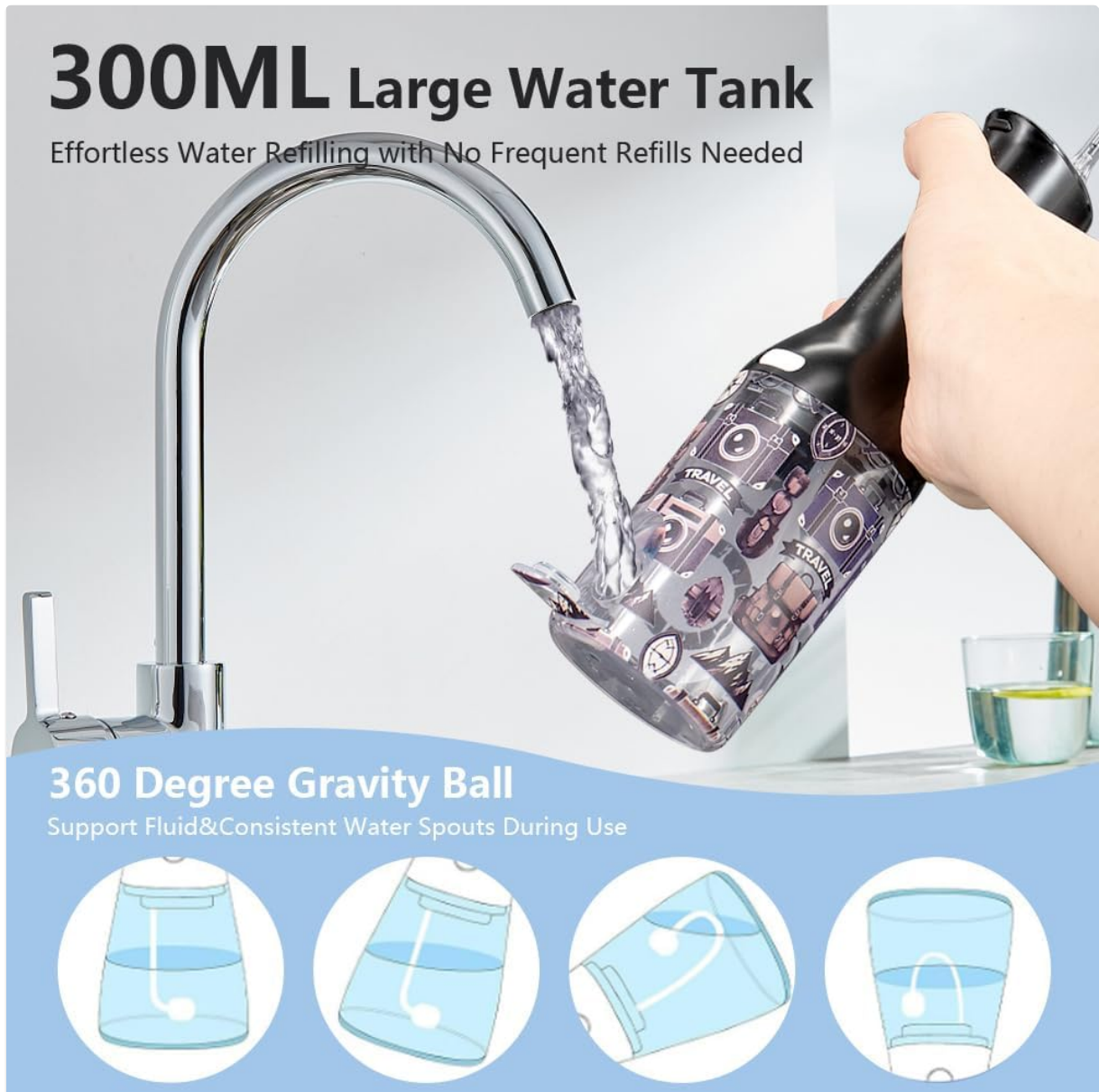
Figure 3: Filling the 300ML water tank.

Ensure the tank is securely attached to prevent leaks. The open visual tank design allows for easy monitoring of water levels.