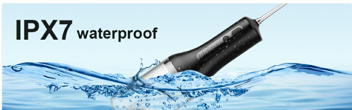
Figure 10: IPX7 Waterproof design for easy cleaning.