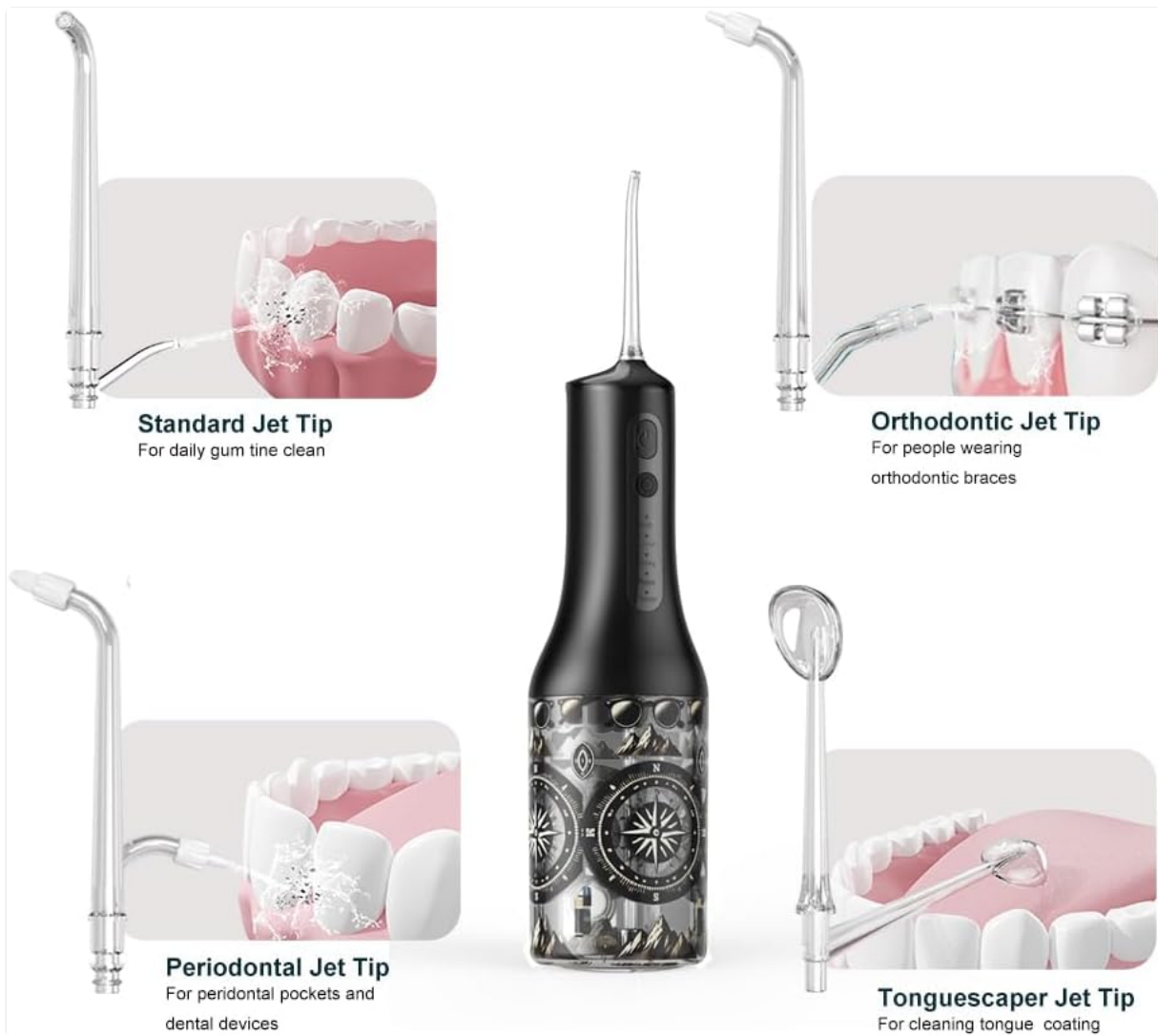
Figure 6: Specialized Jet Tips and their applications.