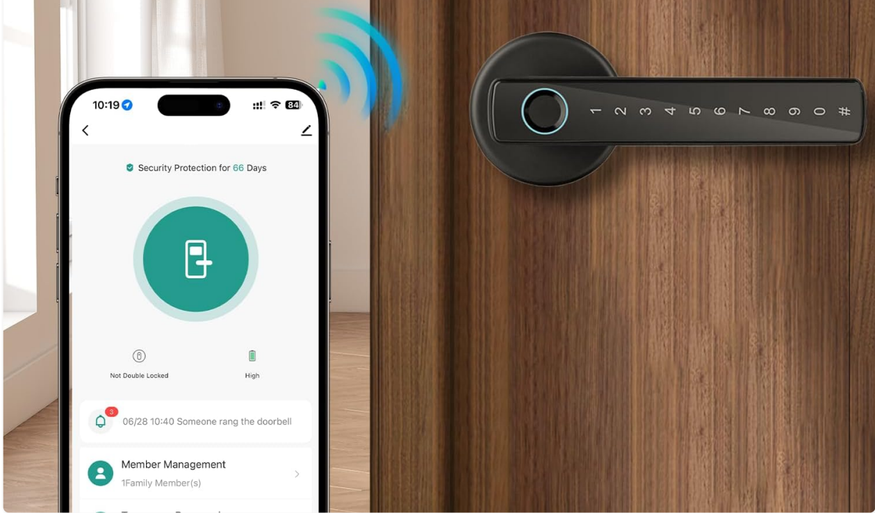
Image 5: A smartphone displaying the TUYA app interface, demonstrating control features for the Makayuron CS09 Smart Door Lock.