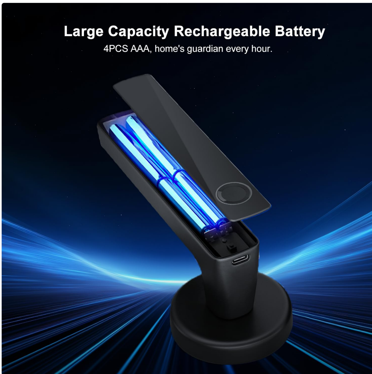
Image 2: The battery compartment of the Makayuron CS09 Smart Door Lock, illustrating the placement of 4 AAA batteries.