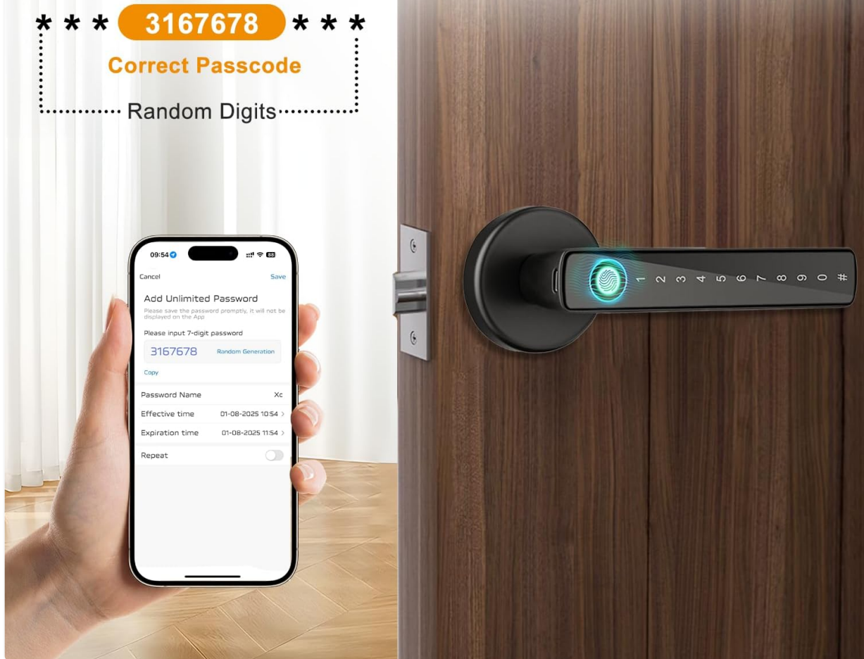
Image 4: The Makayuron CS09 Smart Door Lock illustrating the anti-peeping passcode feature, where random digits can be entered around the correct code.

The correct sequence in the center can unlock the door The password cannot exceed 16 digits