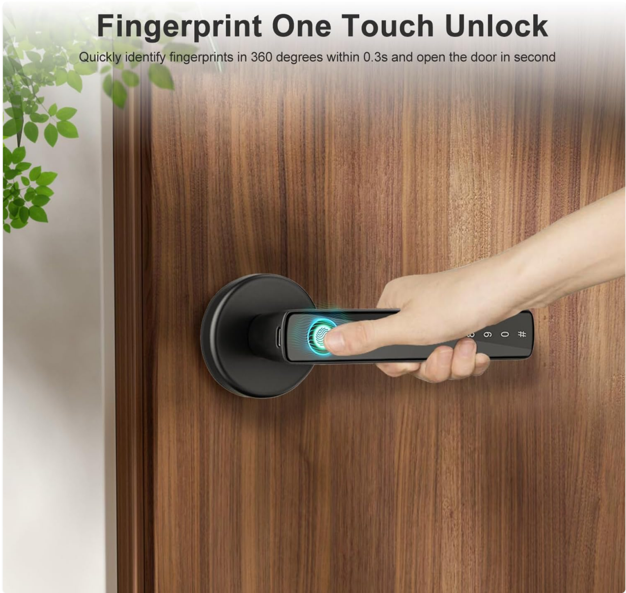
Image 3: A hand demonstrating fingerprint unlock on the Makayuron CS09 Smart Door Lock.

Quickly identify fingerprints in 360 degrees within 0.3s and open the door in second