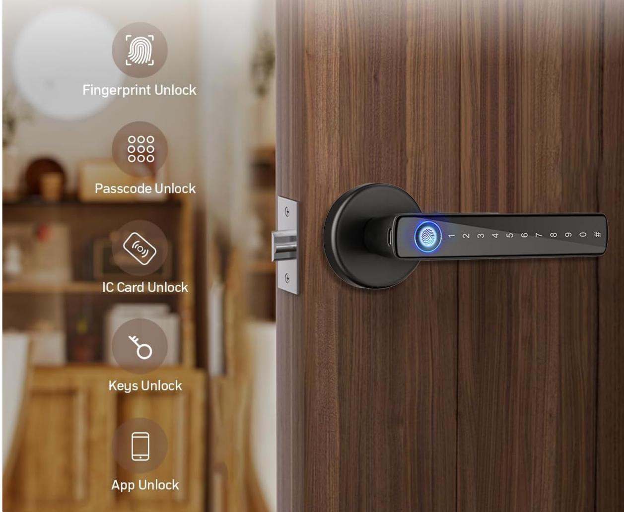
Image 1: The Makayuron CS09 Smart Door Lock highlighting its five unlocking methods: Fingerprint, Passcode, IC Card, Keys, and App Unlock.

Smart life, multiple unlocking methods, say goodbye to the anxiety of losing keys