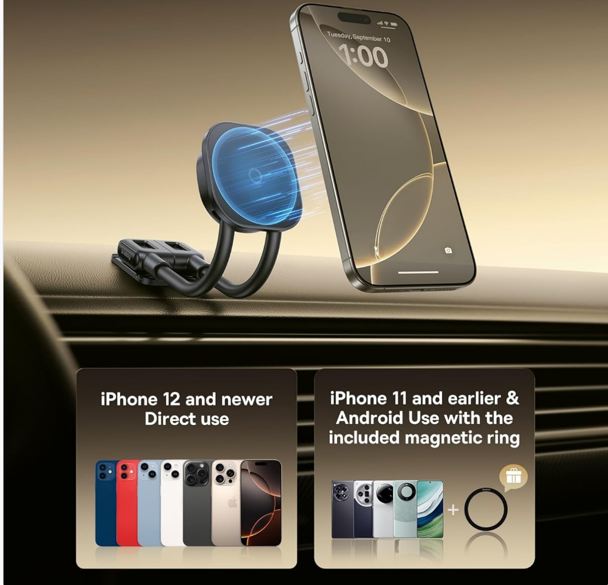
Image: Demonstrates compatibility with iPhone 12 and newer for direct use, and iPhone 11/earlier and Android phones using the included magnetic ring.

Case-Friendly with the Included Magnetic Ring