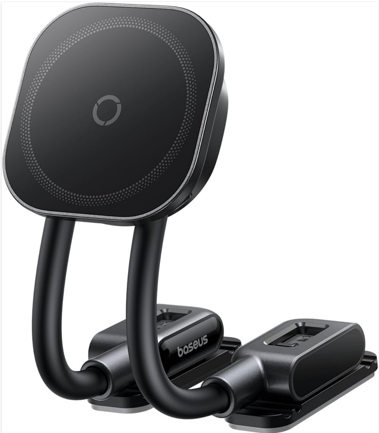
Image: The Baseus Dual Arm Adjustable Magnetic Car Phone Mount, showcasing its two flexible arms and magnetic phone attachment pad.