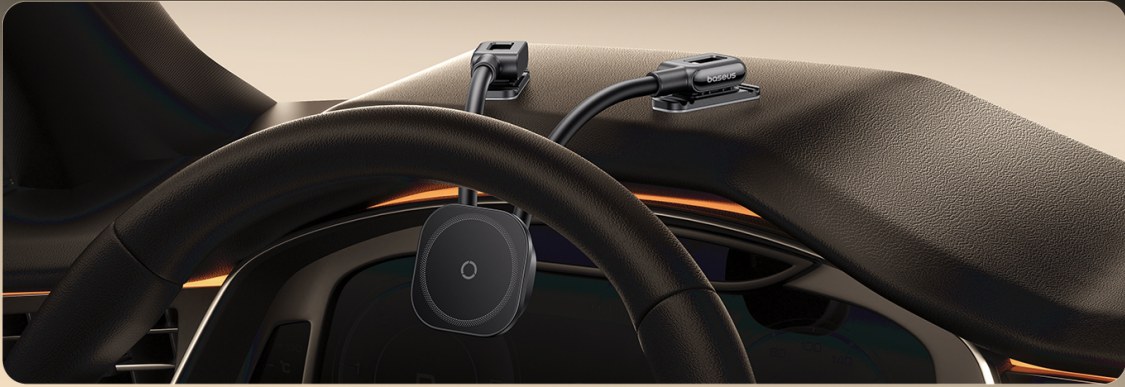
Image: Instructions for adjusting the detachable bases for flexible orientation before mounting.