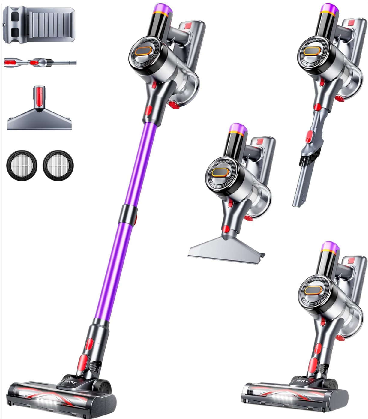
Figure 2: Overview of VIAFLY V16PRO-3 components.