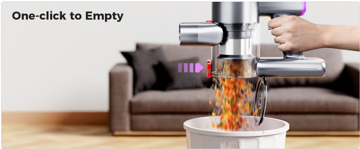
Figure 8: One-click dustbin emptying for hygienic disposal.