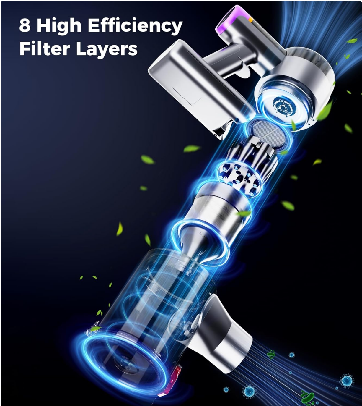
Figure 9: The 8-layer high-efficiency filtration system.