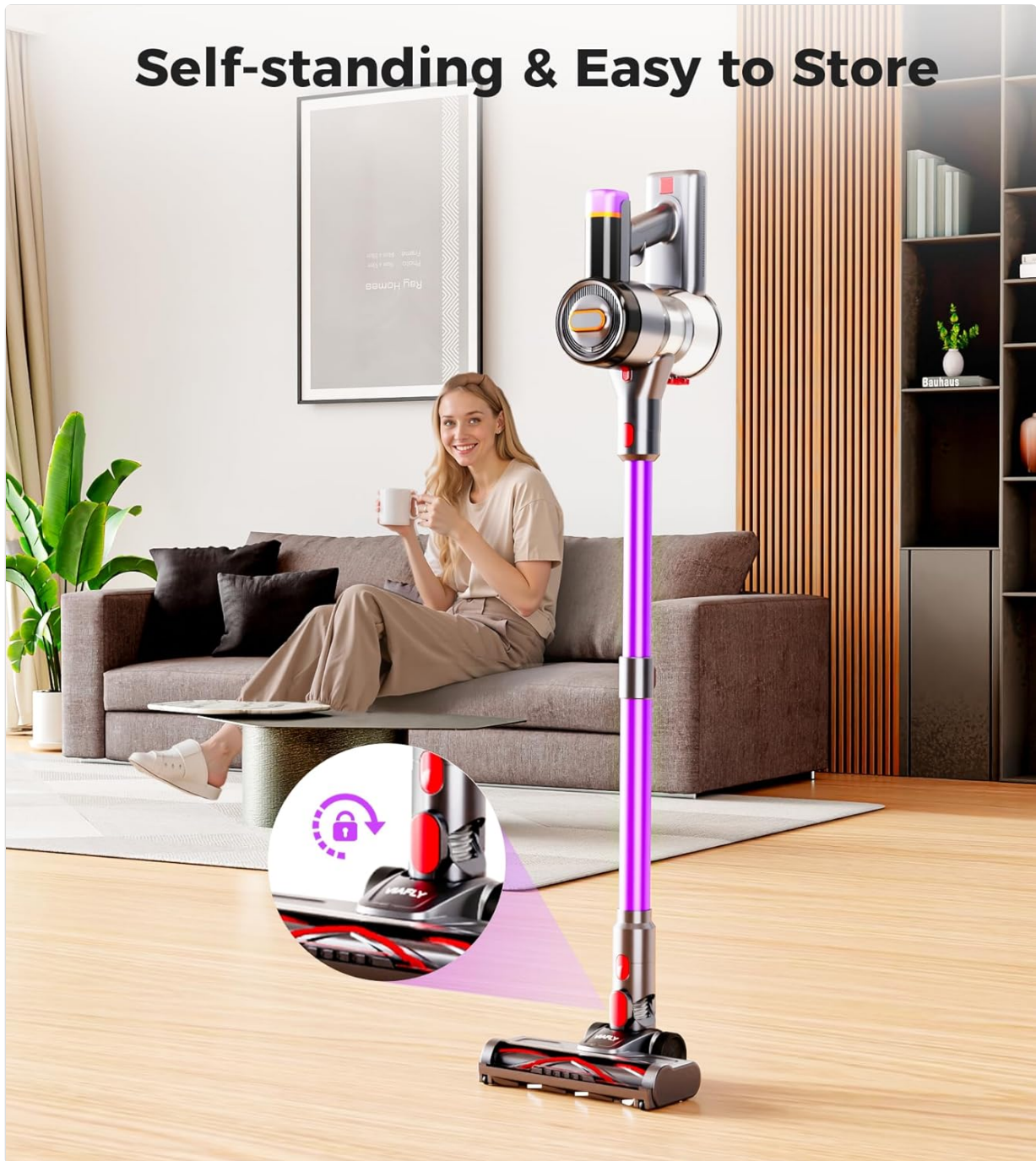
Figure 7: The self-standing design for easy pausing and storage.