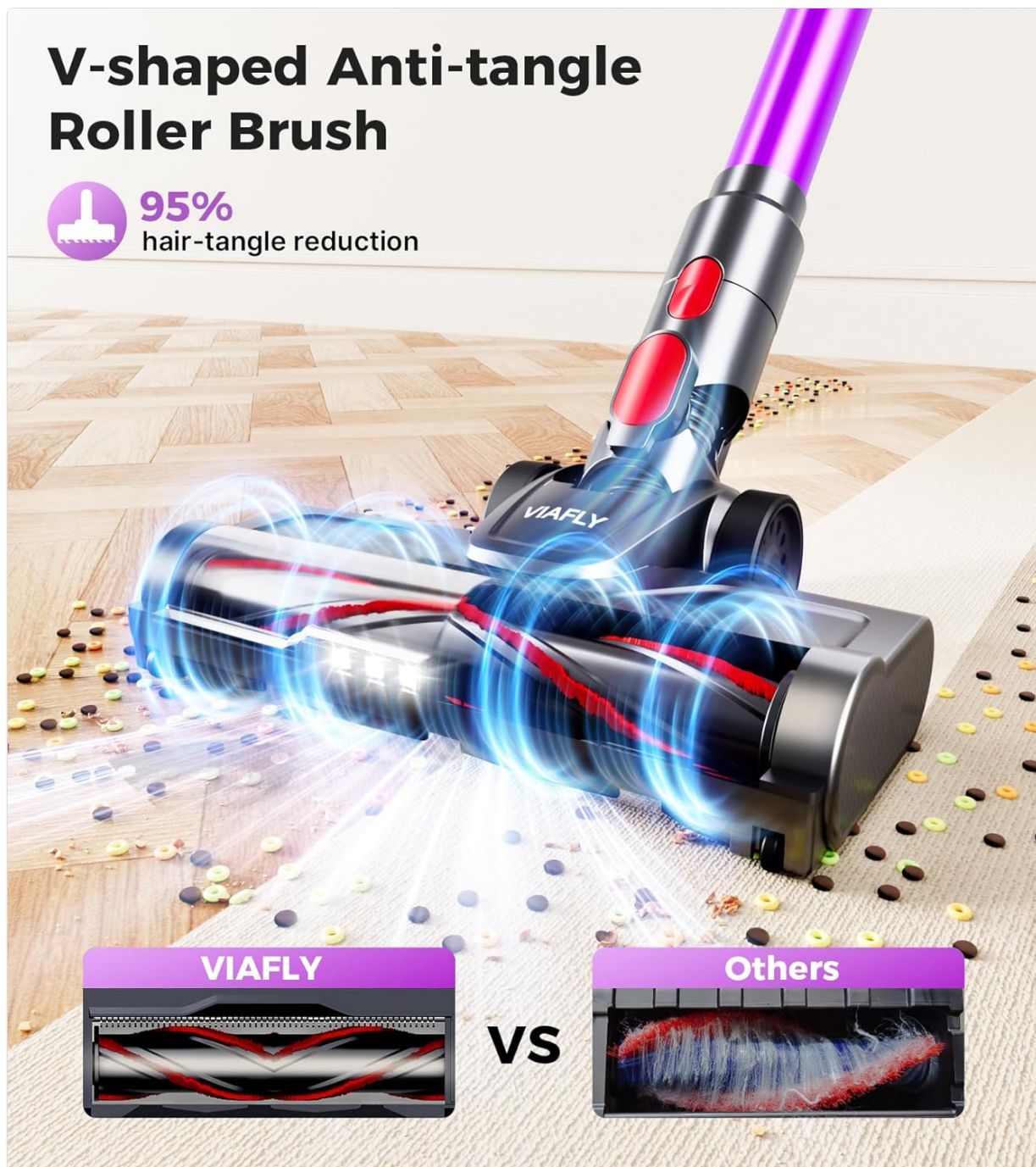
Figure 10: V-shaped anti-tangle roller brush design.