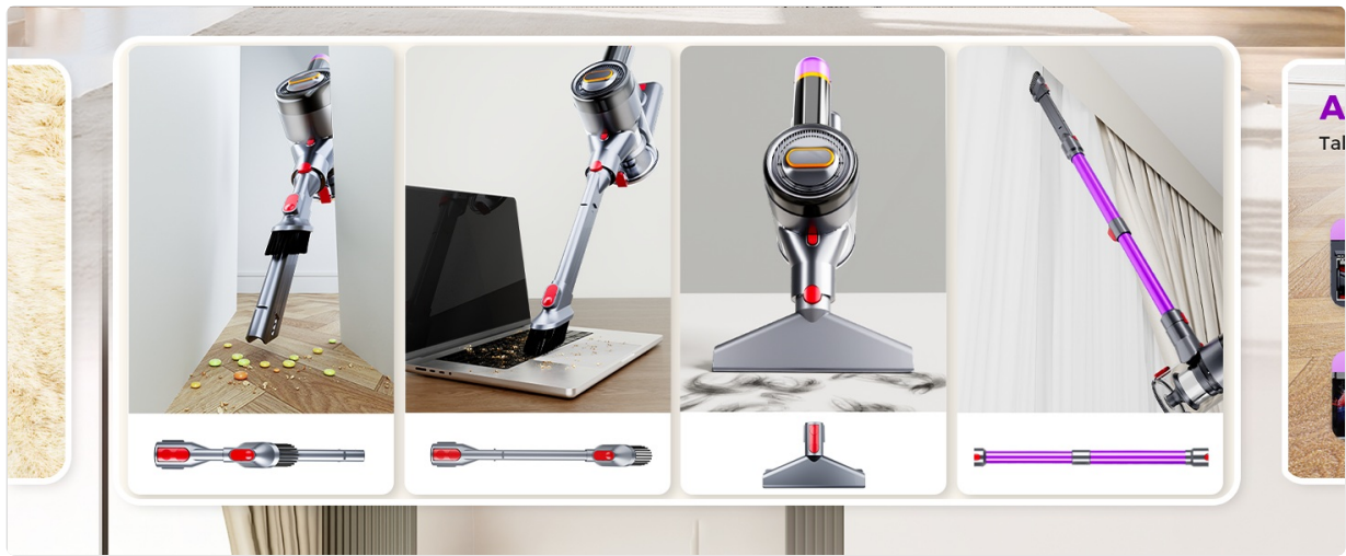
Figure 6: Multi-functional attachments for diverse cleaning needs.