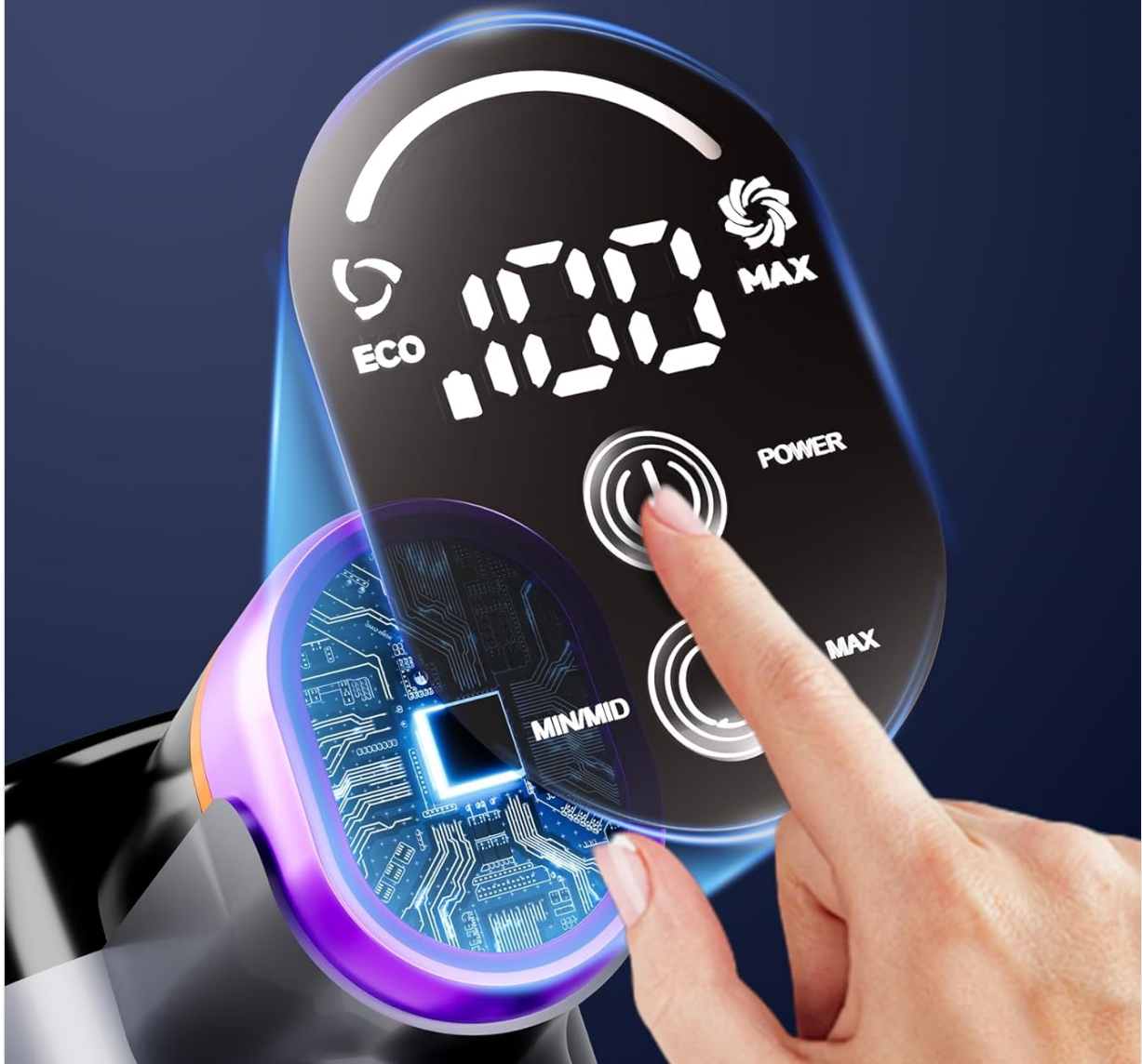
Figure 5: LED display showing power and suction settings.