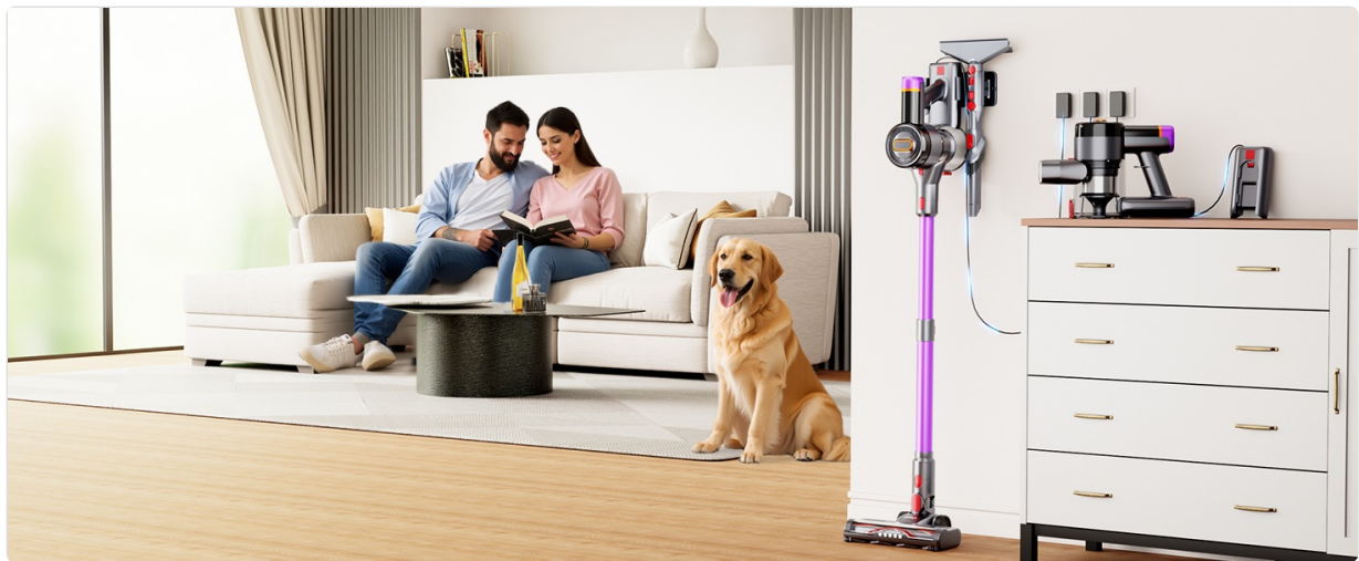
Figure 4: Wall mount charging for convenient storage and power.

Before first use, fully charge the vacuum cleaner. Connect the adapter to the charging port on the battery or the wall-mount charging station. The LED display will indicate charging status.